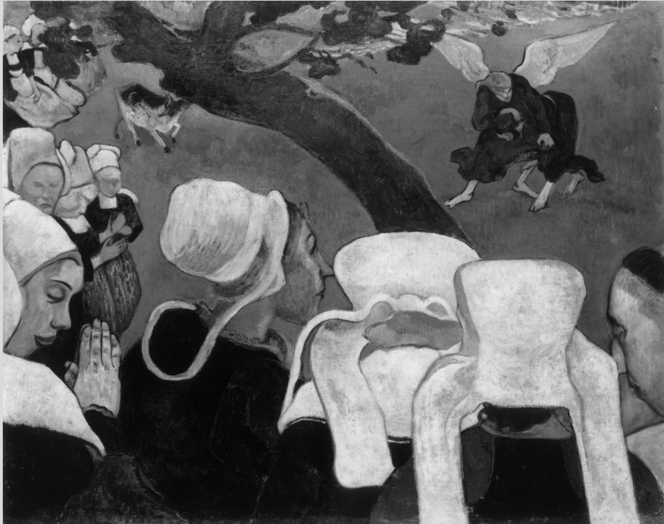
Figure 2 Paul Gauguin, The Vision After the Sermon , 1888. (National Galleries of Scotland, Edinburgh. Reproduced by permission.)

vision of the mystic Emanuel Swedenborg's "inner eye of man." Aurier calls for an art that eschews illusionism and instead uses all the means necessary (including simplification, exaggeration, and distortion) for the expression of the Idea. We can also find in Aurier's definition of "the strict duty of the ideist painter . . . to use in his work only the lines, forms, general and distinctive colors that enable him to describe precisely the ideic significance of the object," a close equivalent to the concept of "significant form" in the work of Fry and Bell more than 20 years later (Part I). The high estimation of the "primitives" of the quattrocento is also common to all three critics. Aurier's elevation of "decorative" painting and his final demand to give Gauguin "walls! walls!" is compatible with Gauguin's own working methods, for as Maurice Denis recalled: "[Gauguin] loved the matte effect of frescoes and that is why he prepared his canvases with thick coats of white gesso. . . . His art contains more of tapestries and stained glass than it does of oil painting." 25