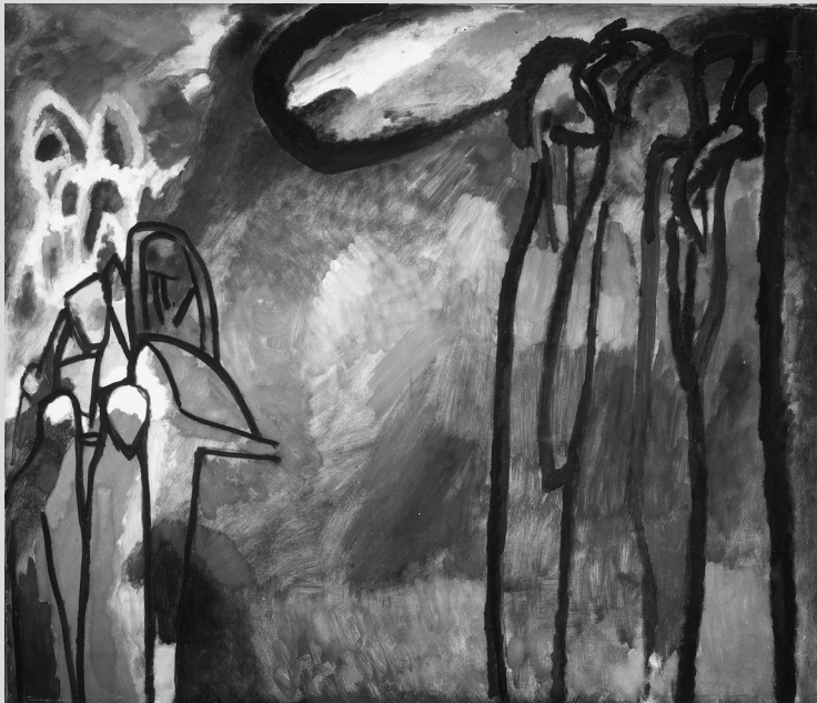
Figure 3 Wassily Kandinsky, Improvisation 19 , 1911. (Inv. no. GMS 79. Städtische Galerie im Lenbachhaus, Munich. Reproduced by permission.)

Underpinning On the Spiritual in Art is Kandinsky’s principle of “inner necessity.” 34 In keeping with the dialectical nature of Kandinsky’s concept of the creative spirit, “inner necessity” involves both the universal and individual. It is an eternal “invariable law of art” inherent to the creative work itself 35 and an active, incessantly changing, creative force of emotion in the artist. For Kandinsky, this was thus no less than the foundation for “the expression of the