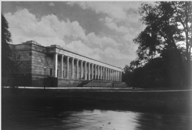
Figure 6 The “House of German Art,” Munich, 1937.

Artists and intellectuals on the Left across Europe had been inspired by the revolution in Russia at the end of the war, Soviet culture to the mid-1920s, and their own hopes for the revolutionary potential of art. However, by the mid-1930s, evidence of the regimentation of Russian culture under Stalin, the campaign against formalism, and events such as the show trials of prominent