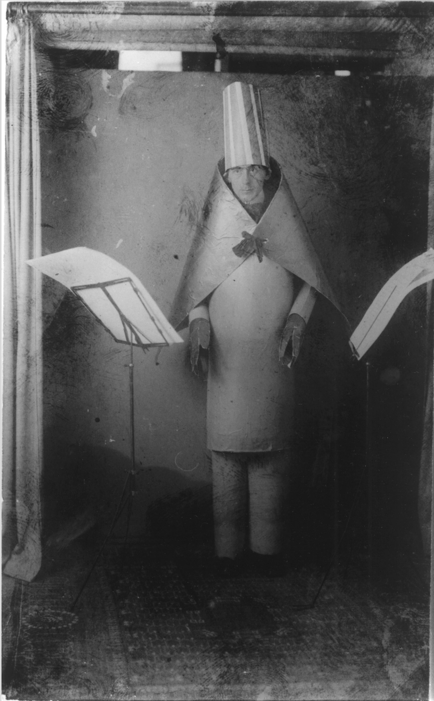
Figure 1 Hugo Ball in cubist costume, Zürich, 1916. (Kunsthau Zürich, Dada-Archive. © Kunsthau Zürich. All rights reserved.)