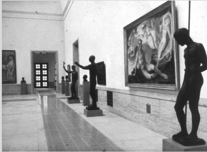
Figure 5 The interior of the “Great German Art Exhibition,” Munich, 1937.