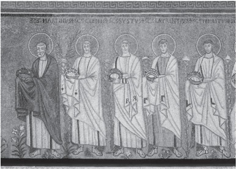
Plate 1 Procession of saints in the Church of Sant'Apollinare Nuovo in Ravenna, Italy.

moving in the same direction as the worshiper looking towards the altar.