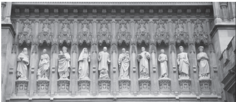
Plate 11 Westminster Abbey's homage to the contemporary martyrs.

passive martyrs (the Jesuanic martyrs about whom Sobrino has written) – the disenfranchised who simply “disappeared,” dead who remain nameless. 13