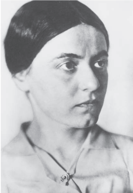
Plate 10 Edith Stein (Teresa Benedicta of the Holy Cross, 1891–1942).

their lives were witness to truth against falsity and love against hate. Theologians as early as Thomas Aquinas and as recently as Karl Rahner have asked for a more generous understanding of martyrdom as a complex response to death involving fortitude, faith, love, and a willingness to die for truth. Pope John Paul II has argued in a number of places that the best evidence of Christian ecumenism is to be found in the martyrs of the twentieth century – Catholic, Protestant, and Orthodox – who have given