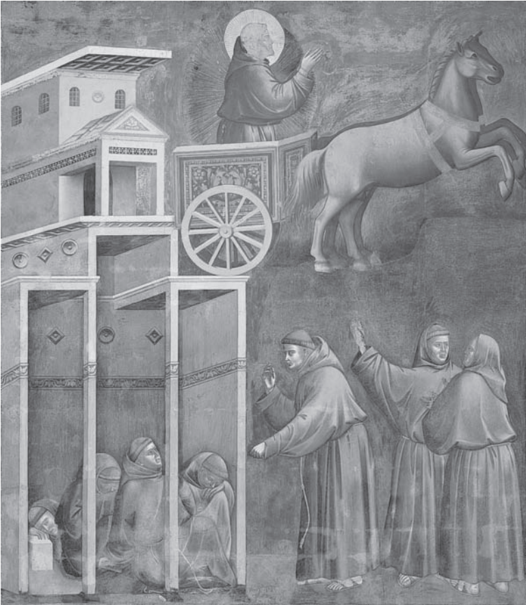
Plate 2 Saint Francis of Assisi (?1181–1226).

to the papacy, taking the name of Gregory IX. He had known Francis and had served as the cardinal protector of the Franciscan Order. Almost immediately after his installation as pope, Gregory did two things that put the canonization of Francis on the fast track: he ordered a life of Francis to be written and he issued a