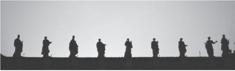
Plate 4 The colonnaded arcade around St Peter's Square, Rome.

to model his life on the lives of the saints by undertaking a series of experiments in his own life as a pilgrim, penitent, ascetic, and so on, until his life took definitive shape. When, in the famous section of Ignatius's "Rules for Thinking with the Church" in his Spiritual Exercises , he insists that "we should show our esteem for the relics of the saints by venerating them and praying to the saints" and "praise visits to the Station churches, pilgrimages, indulgences, jubilees, crusades, indults, and the lighting of candles in churches," this was not merely paying lip service to the sixteenth-century church but a reflection of experiences and usages that shaped his own life. Indeed, these "Rules" could make a fair claim to be the vade mecum of militant Catholicism. 6