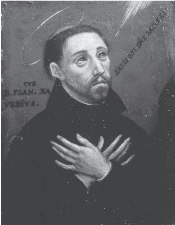
Plate 3 Saint Francis Xavier (1506–1551). Museo Casa de Murillo, La Paz.

great Spanish contemplative whose religious sisters would establish in France convents that had a tremendous impact on French spirituality in the seventeenth century.