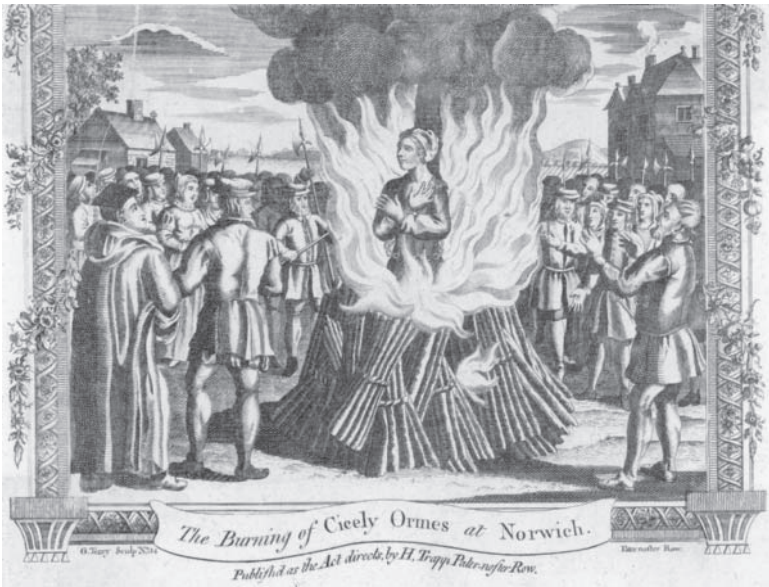
Plate 5 A woodcut from Foxe's Book of Martyrs (1563).

enhanced with vivid woodcuts, went through three more expanded editions within his lifetime. It has been said that, along with the King James Version of the Bible and the Book of Common Prayer, Foxe's work gave definitive shape to England as a Protestant nation. The Book of Martyrs , brought to the New World by dissidents who left England, became a staple of religious reading in North America well into the eighteenth century. To this day it is cited as an example of Christian witness among certain fundamentalists who have strong anti-Catholic sentiments as part of their worldview.