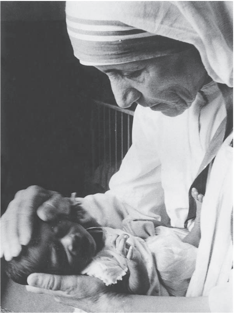
Plate 9 Mother Teresa of Calcutta (1910–1997).