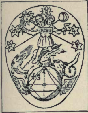
Fig. 1—Cut above.