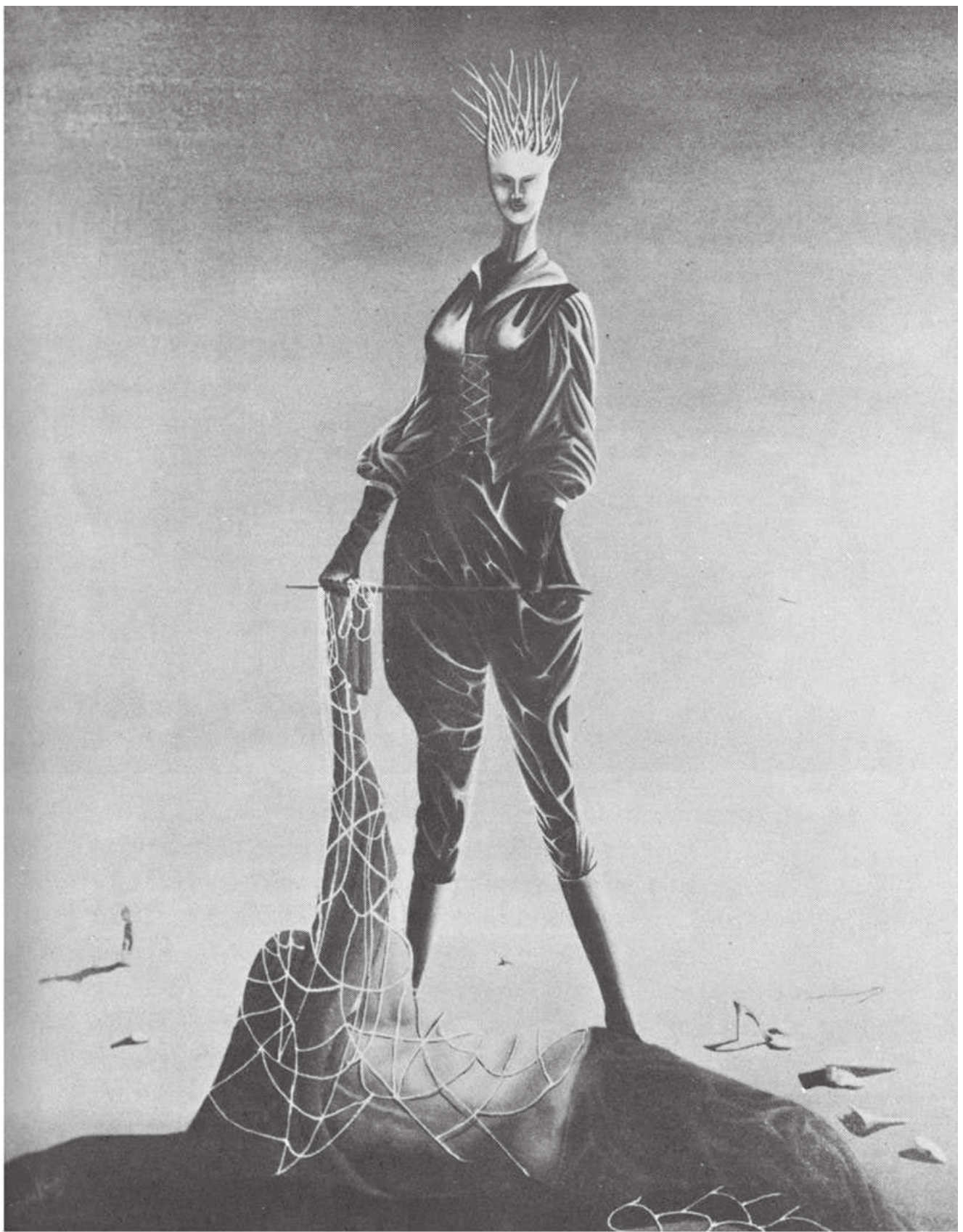
The oil painting reproduced above is part of a famous art collection in New York. This particular painting was done by a famous Spanish artist and shows a number of fetich garments being worn by the model.