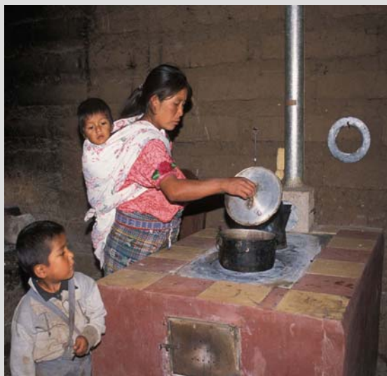
Figure 1: Woman using improved stove, Guatemala

At the end of the work, the remaining households in the study are provided with stoves.