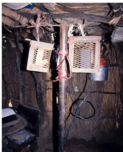
Figure 7: Equipment in metal cages – Sudan monitoring (Photo: Practical Action).

A particulate pump and a CO monitor are set close together 1.3m vertically and 1.3m horizontally away from the stove and monitoring is conducted for 24 hours. Where possible, the equipment is set away from walls and draughts. In Figure 7, from Sudan, it can be seen that all the electrical equipment is housed in locked 'cages' to prevent children from tampering with it.