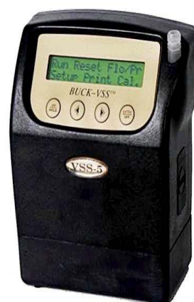
Figure 3: Buck low-flow sampling pump

Data from the CO monitor is downloaded, using a T-82 datalogger for both room and woman. The similarities show that the woman inhales most smoke when the fire is alight. It can also be seen that she was inhaling some smoke around 4.00pm in the afternoon - perhaps she had a visitor who was smoking