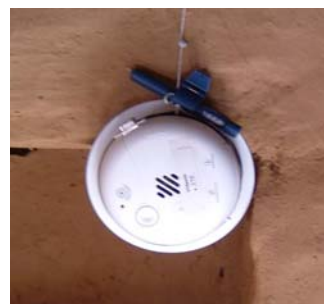
Figure 4: UCB monitor