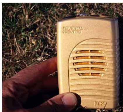
Figure 5: T82 Carbon monoxide monitor

There are two main types of equipment for monitoring carbon monoxide in this type of work. The first is a 'stain tube', which is a small tube, made of robust glass inside which is a sensor which changes colour with exposure to the gas. These tubes are useful if only a small number of measurements are to be made, but as they can only be used once, they are expensive for larger numbers of samples. They give an indicator of CO levels, but are difficult to interpret accurately and do not give real time data