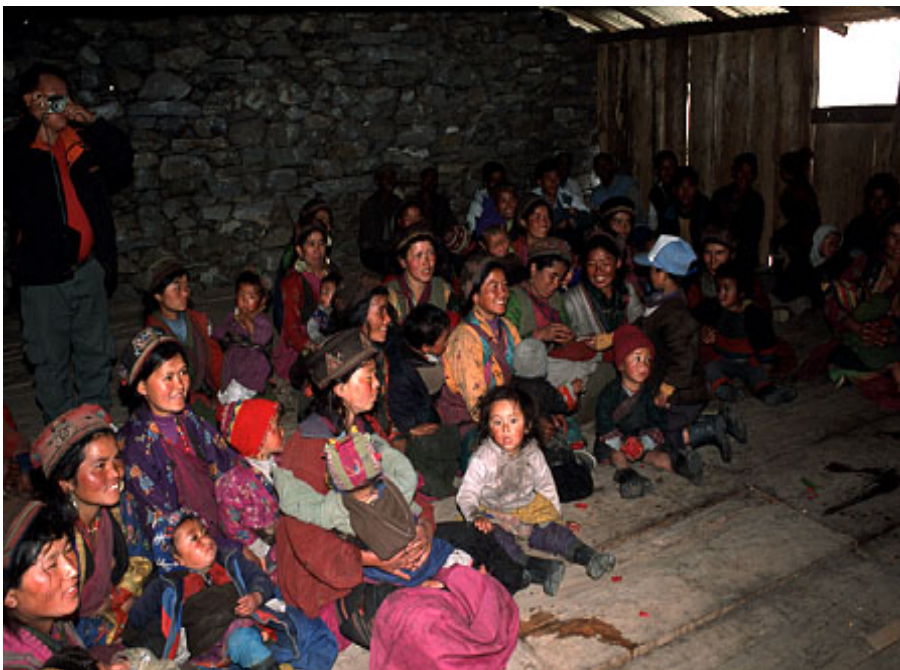
Figure 2: Nepal community meeting

Community participation (Figure 2) is essential from the start. Representative households should be identified by the community themselves, although various criteria can be required - eg children under five; enthusiastic to work with the project. Community meetings and discussion will promote participation and ensure that findings are relevant to the project communities.