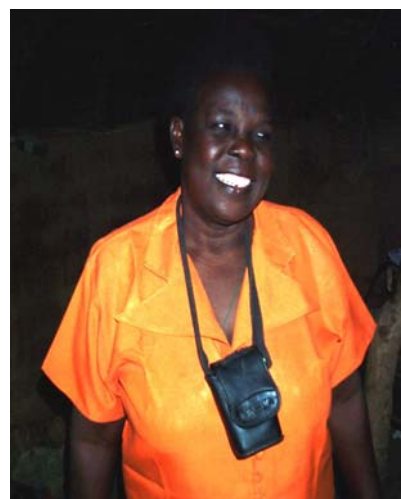
Figure 8: Woman wearing CO monitor around neck.

At the same time, the cook is asked to wear a CO monitor round her neck during monitoring: The monitor is attached and a check is made that she feels comfortable. Many people thought the participants were wearing mobile phones.