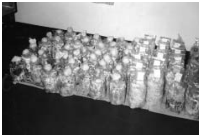
Figure 4. Recently inoculated bags