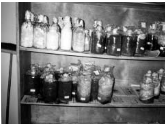
Figure 2. Cultures stored in a cabinet at room temperature. Small farmers cannot afford the methods of culture preservation