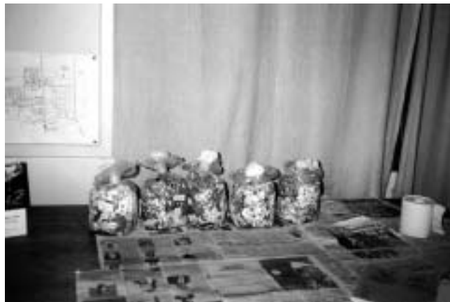
Figure 5. Bags of sawdust inoculated with shiitake ready for fruiting