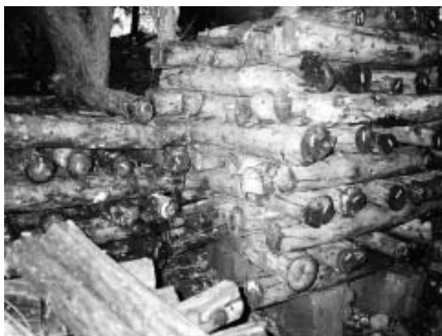
Figure 6. A pile of tree logs during spawn run