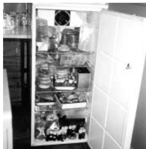
Figure 3. A collection of cultures stored in a refrigerator. The cultures normally lose their vigour after six months of storage. This may be due to electricity power fluctuations which are very common and prolonged.

This writer knows of several people working in the commercial farms who have received training in Japan, Britain, France and Belgium. Few local farmers are able to go abroad for training and are discouraged from entering the mushroom cultivation business as a result.