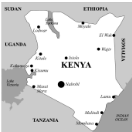
Figure 1. Map of Kenya

Kenya is a medium-sized, East African, tropical country with a total land area of 582,646 sq. km. The equator cuts the country in half so the sun is usually directly overhead. This third world, Sub-Saharan country has a population of 30 million people.