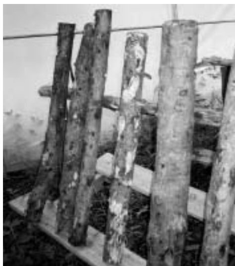
Figure 7. Logs producing a few mushrooms. The logs are kept inside a green house in order to fruit. The major challenge in this green house is overheating during the day. This problem is solved by shielding it from direct sunlight.

There are a few people in Kenya currently growing oyster mushrooms for home consumption. In August, 2003, a project was initiated involving over one hundred families whereby they grow Pleurotus sajor-caju at home in small spaces like their kitchens. The major aim of this initiative is to provide the people with alternative food sources to counter the problem of malnutrition in Kenya. Many people in the rural areas and the urban slums suffer from malnutrition because the prices of foods rich in protein and minerals are generally expensive.