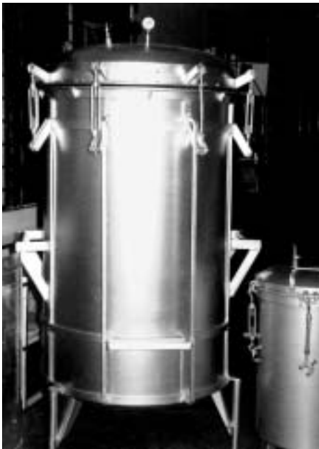
Figure 13. Autoclave for large scale preparation of culture media