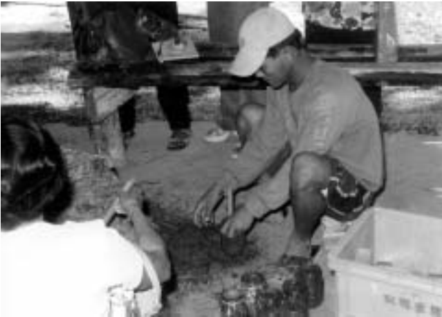
Figure 11. Tobacco midribs in glass bottles