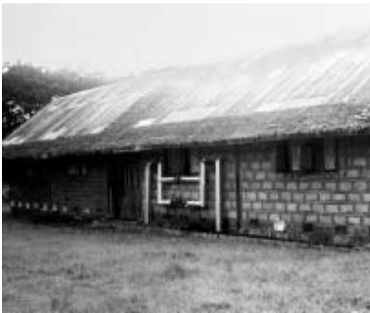
Figure 9. Mushroom growing house

In order to encourage mycelial proliferation of V. volvacea , the mushroom house should be sealed. During this stage, it is very important to maintain the desirable temperature for mycelial ramification (30-35°C) with no ventilation and light. The spread of mycelia takes from seven to ten days after spawning. After this period, growers should check the status of the substrates. Fruiting initials should start to appear. At this point, the temperature should be lowered from 35 to 28°C. This can be done by sprinkling clean water on the floor of the mushroom growing house. Three to five days after the appearance of these fruiting initials, the first harvest of the button stages of V. volvacea can be performed.