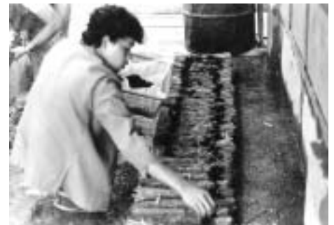
Figure 4. Spawning

The bundled substrate should be drained of excess water to attain a 65% moisture content. Growers should pile the bundled substrates one after the other into the bed forms. On top of every layer, spawn should be sprinkled thinly over the bundled substrates. An ideal bed size consists of six layers and has a length of three meters.