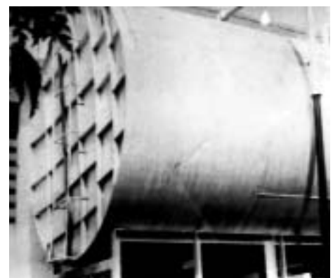
Figure 8. Steaming of rice straw