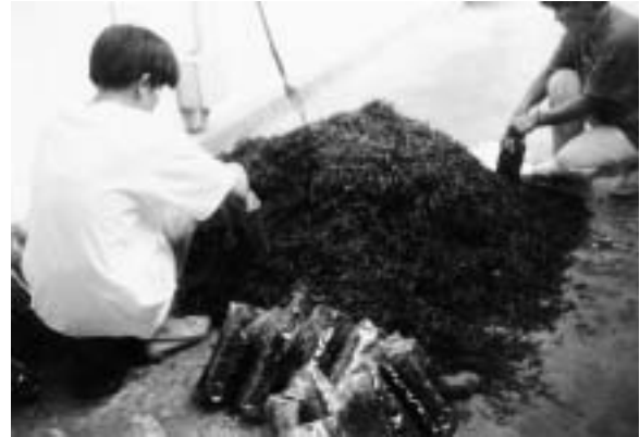
Figure 12. Tobacco midribs in polypropylene bags