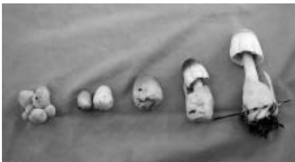
Figure 1. Paddy straw mushrooms at different development stages

Paddy straw mushroom ( Volvariella volvacea ) is the most popular mushroom in the rural areas of the Philippines and was commonly known to Filipinos even before the generation of a technology for its artificial cultivation was launched in the country. This mushroom is called kabuteng dayami or kabuteng saging by Filipinos since it naturally grows on paddy straw and decomposing piles of banana leaves and pseudostems.