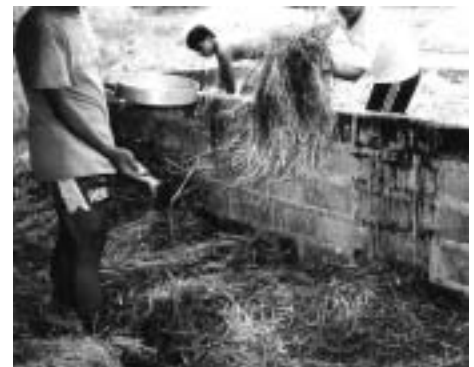
Figure 7. Composting of rice straw