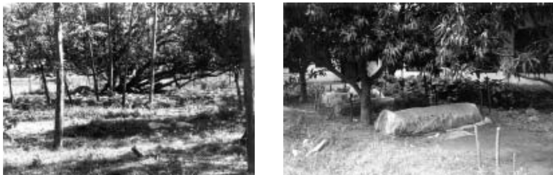
Figure 2, 3. Bed-type production of paddy straw mushroom under the mango trees

The traditional outdoor method uses the bed-type approach and utilizes a number of agricultural wastes like dried paddy straw, rice stubbles, water lily, banana leaves, and stalks (Reyes and Abella, 1993). The use of these wastes as mushroom substrates depends on their local availability. The following is a description of the step by step procedure for the preparation of mushroom cultivation beds