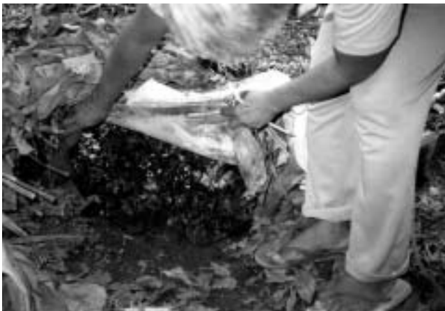
Figure 5. Covering the mushroom bed of dried banana leaves

A plastic sheet should be used to cover the entire mushroom bed. This sheet maintains the appropriate temperature for the mycelial ramification (30-35 °C) and fruiting body formation (28-30 °C). It usually takes 10-14 days before the first flush of marketable fruiting bodies (button stage) come out from the edge of the mushroom bed.