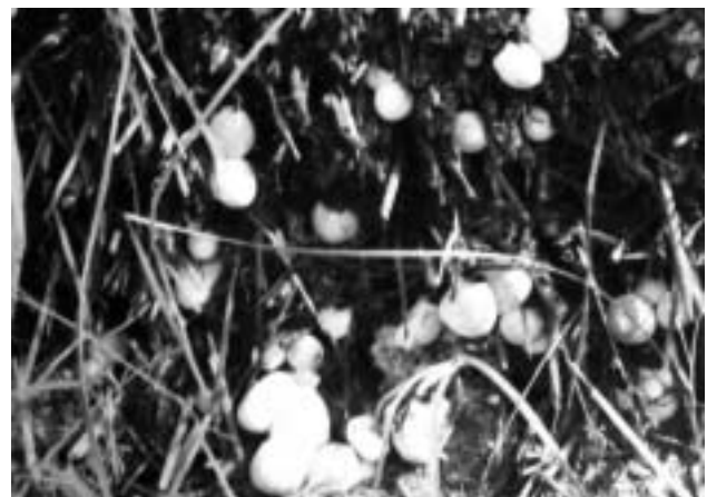
Figure 6. Paddy straw mushrooms in the rice straw bed