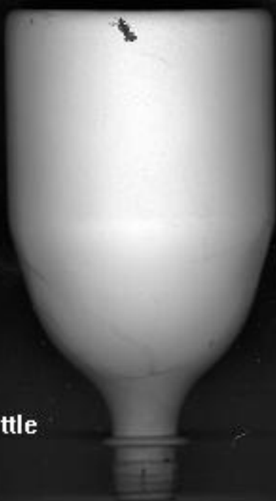
2 Liter Bottle