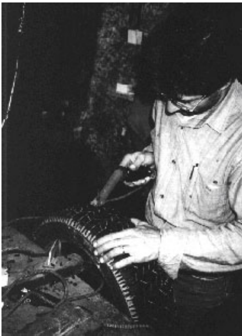
Figure 3: Following the grooves is a Labour –intensive process.

Secondary reuse of whole tyres is the next step in the waste management hierarchy. Tyres are often put to use because of their shape, weight, form or volume. Some examples of secondary use in industrialised countries include use for erosion control, as tree guards, in artificial reefs, fences or as garden decoration. In developing countries wells can be lined with old tyres, docks are often lined with old tyres which act as shock absorbers, and similarly crash barriers can be constructed from old tyres. Old inner tubes also have many uses; swimming aids and water containers being two simple examples.