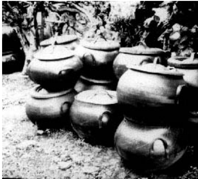
Figure 4: Garbage containers made from Truck tyres. Manila, The Philippines

Another way in which physical reuse can be achieved is by reducing the tyre to a granular form and then reprocessing. This can be a costly process and there has to be a manufacturer willing to purchase the granules. Crumb rubber from the retreading process can be used in this way, as it is a good quality granulated rubber. The reprocessing techniques used are similar to those described in earlier chapters. Granulate tends to be used for low-grade products such as automobile floor mats, shoe soles, rubber wheels for carts and barrows, etc., and can be added to asphalt for road construction, where it improved the properties of this material.