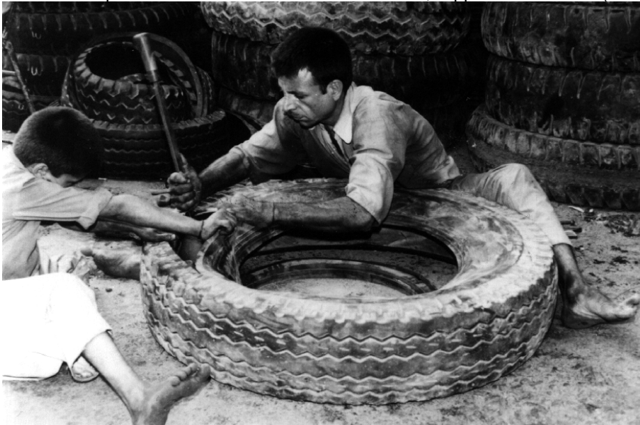
Figure 2: Manual Separation of the Tread from the Sidewalls, Karachi, Pakistan

In Karachi, Pakistan, for example, tyres are collected and cut into parts to obtain secondary materials which can be put to good use. The beads of the tyres are removed and the rubber removed by burning to expose the steel. The tread and sidewalls are separated – the tread is cut into thin strips and used to cover the wheels of donkey carts, while the sidewalls are used for the production of items such as shoe soles, slippers or washers (WAREN Report).