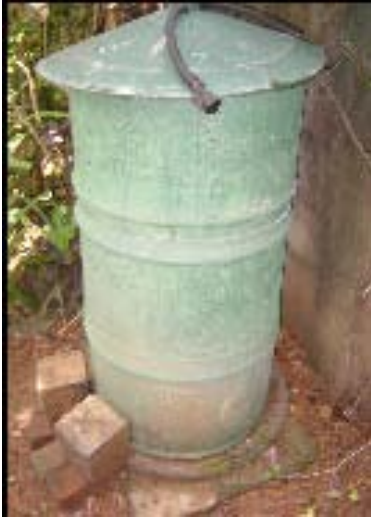
Concrete bin widely used in Sri Lanka