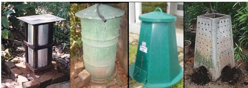
Plate: Different composting bin designs available in Sri Lanka.

Bin composting is the most popular and advance version of home composting system that overcomes problems experienced in other composting systems. There are different types of bins available for home composting and generally it varies from 200- 300L in size. These are from different materials such as cement/concrete, plastic, metal, etc. The bins allow higher stacking of composting materials and better use of floor space than free-standing piles. Bins can also eliminate weather problems and reduce problems of odours, and provide better temperature control. At present, most bins are designed to suit the urban landscape as well.