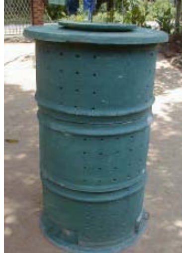
Bin with modifications

When bin designs were identified at the beginning, it did not include aeration holes in the bottom ring. Aeration is a critical factor for composting process and as a result, delayed composting and bad odour problems were identified.