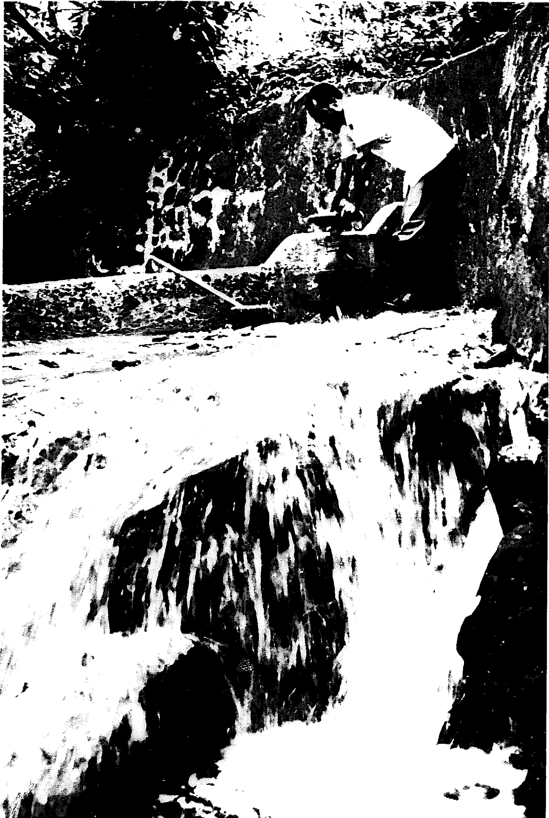
J. Vizcarra Brenner PAHO

A water caretaker in Saint Lucia diverts surface water to a reservoir for disinfection. Preparedness includes assessing the vulnerability of water treatment plants and reservoirs.