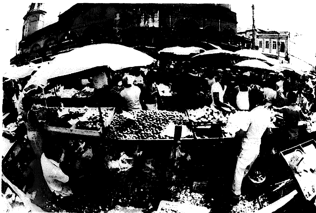
J. Vizcarra Brenner/PAHO

Utmost in importance is surveillance of the sources and quality of the water supply used in food preparation, the cleanliness of the premises where food is handled and prepared, washing facilities, sanitary storage of food supplies (including refrigeration), and facilities for sanitary excreta disposal. Testing of milk quality to determine