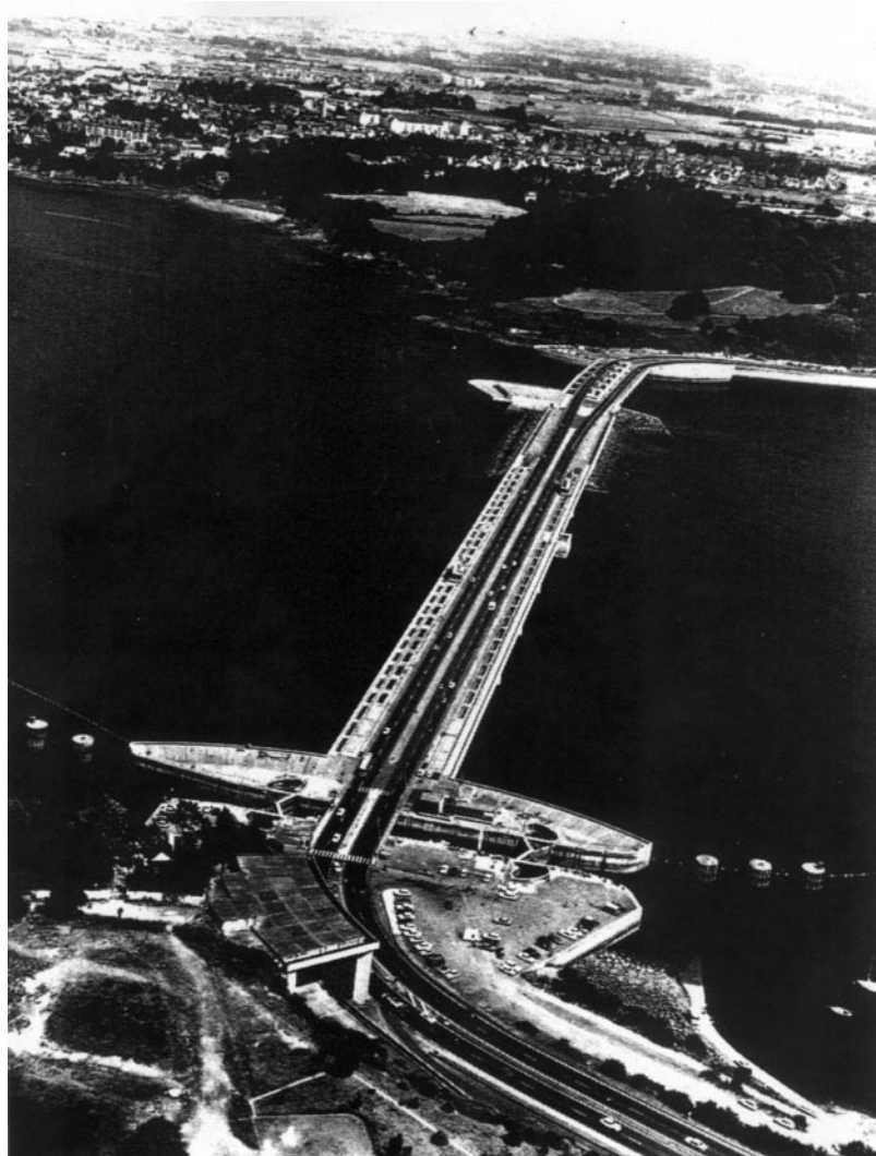
Figure 1 Aerial view of the La Rance Tidal Power Plant.

for operation of hydraulic turbines; a number of turbines coupled with electric generators installed at the lowest point of the dam; and hydraulic gates in the dam to control the water flow in and out of the water basin behind the dam. Sluice locks are also used for navigation when necessary. The turbines convert the potential energy of the water mass accumulated on either side of the dam into electric energy during the tide. The tidal power plant can be