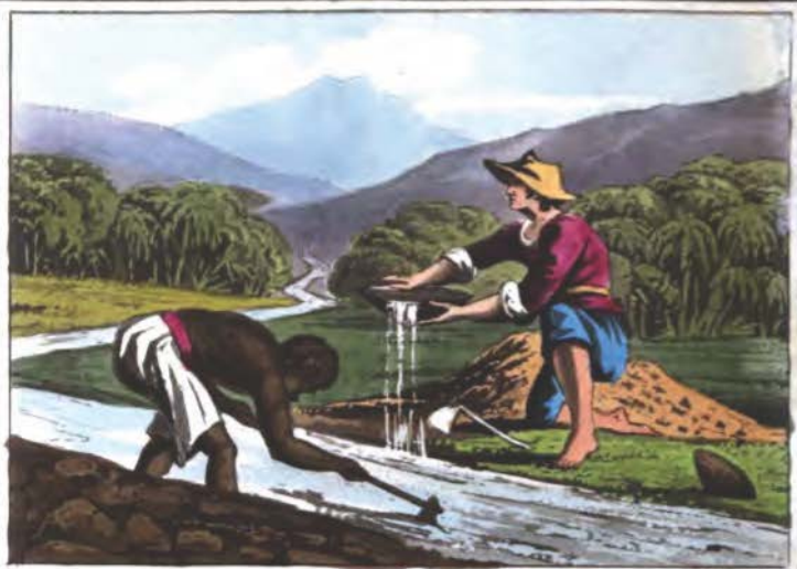
A BRAZILIAN MINER WASHING THE ALLUVIAL SOIL (RAKED FROM THE RIVULET) FOR GOLD & DIAMONDS.