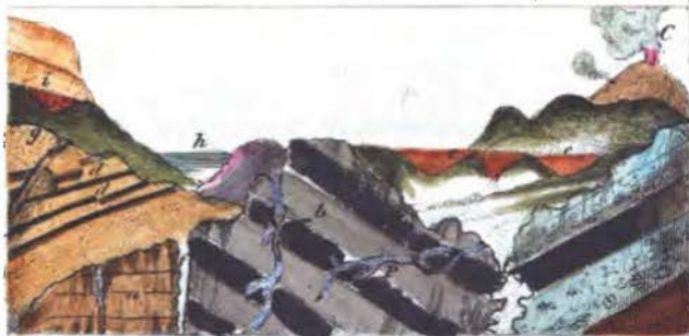
Stratified Rocks, Hotz Formations and alluvial deposit.