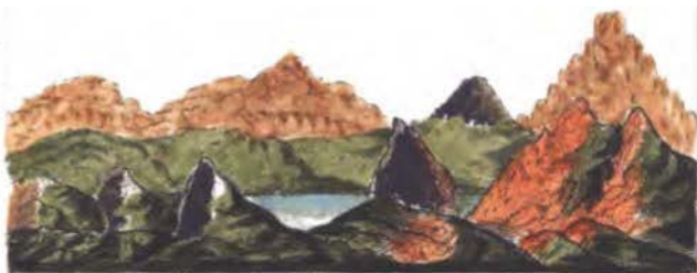
Primitive Rocks & Secondary.