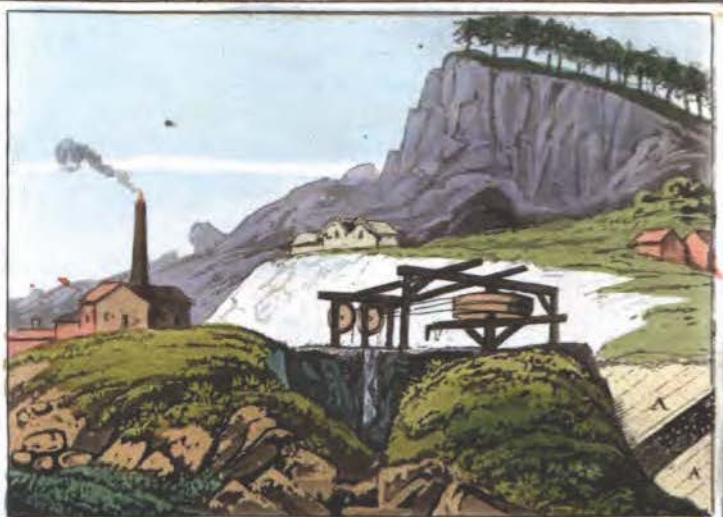
VIEW NEAR MATLOCK, DERBYSHIRE.