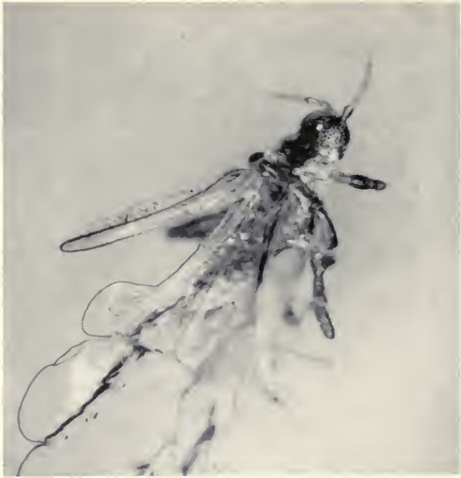
FIG. 101. Hercinothrips extinctus sp. nov. \times 63 .

Antennal segments I and II concolorous with body, segments III to VIII yellowish. Wings pale, colorless, or faintly yellow, without dark bands or dark areas.