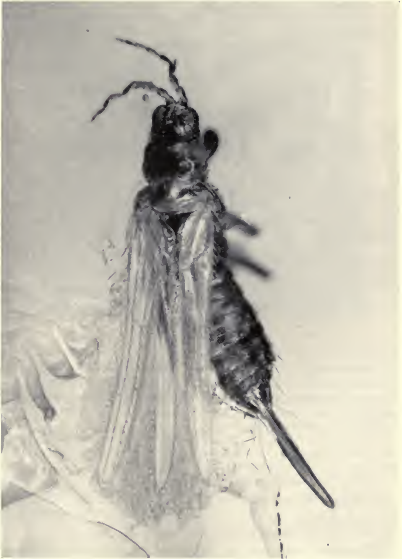
FIG. 100. Stenurothrips bagnalli sp. nov. \times 73 .