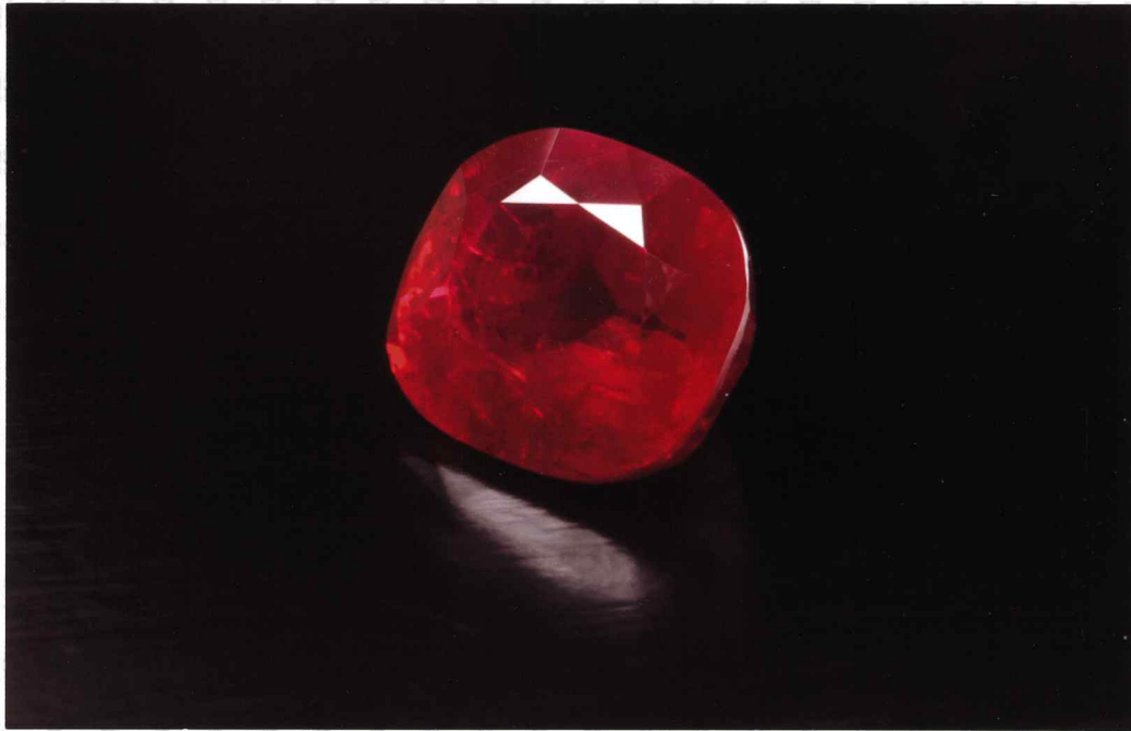
The 25.59 ct 'Sunrise Ruby'

The high esteem with which it has long been held in the East is perfectly expressed by two of its names in Sanskrit: 'Ratnaraj', 'king of the precious stones' and 'Ratnanayaka', 'leader of precious stones'. The outstanding colour of ruby is attributable to the introduction of chromium oxide, which found its way into the corundum structure an infinite number of years ago and replaced a small percentage of alumina.