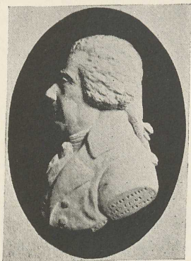
IX. JAMES TASSIE.