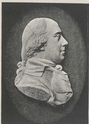
XVII. PROFESSOR DUGALD STEWART.