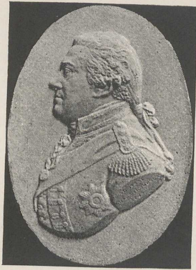
XIII. ADMIRAL VISCOUNT DUNCAN.