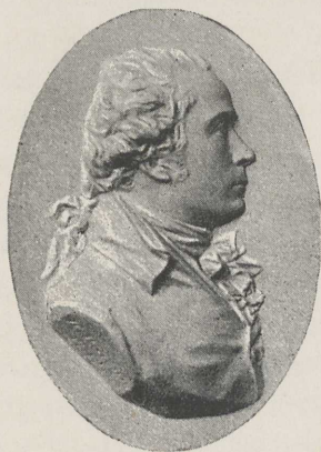
VI SIR HENRY RAEBURN, R.A.