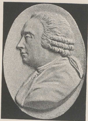
XIV. DAVID HUME.