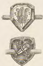
SIGNET. Double size linear.

beneath is a ribbon which bears the motto ICH . DIEN . It is set as a ring in enamelled gold, painted behind the bezel with a bow and quiver crossed saltirewise on the dark blue ground. The hoop has a simple edging. (See woodcut)