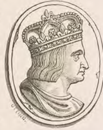
CAMEO. LOUIS XII. Double size linear.

It is mounted in a modern setting of gold as a ring, enamelled with fleurs-de-lis on the shoulders; on the gold plate at the back of the bezel is engraven the inscription " Loys XII me Roy de France décéda 1 Janvier, 1515. "