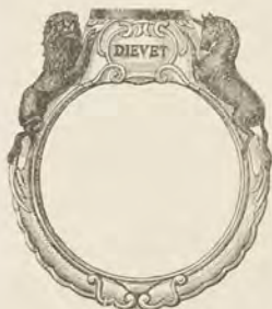
SIGNET RING, CHARLES I. Double size linear.