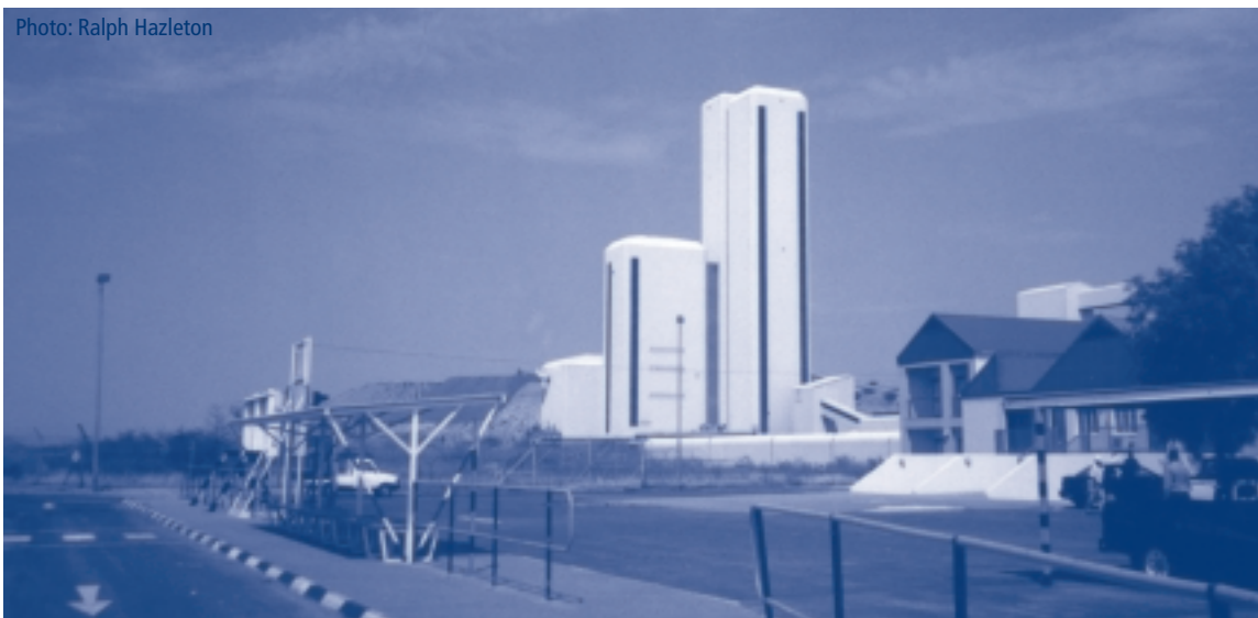
“The Aquarium”, Treatment Plant at Jwaneng Mine, Botswana