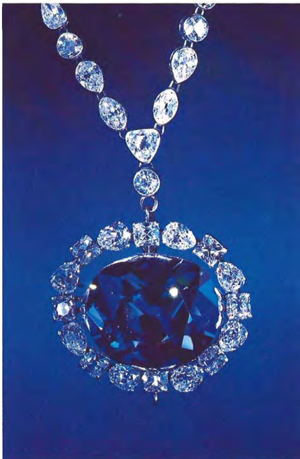
Figure 4. The legendary 45.52-ct Hope diamond was donated to the Smithsonian Institution by Harry Winston.