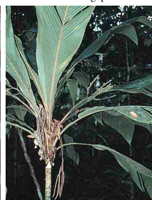
28 ttesi cofaje Geonoma triglochis