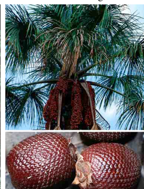
33 canongocho Mauritia flexuosa