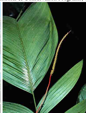
22 munda'si Geonoma brongniartii