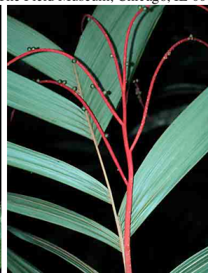
23 tsaoje'si Geonoma longepedunculata