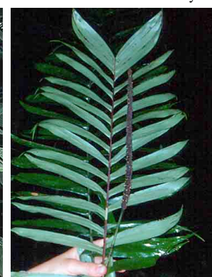
29 Geonoma sp.