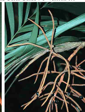
25 tsaoje'si zu'je Geonoma maxima