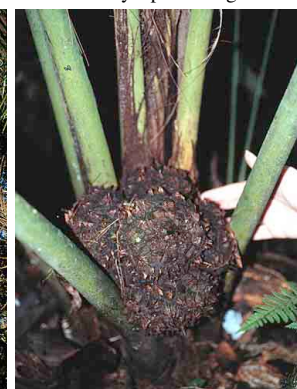
35 patisa'cco Ammandra dasyneura