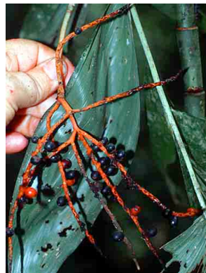
18 purivocho'si Chamaedorea pinnatifrons