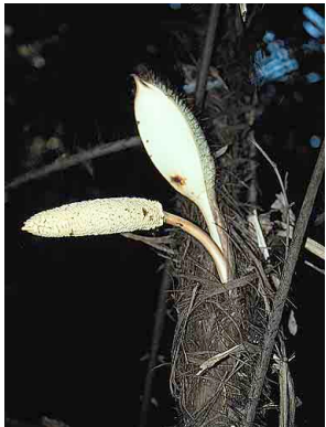
11 inzapara Bactris concinna