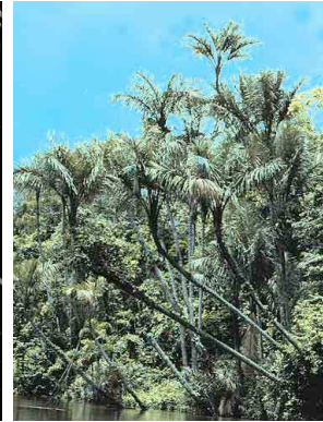
4 firirima Astrocaryum jauari