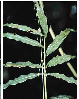
20 arponcho Desmoncus mitis