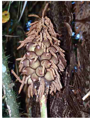
7 e'tsocho Astrocaryum murumuru