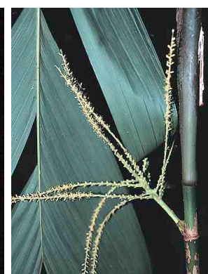
30 zu'jecho Hyospathe elegans