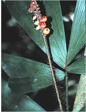
1 omacho'si Aiphanes ulei

© Centro Cofán Zabalo and Environmental & Conservation Programs, The Field Museum, Chicago, IL 60605 USA. [RRC@fmmh.org] Rapid Color Guide # 5 version 1.6