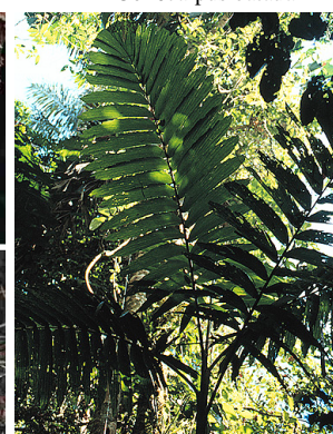
39 ccu'ye Wettinia maynensis