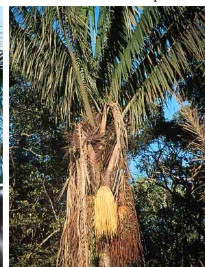
34 nijon'cho Oenocarpus bataua