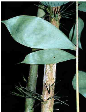
16 tsintsincho Bactris maraja