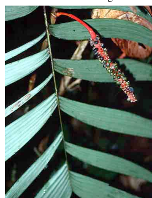
27 mundasi Geonoma stricta var. trailii