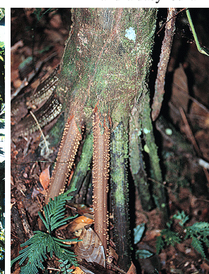
40 ccu'ye Wettinia maynensis