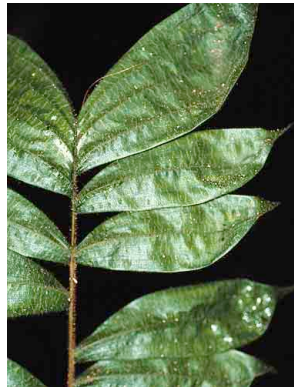
13 manambe o'ma Bactris hirta