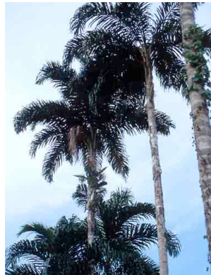
12 o'ma Bactris gasipaes