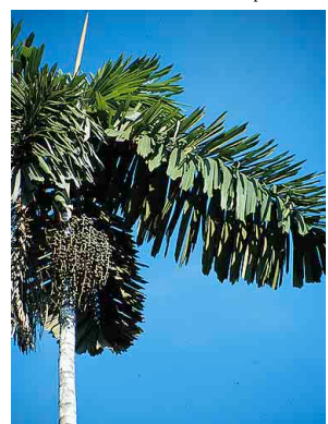
31 bom'bo Iriartea deltoidea