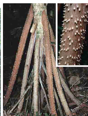
38 anacco, tssa tssa'vo Socratea exorrhiza