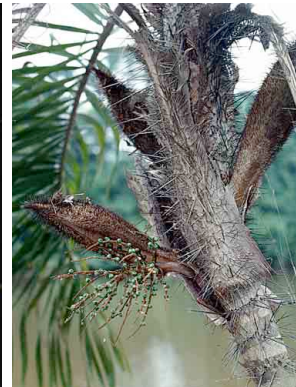
14 omacho'si Bactris riparia