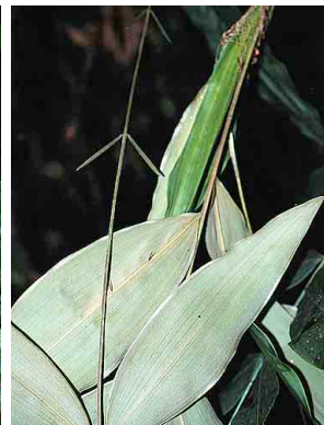
19 arponcho Desmoncus giganteus