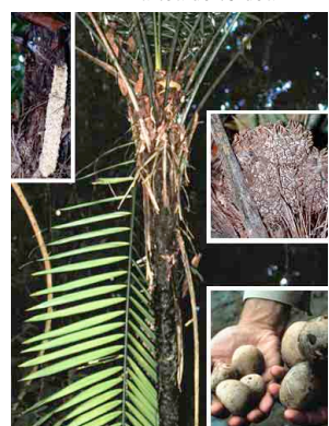
36 shishije Phytelephas tenuicaulis