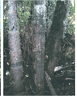
5 firirima Astrocaryum jauari