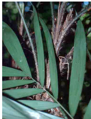
17 coincoiñocho Bactris sp.