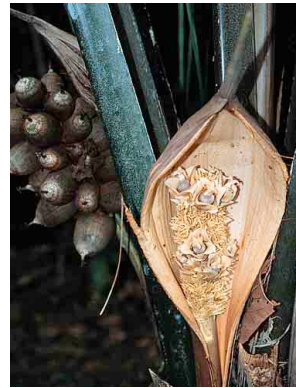
9 chapia inayova Attalea insignis