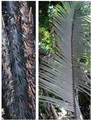
6 e'tso Astrocaryum murumuru