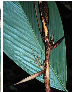
15 omacho'si antian Bactris simplicifrons