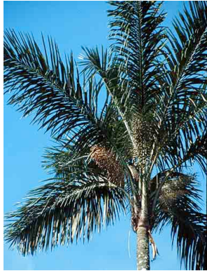
2 tuinfa Astrocaryum chambira