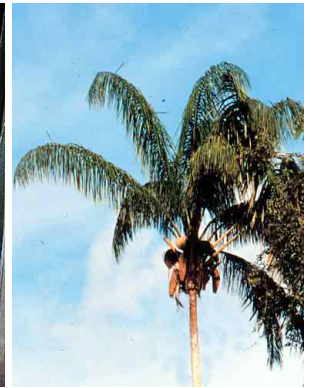
10 inayova Attalea maripa