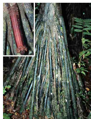
32 bom'bo Iriartea deltoidea