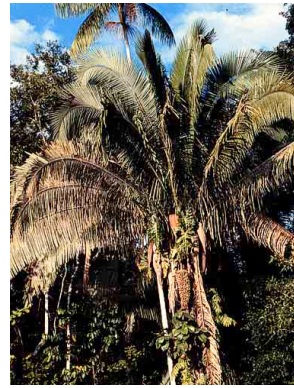
8 sapoje Attalea butyracea