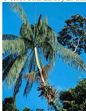
21 di'va Euterpe precatoria

© Centro Cofán Zabalo y Environmental & Conservation Programs, The Field Museum, Chicago, IL 60605 USA. [RRC@fmnh.org] Rapid Color Guide # 5 version 1.6