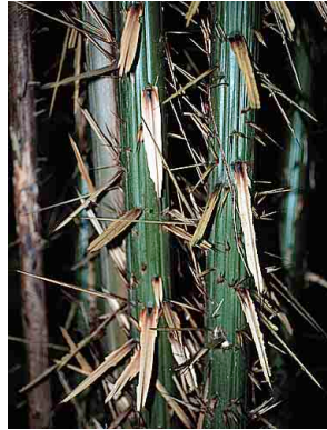
3 tuinfa Astrocaryum chambira