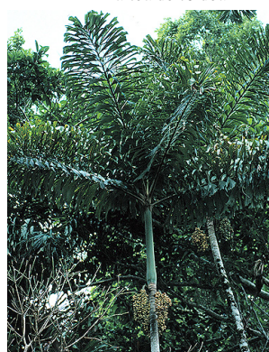
37 anacco Socratea exorrhiza