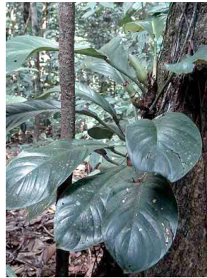
9 Philodendron wittianum ARACEAE