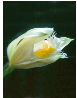
30 Sobralia fragrans ORCHIDACEAE