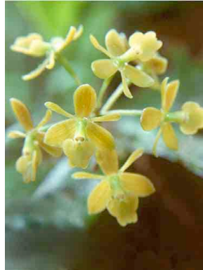
23 Epidendrum musciferum ORCHIDACEAE