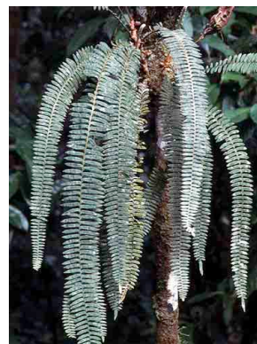
39 Polypodium bombycinum PTERIDOPHYTA