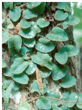
38 Microgramma tecta PTERIDOPHYTA