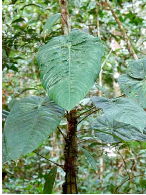
2 Anthurium breviscapum ARACEAE