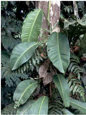
7 Philodendron heleniae ARACEAE