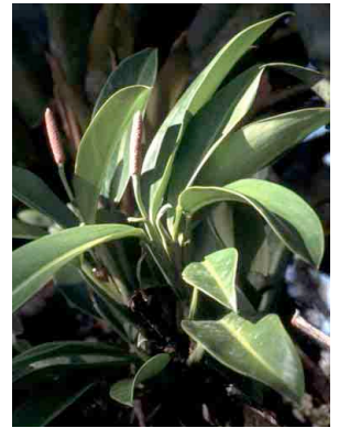
10 Stenospermation amomifolium ARACEAE