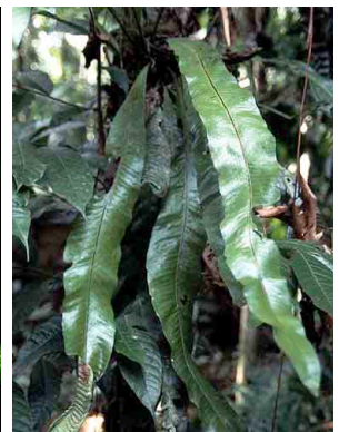
35 Campyloneurum phyllitidis PTERIDOPHYTA