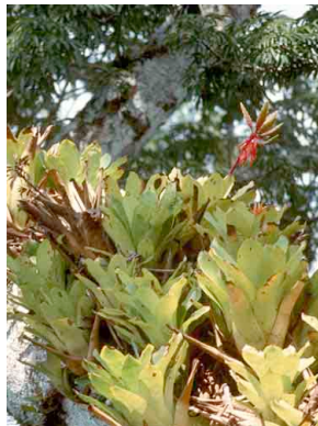
13 Aechmea romeroi BROMELIACEAE