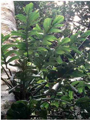
6 Monstera spruceana ARACEAE