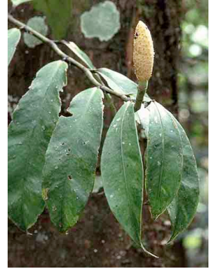
5 Heteropsis oblongifolia ARACEAE