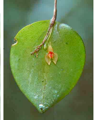
25 Lepanthes helicocephala cf. ORCHIDACEAE