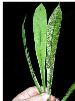
34 Antrophyum guayanense PTERIDOPHYTA