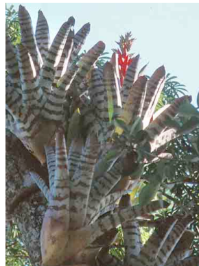
14 Aechmea zebrina BROMELIACEAE