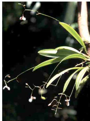
28 Pleurothallis flexuosa ORCHIDACEAE