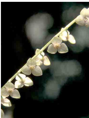
31 Stelis argentata ORCHIDACEAE