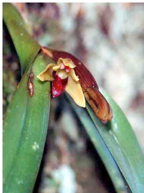
27 Maxillaria villosa ORCHIDACEAE