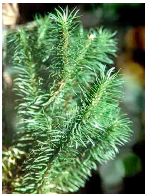
37 Huperzia dichotoma PTERIDOPHYTA