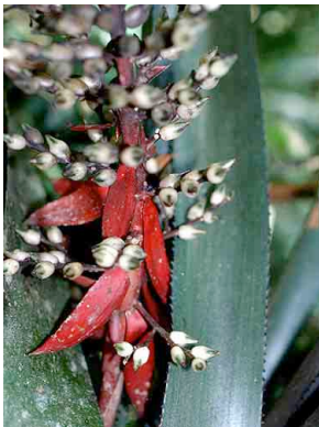
12 Aechmea penduliflora BROMELIACEAE