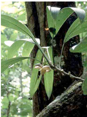
17 Asplundia schizotepala CYCLANTHACEAE