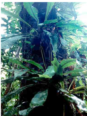
36 Elaphoglossum raywaense PTERIDOPHYTA