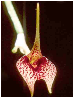
26 Masdevallia ORCHIDACEAE