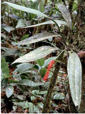
1 Anthurium bakeri ARACEAE