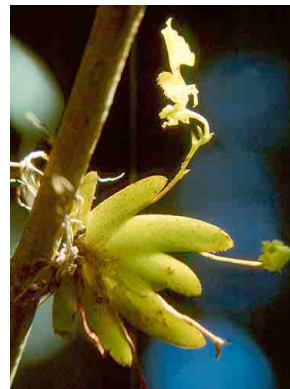
29 Psygmorchis glossomystax ORCHIDACEAE