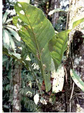
4 Anthurium loretense ARACEAE