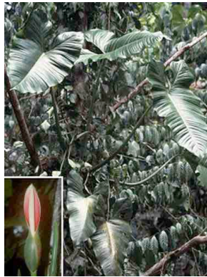
8 Philodendron megalophyllum ARACEAE