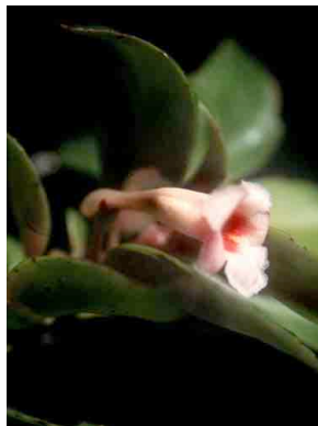
18 Codonanthe uleana GESNERIACEAE