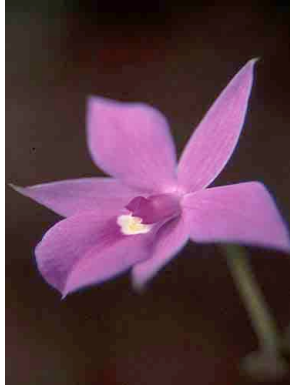
22 Dimerandra stenopetala ORCHIDACEAE