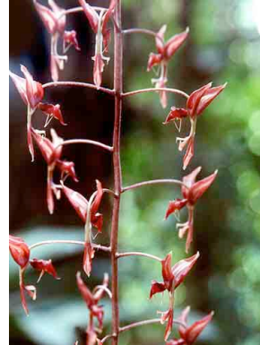
24 Gongora quinquenervis ORCHIDACEAE