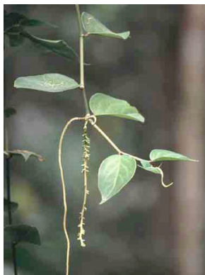
32 Peperomia macrostachya PIPERACEAE