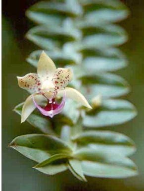
21 Dichaea longa ORCHIDACEAE

© Holger Kreft & Nils Köster [hk@uni-bonn.de]; and Env. & Conservation Programs, The Field Museum, Chicago, IL 60605 USA. [RRC@fmnh.org] Rapid Color Guide # 159 version 1.1