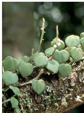
33 Peperomia serpens PIPERACEAE