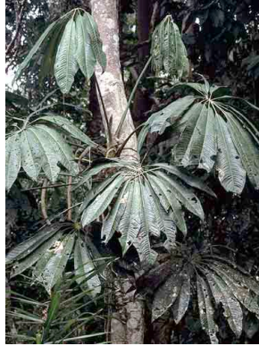
3 Anthurium eminens ARACEAE