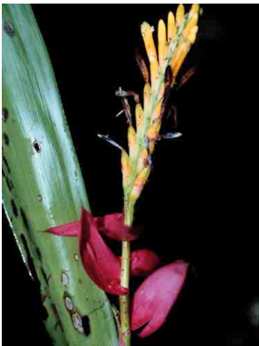
11 Aechmea contracta BROMELIACEAE