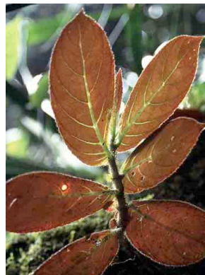
19 Columnea breneri GESNERIACEAE