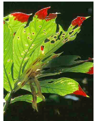
20 Columnea ericae GESNERIACEAE