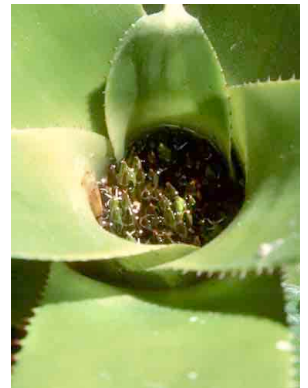
15 Neoregelia eleutheropetala BROMELIACEAE