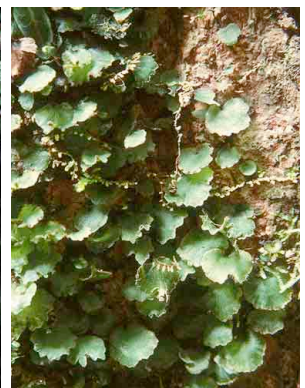
40 Trichomanes punctatum PTERIDOPHYTA