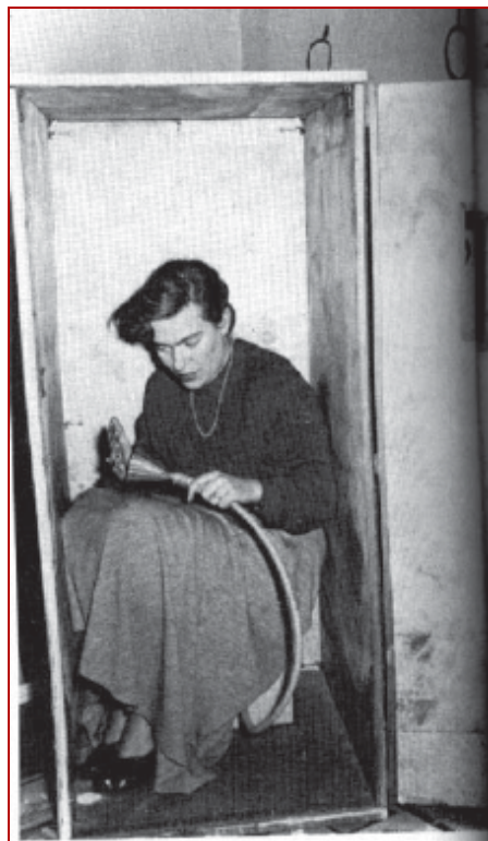
Patient using "orgone accumulator" box

He saw a small motor turning over that was attached to an orgone accumulator .