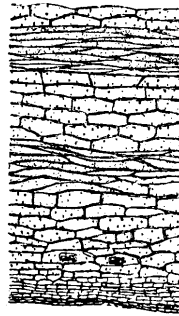
FIG. 4. Longitudinal section of Rhizoma, from epidermis to center, inclusive. Magnified.

position beneath the surface of the ground. It seldom throws out branches, but, occasionally, little protuberances project from its sides, being from one-eighth of an inch to an inch in length, and about one-third as large in diameter as the primary rhizome. They are rounding at the extremity, and seem to indicate abortive attempt of the rhizome to throw out branches; but they do not send up the vine. Along the upper side of the rhizome are stem-scars, which are about three-fourths of an inch apart. The epidermis is brown, thin, and scales off, more or less, upon drying, especially when the rhizome is gathered in the spring, but this is not the case with a good quality of it, when dug in autumn. The internal color of the dry rhizome is whitish, or slightly straw-colored, when gathered in the autumn, but it is often brown when collected early in the season; there is no bark to it. Under a magnifying glass the texture of a broken rhizome appears mealy and perforated with numerous woody bundles. (See Figures 3 and 4). Attached to the lower part of the rhizome, an abundance of strong, wiry-like fibers