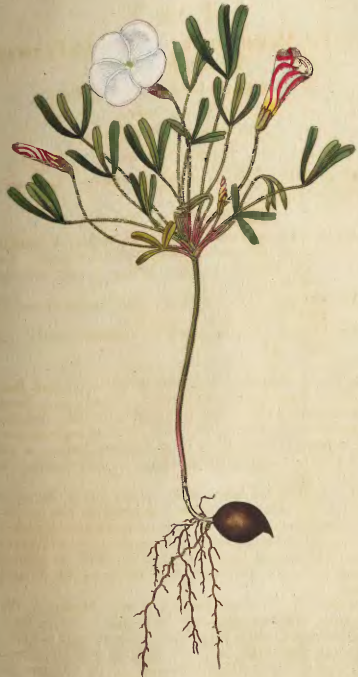
Publ. May 1 1791 by W. Curtis Sc t George's Crescent

Like most of the Cape plants, it is well adapted to the greenhouse, and succeeds best when placed on a front shelf of the house, where it can have plenty of light and air; some keep it in the stove, but there the plant is drawn up, and the flowers lose a part of their brilliancy: in no situation do they ever expand but when the sun shines on them; this is the less to be regretted, as they are most beautiful when closed.