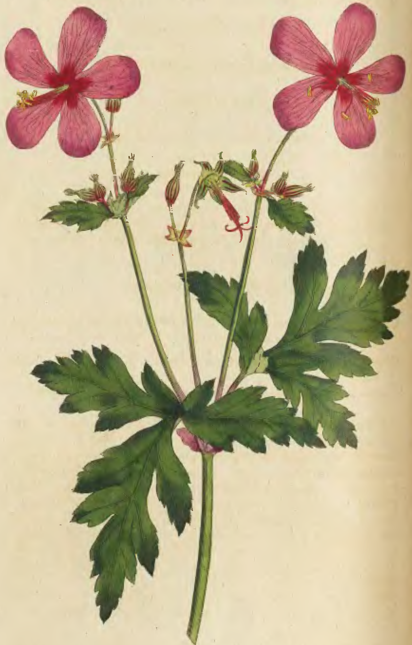
Del. by W. Curtis. Sc. by G. Kneller. Col. by J. G. Smith. 1792.