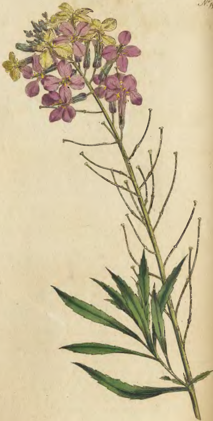
Pub. by W. Curtis Sculp. Crispent June 1. 1792.