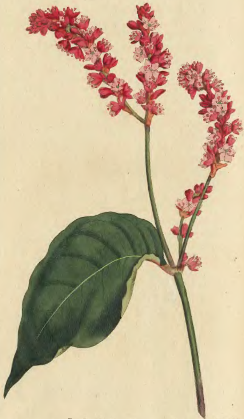
Pub. by W. Curtis. S c Geor. Crescent Dec. 7. 1792