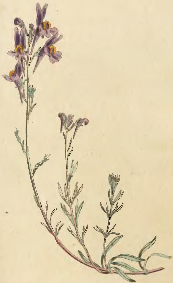
scilicet. Hort. Kew. 1798. Jacquin. Pin.