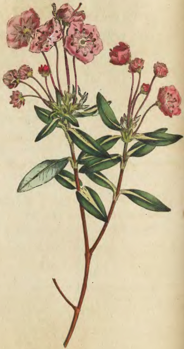
Pub. Dec. 1791 by W. Curtis Sc. Georges Crescent

The Professor does not mention the precise height which he had observed these trees to attain in North-America, but it is evident that they acquire a considerable thickness, as the wood of the root as well as the body of the tree is manufactured into various utensils by the natives, and by the Indians into spoons in particular, whence it has obtained the name of the Spoon Tree .