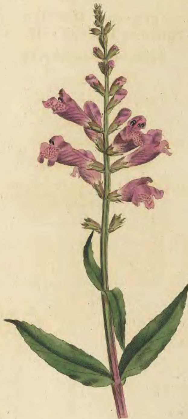
Linnæus. Ital. p.

It bears a considerable affinity to the Dracocephalum virginianum , to which, though a much rarer plant, it is inferior in point of beauty; it spreads more on the ground, its flowering stems are not altogether so upright, nor so tall, the leaves are broader, and the flowers in the spikes less numerous.