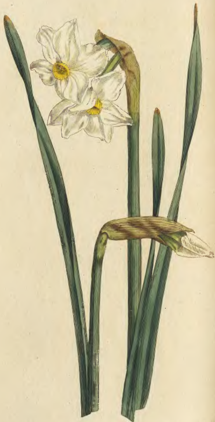
Pub. by W. Curtis d'Ess. Copper July 1. 77. 1

NARCISSUS latifol classis altera, lin. 1. nascuntur, &c. ad intellexisse. Clus. Hist. Pl. rar. lib. 2. p. 156.