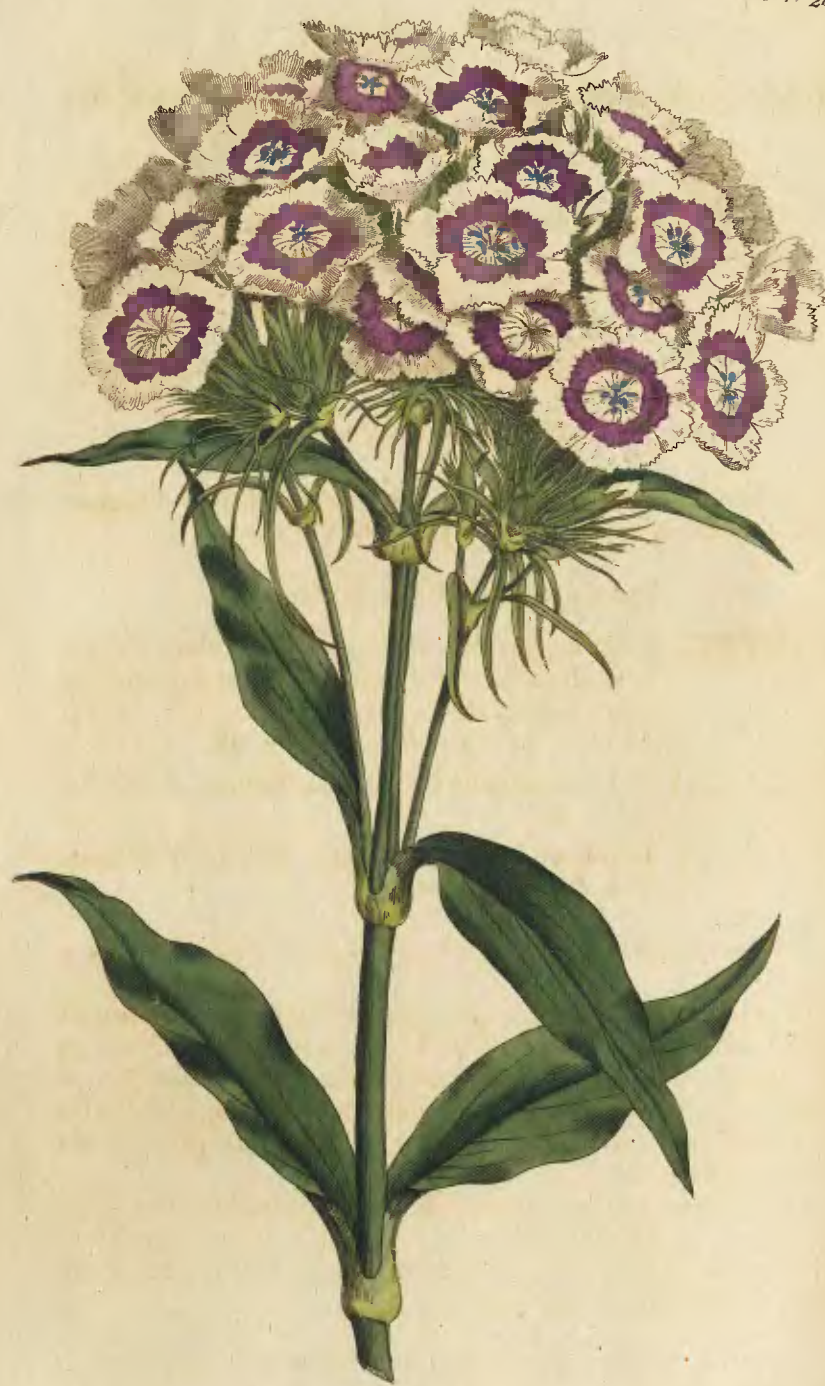
Pub. by W. Curtis Sculp. Grev. sculp. Oct. 1. 1792