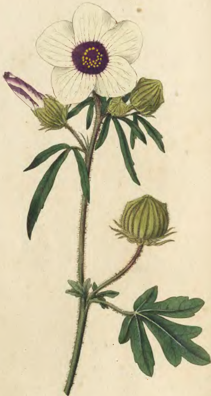
Pub. by W. Curtis. G o Geo. Craycock Nov. 1. 1792. Saxifraga Scilla