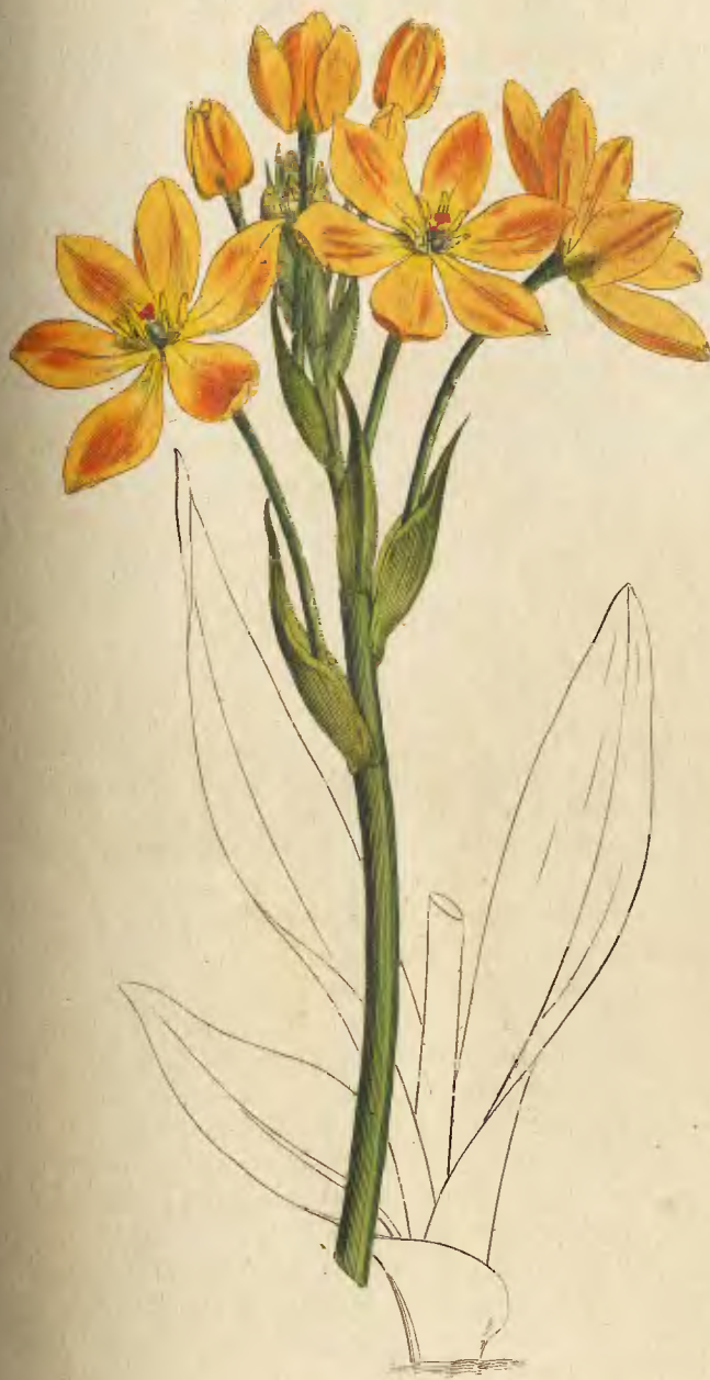
Pub. by W. Curtis Sc. Soc. London May 1. 1798

It is propagated by offsets from its bulbs, and has the appearance of being a plant of kindly growth and easy management.