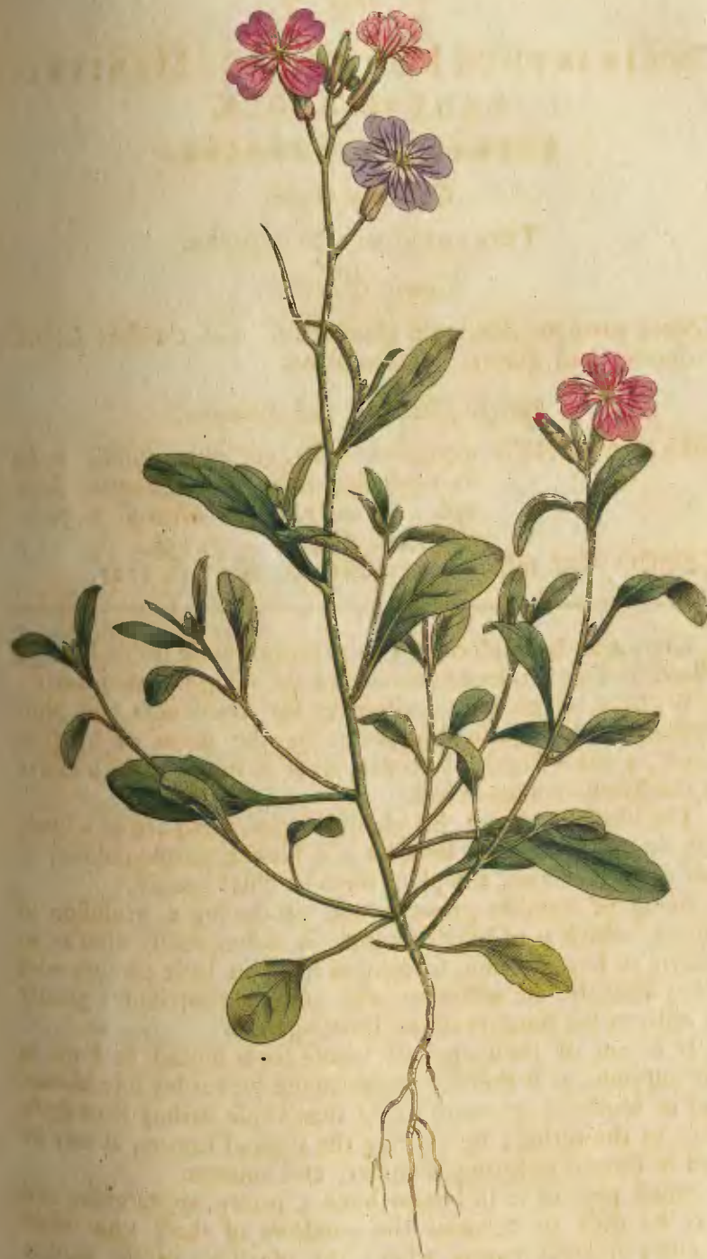
Pub Sep 3 1792 by W. Curtis S. George's Crescent.

Small pots of it in bloom have a pretty appearance, and may be used to decorate the windows of those who reside in cities or great towns, where the pleasures of the garden are not to be enjoyed.