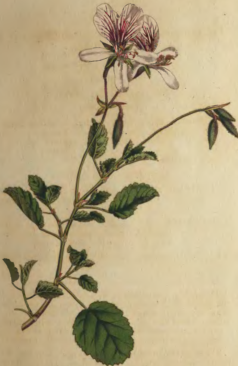
Edw. Edwards fecit

It requires the same treatment as most other Green-House Plants.