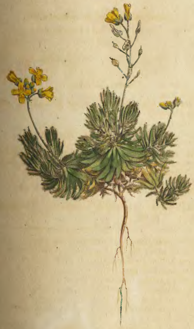
Ab Orig 11791 by W Curtis S t Georges Crestant.

LINNÆUS originally confounded it with a similar plant, the Draba alpina , a mistake since rectified in his Manuscript Plant. p. 91.