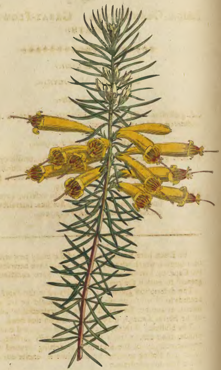
Pub. by W. Curtis Sculp. Great Britain 1792