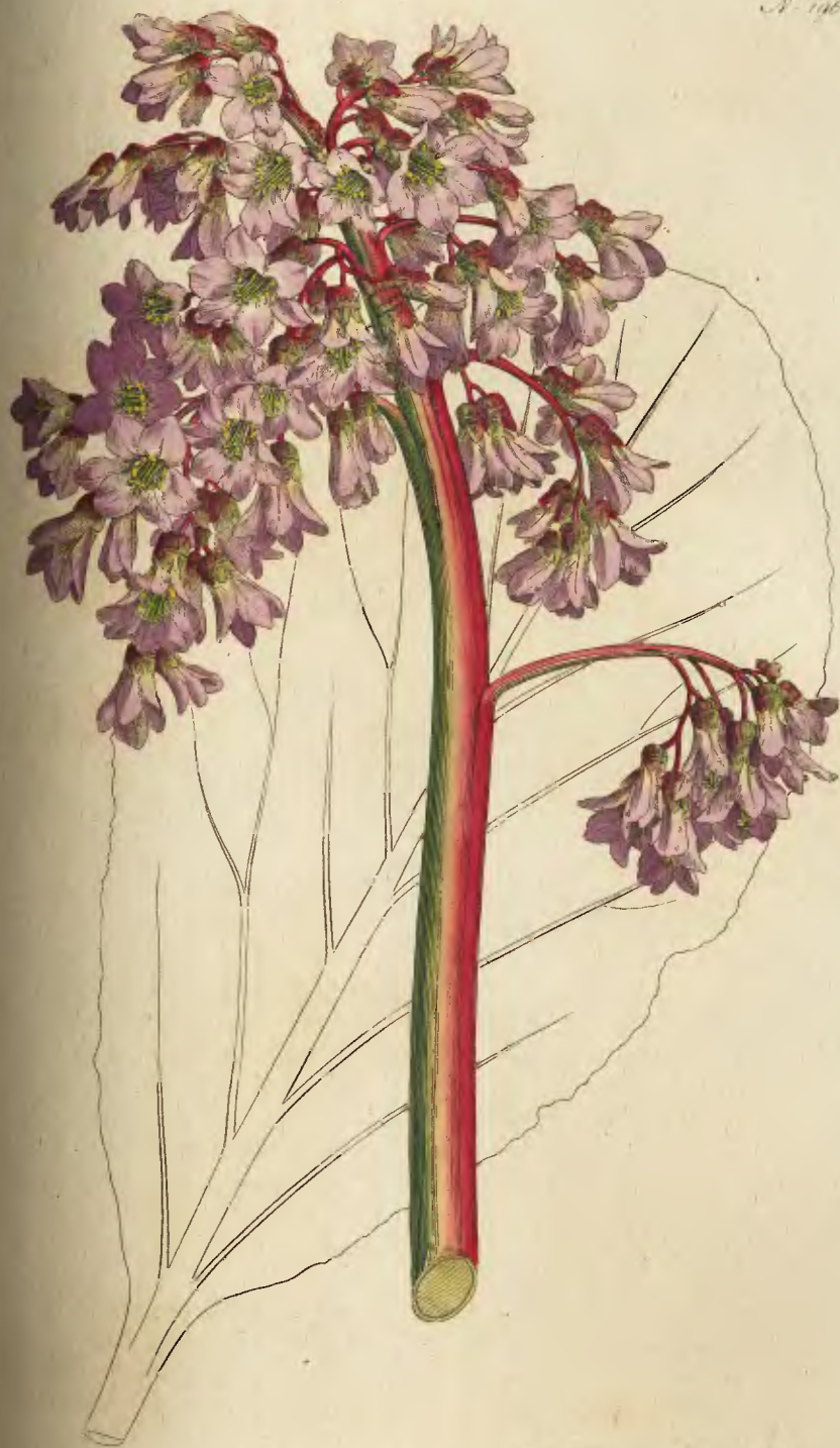
Pub. by W. Curtis. d. Gou. Engraver July 1. 1792.

There is another Saxifrage in our gardens exceedingly like this in appearance, but differing, in producing larger bunches of flowers, and in having larger, rounder, and more heart-shaped leaves; Mr. AITON regards this as a variety of the crassifolia , we are inclined to consider it as a species under the name of cordifolia . The parts of fructification in the crassifolia are apt to be preternaturally increased.