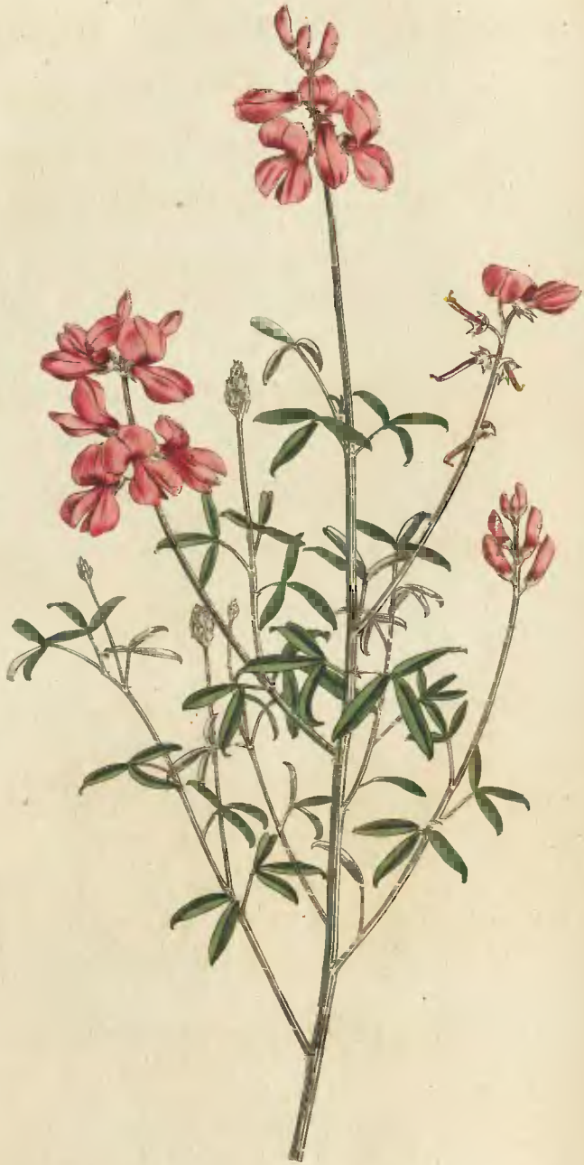
Pub. by W. Curtis. J. Bot. Cabinet July 2. 1791