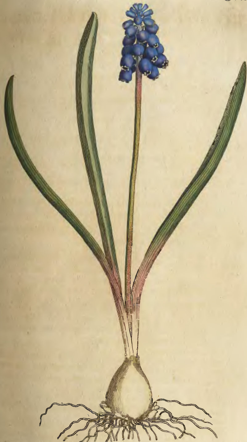
Feb June 1791

The botryoides differs from the racemosus , in having its leaves upright, its bunch of flowers smaller, the flowers themselves larger, rounder, of a paler and brighter blue.