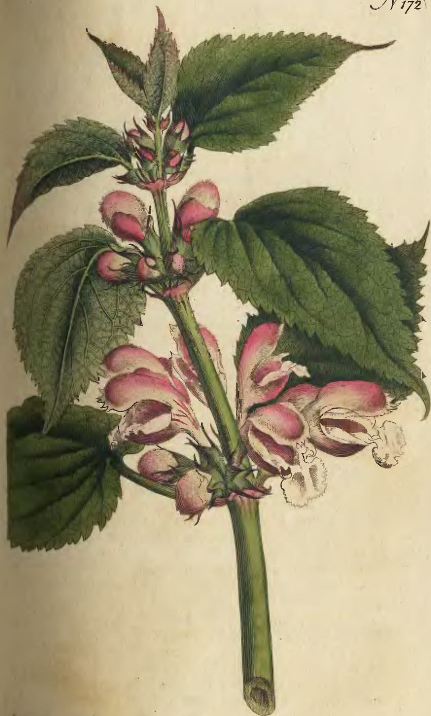
Publ. Nov 1797 by W. Curtis Sculp. S. George's Crescent.

It may be propagated either by seeds, or by parting its roots in autumn, is a hardy plant and grows readily.