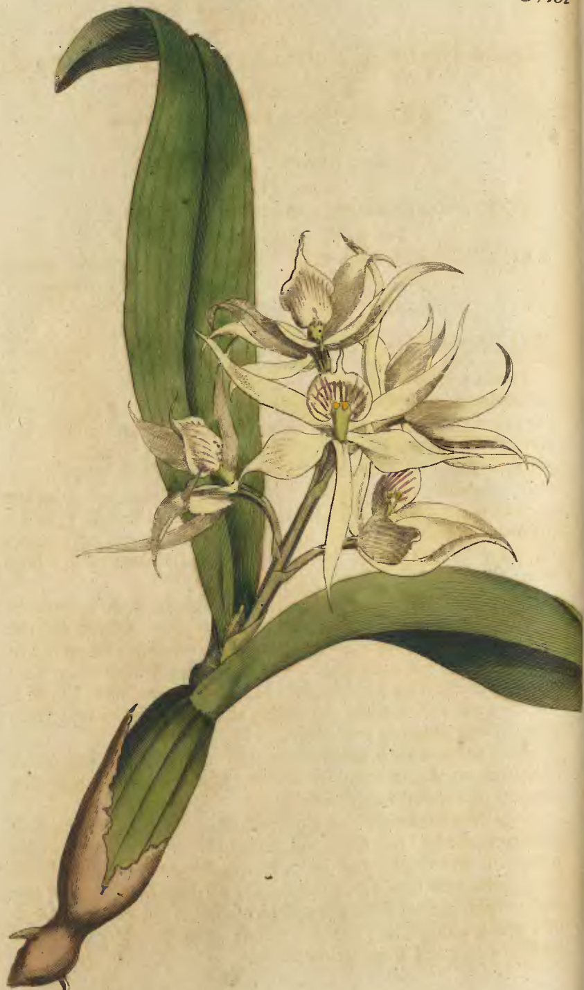
Tab April 1 1791 by W. Curtis S. George's Crescent.

In its fructification, the Epidendrum obviously agrees with the Orchis tribe, but differs essentially in the œconomy of its roots; in the Orchis the roots spring from the crown of the bulb, which is formed in the earth; in the Epidendrum the bulb, or the part which appears to be analogous to a bulb, though of a green colour, is produced above ground, while the roots or fibres proceed from below it.