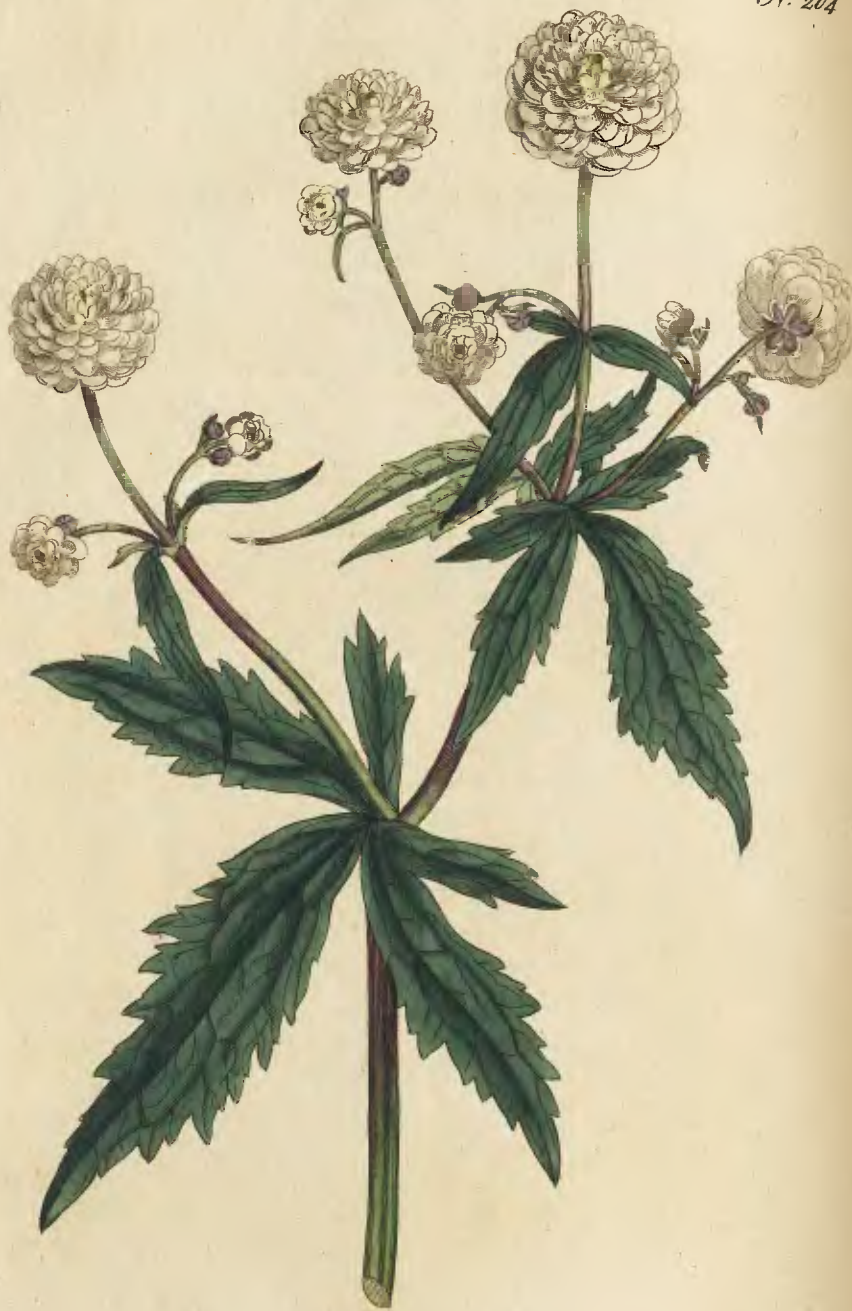
Pub. by W. Curtis Scilicet Craycent Sep. 1. 1792.