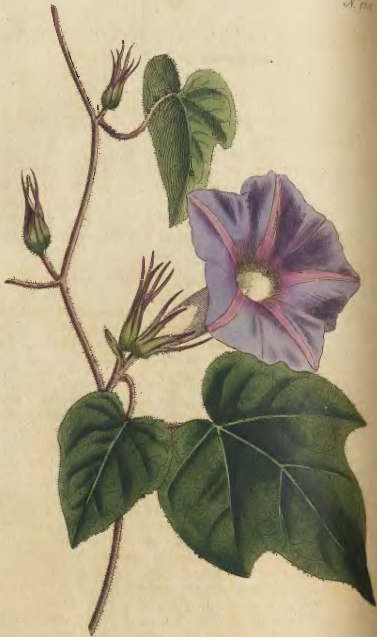
Pub. by W. Curtis Sc. Geo. Crescent Apr. 1. 1793