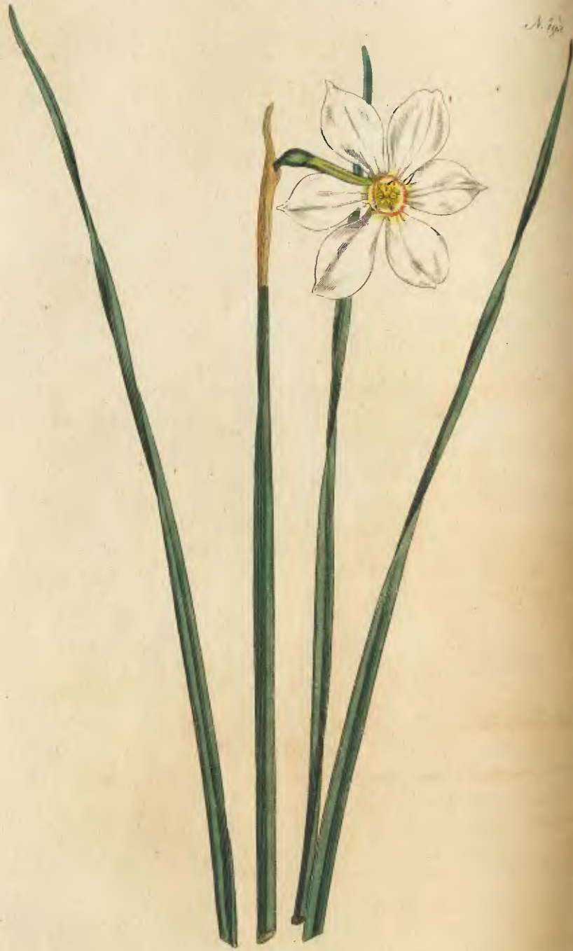
Pub. by W. Curtis Sc. Gra. Crescent June 1. 1794