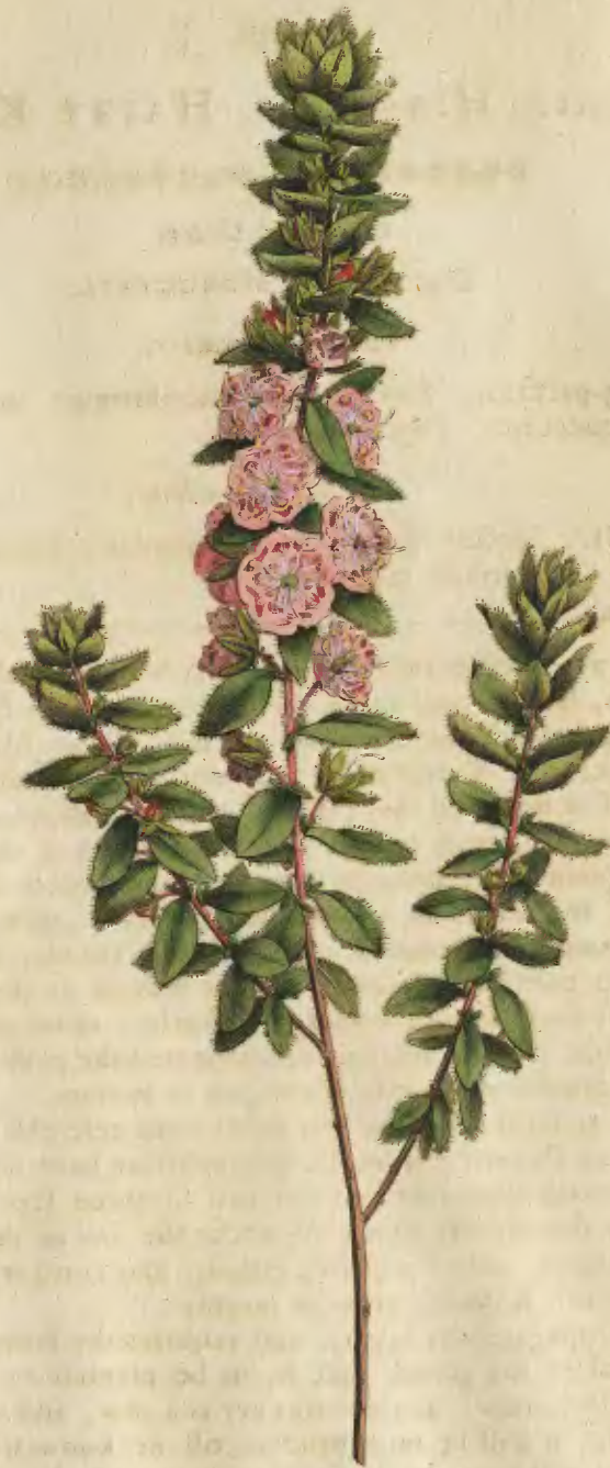
Pub d Nov r 1790 by W c Curtis, S t Georges Crescent.