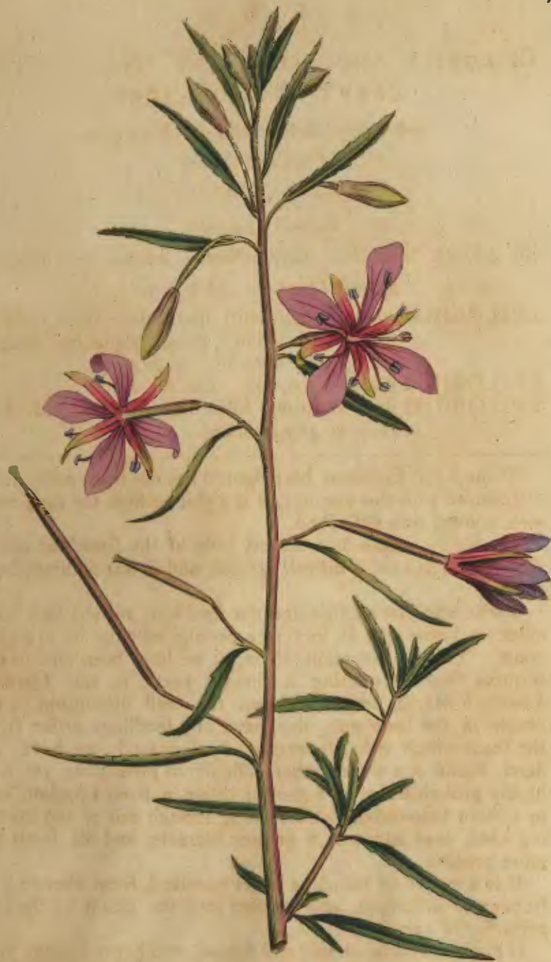
Pub d as the Act directs March 22 1789. by W Curtis, Botanic Garden, Lambeth Marsh.

It flowers with us in July and August, and being a hardy perennial, and perhaps the most elegant species of the genus, appears to us highly deserving a place in the gardens of the curious.