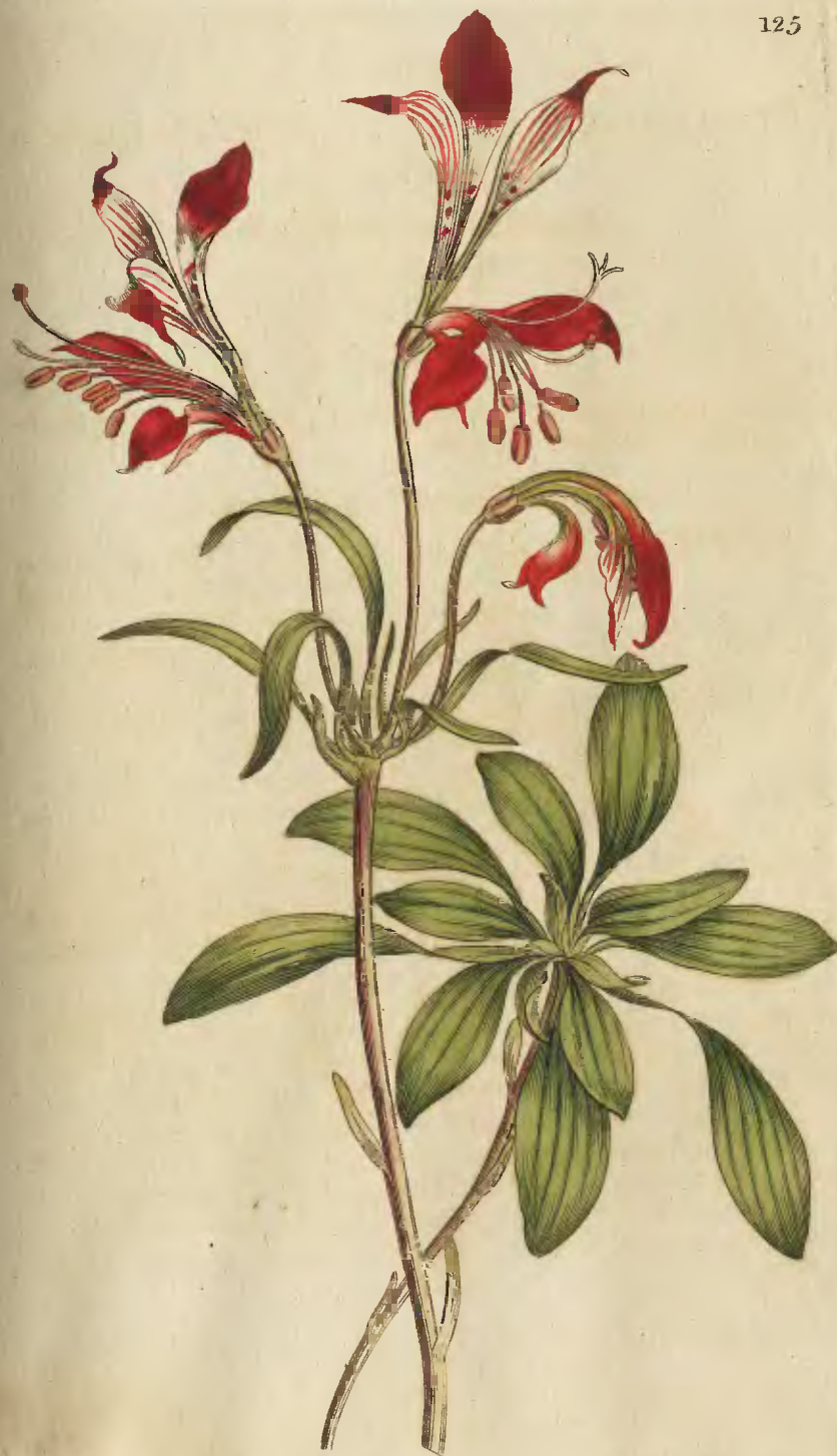
Published as the Act directs July 1. 1790 by W. Curtis, St. Georges Crescent.

Our figure was drawn from a plant which flowered extremely well in the stove of Messrs. GRIMWOOD and Co. Kensington.