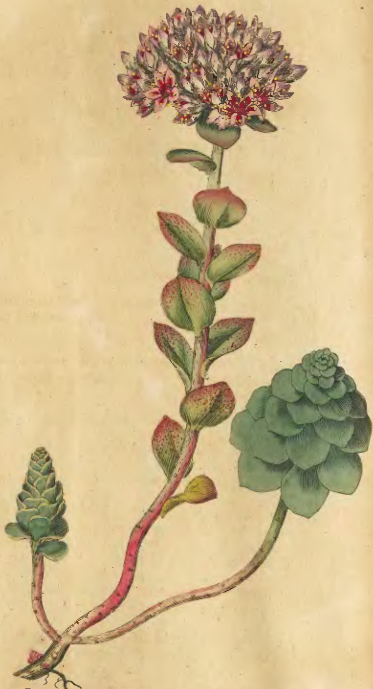
Pub. as the Act d'ind. May. 1790. by W. Curtis, St. Georges Crescent.