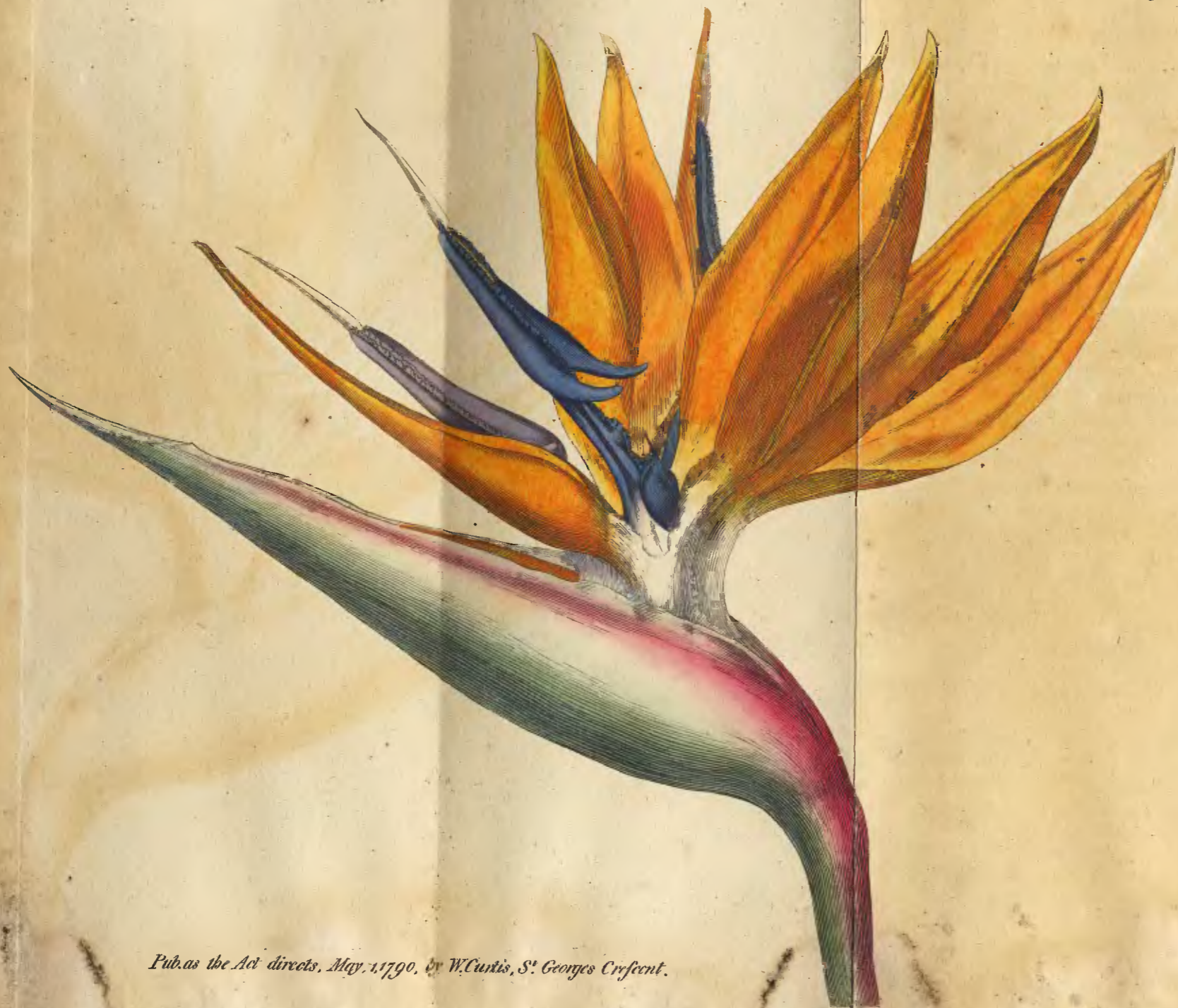
Pub. as the Act directs, May 1790, by W. Curtis, S r Georges Crescent.