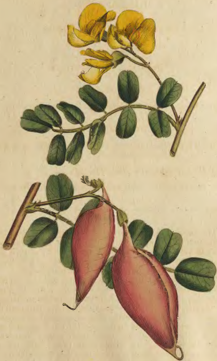
Pub. d as the Act direct, April 11789 by W. Curtis Botanic Garden, Lambeth Marsh.