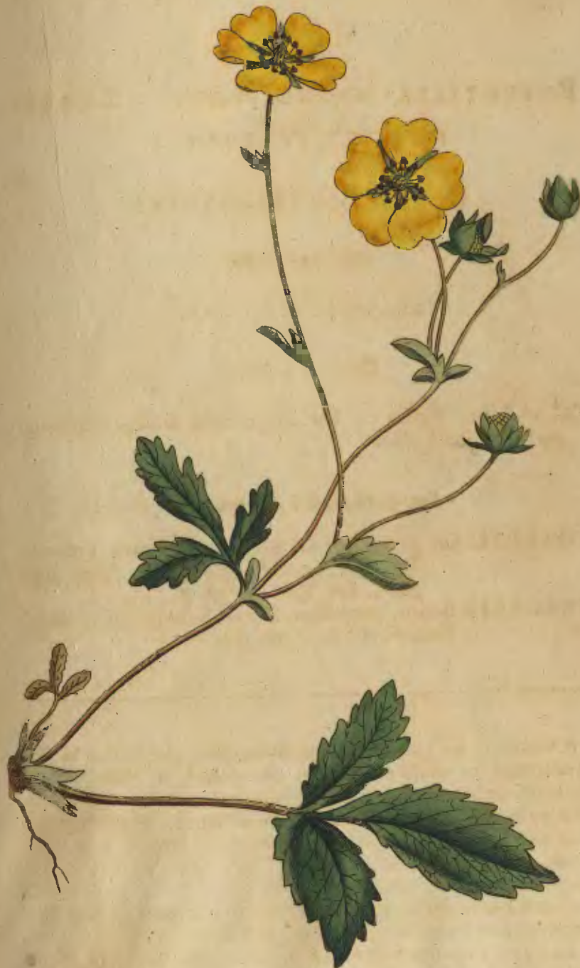
Pub. as the Art directs Feb 4, 1789 by W. Curtis, Botanic Garden, Lambeth Marsh.

LINNÆUS considers it as an annual; MILLER, as a biennial; we suspect it to be, indeed have little doubt of its being a perennial; having propagated it by parting its roots, but it may be raised more successfully from seed.