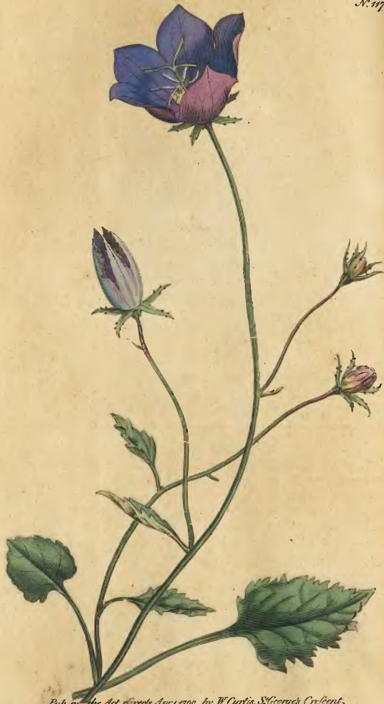
Pub. as the Act of roots, Apr. 1. 1790. by W. Curtis, St. George's Crescent.