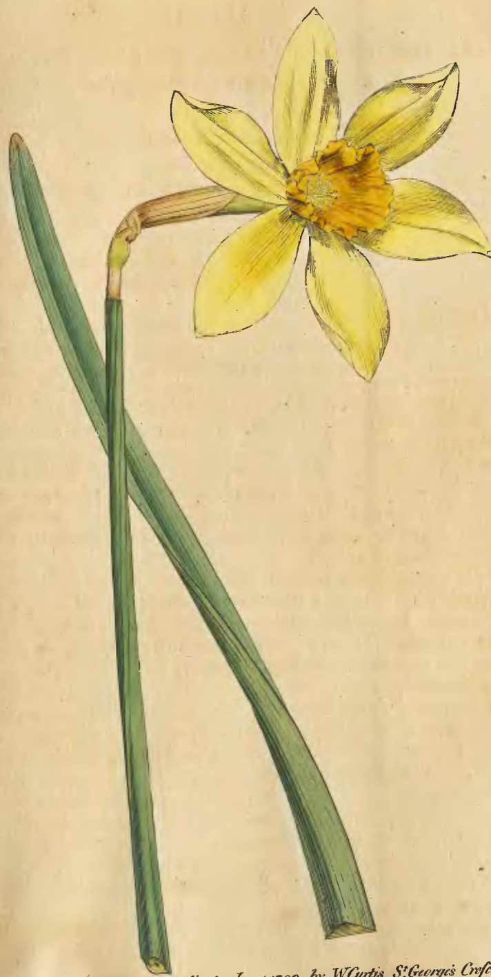
Pub. as the Act directs, Jun. 1. 1790. by W. Curtis, St. George's Crescent.

Like most of the tribe, this species will grow well without any care, the bulbs of the double sort should be taken up yearly, otherwise they are apt to degenerate.