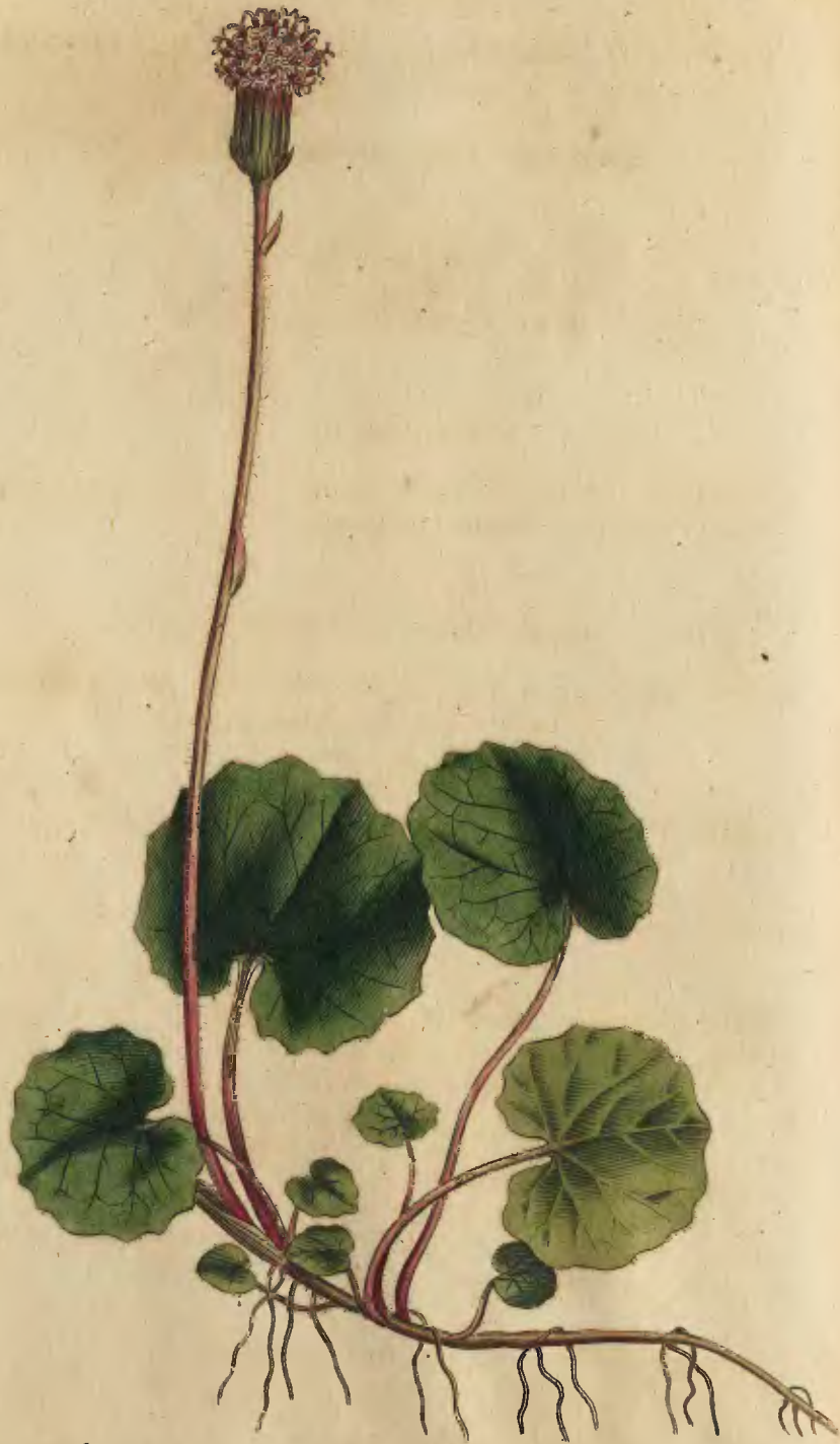
Publ. for the Act direct, May, 1789 by W. Curtis, Botanic Garden, Lambeth Marsh.

Is propagated by parting its roots in autumn.