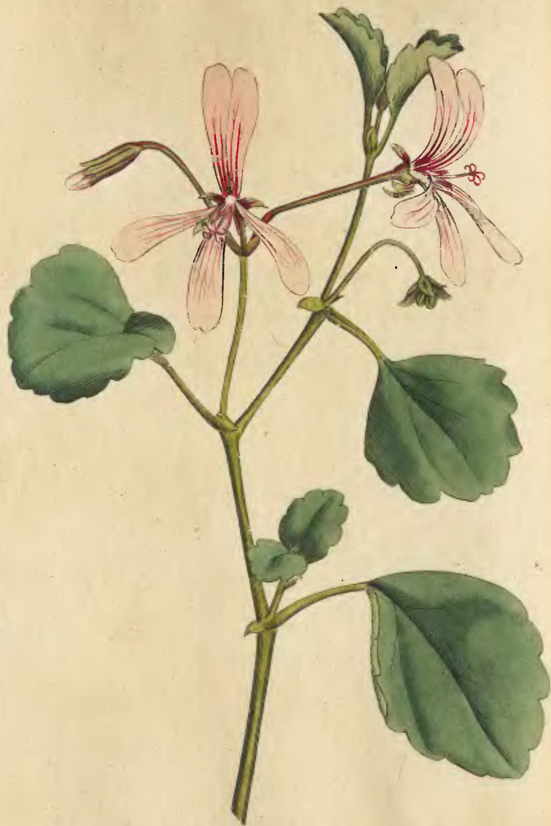
Pub. d as the Act directs, Dec. 1, 1789, by W. Curtis, Botanic Garden, Lambeth Marsh.