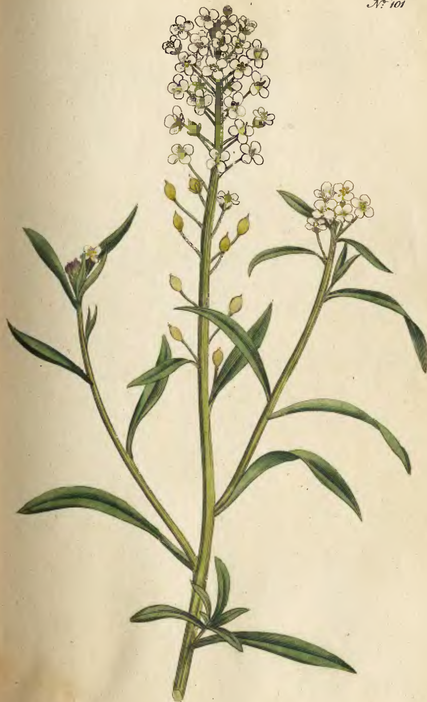
Publ. as the Act directs Nov. 2, 1789, by W. Curtis, Botanic Garden, Lambeth Marsh.

The specific description in the Hortus Kewensis above referred to, admirably characterizes the plant, but surely at the expence of its generic character.