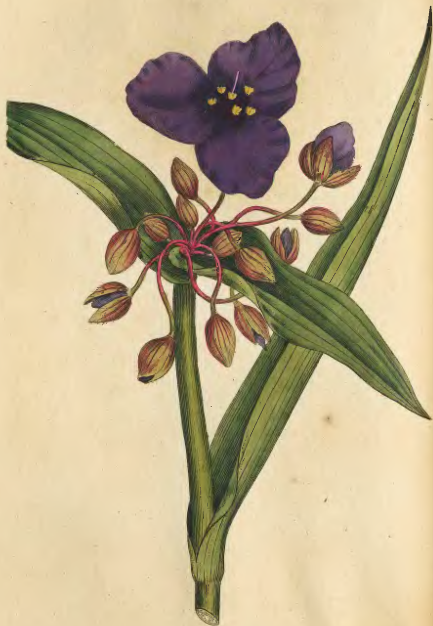
Pub. as the Act directs Dec. 1789, by W. Curtis, Botanic Garden, Lambeth Marsh.