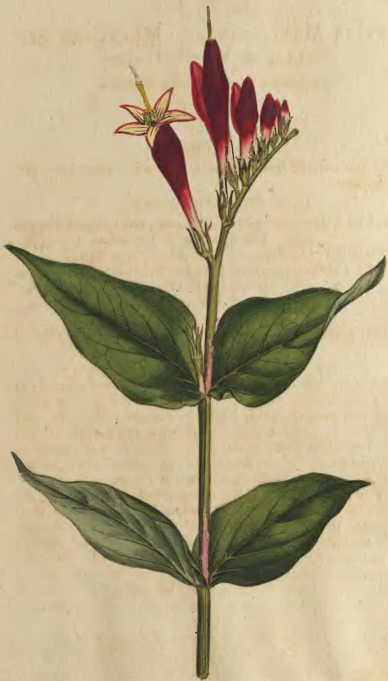
Pub d as the Act directs April 11789, by W. Curtis, Botanic Garden, Lambeth, Marsh.