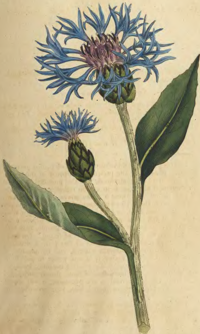
Pub d as the Act direct. March 1780. by W. Curtis Botanic Garden Lambeth Marsh.

The Centaurea montana is a native of the German Alps, flowers during the greatest part of the summer, is a hardy perennial, and will grow in any soil or situation, some will think too readily.