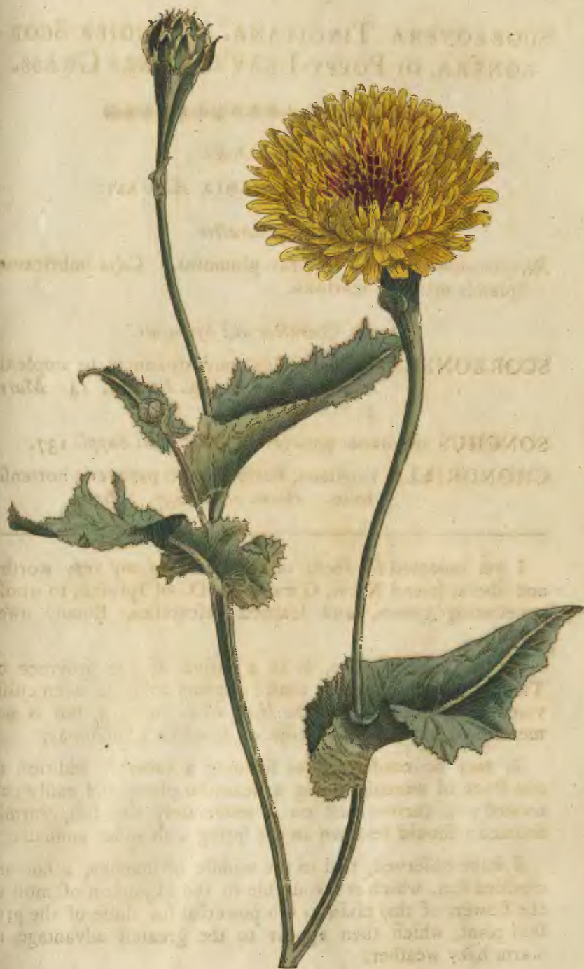
Del. Jan 1791 by W. Curtis Sc' George's Crescent.

I have observed, that in the middle of summer, a hot unclouded sun, which is favourable to the expansion of most of the flowers of this class, is too powerful for those of the present plant, which then appear to the greatest advantage in warm hazy weather.