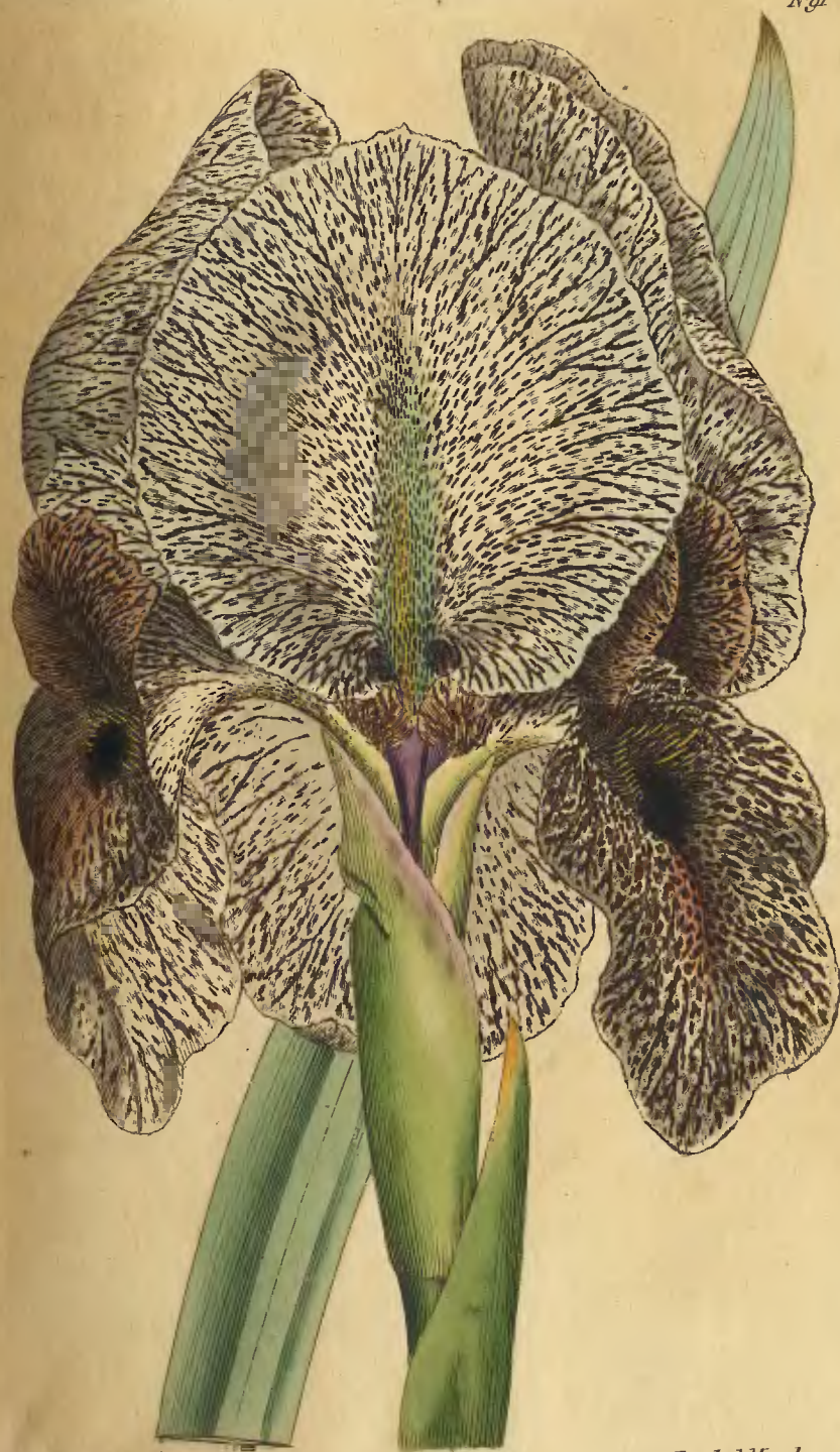
Pub. as the Act directs Aug r 11789 by W. Curtis Botanic Garden Lambeth Marsh.