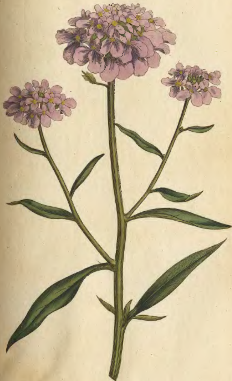
Pub. as the Act directs, Jan. 1. 1790. by W. Curtis, Botanic-Garden, Lambeth-Marsh.

Purple Candy-Tuft is a native of the South of Europe, and flowers in June and July: it should be sown in the spring, on the borders of the flower-garden in patches; when the plants come up, a few only should be left, as they will thereby become stronger, produce more flowers, and be of longer duration.