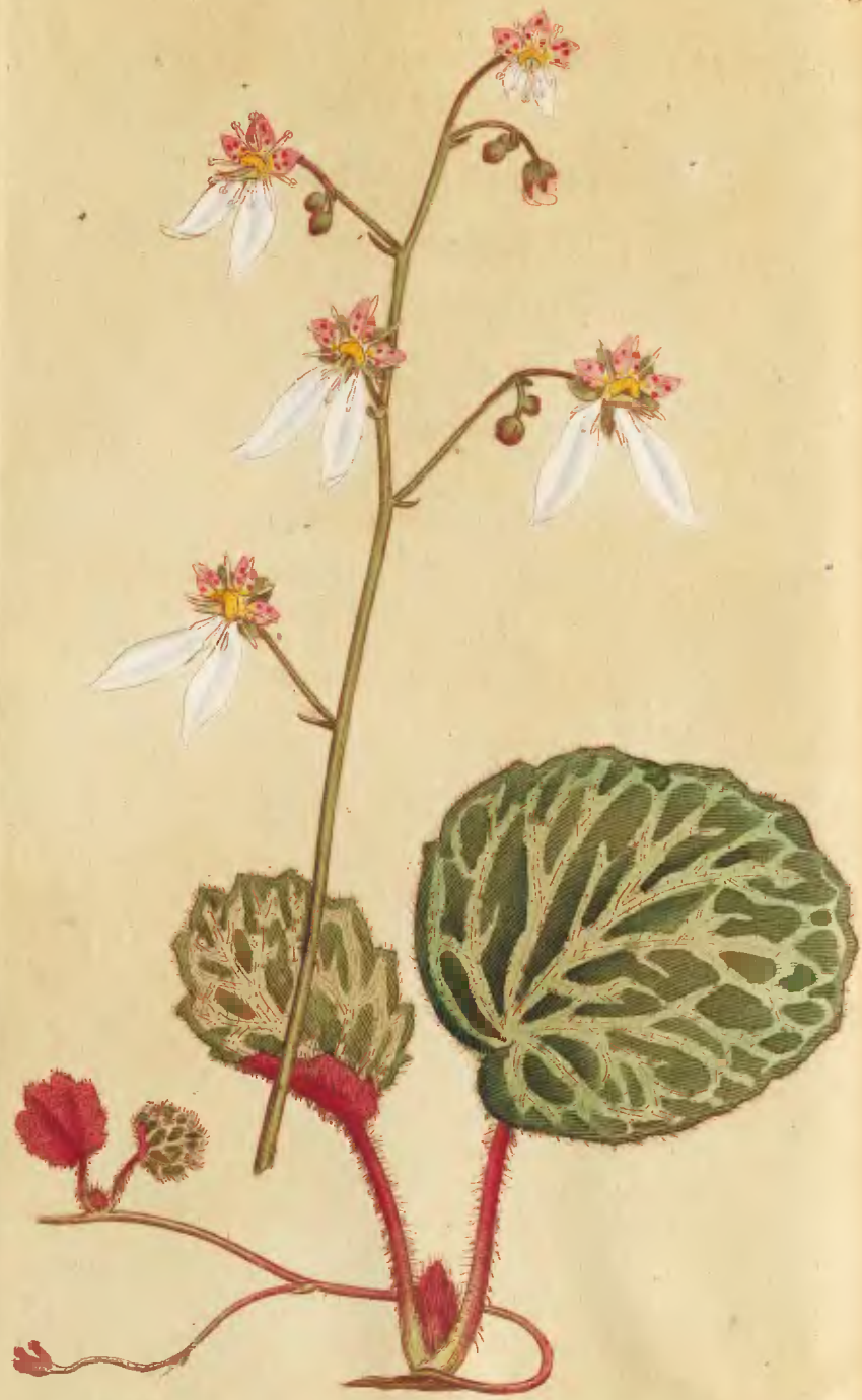
Pub d as the Act. directis Aug o 1789 by W o Curtis's Botanic Garden Lambeth Martini