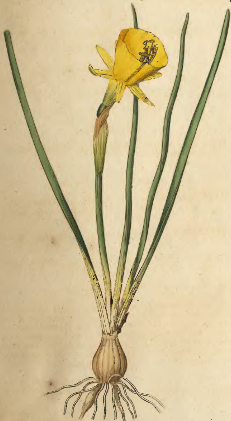
Pub d as the Act directr. July 1. 1789. by W. Curtis, Botanic Garden Lambeth Marsh.

It certainly is one of the neatest and most elegant of the genus, is propagated by offsets, and should be planted in a loomy soil, with an Eastern exposure.