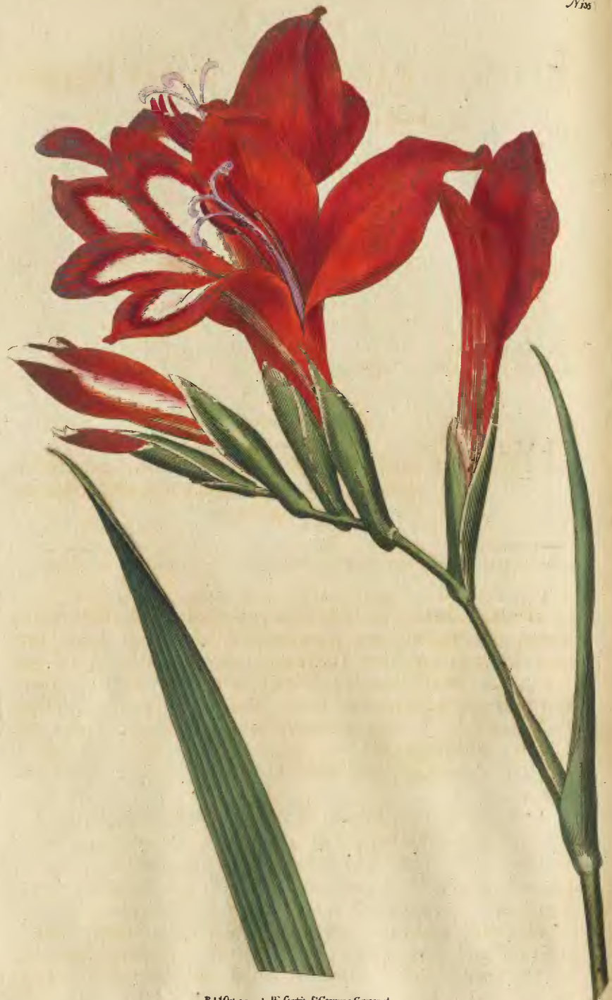
Pub. Oct 1 1830 by W. Curtis & George Crescent