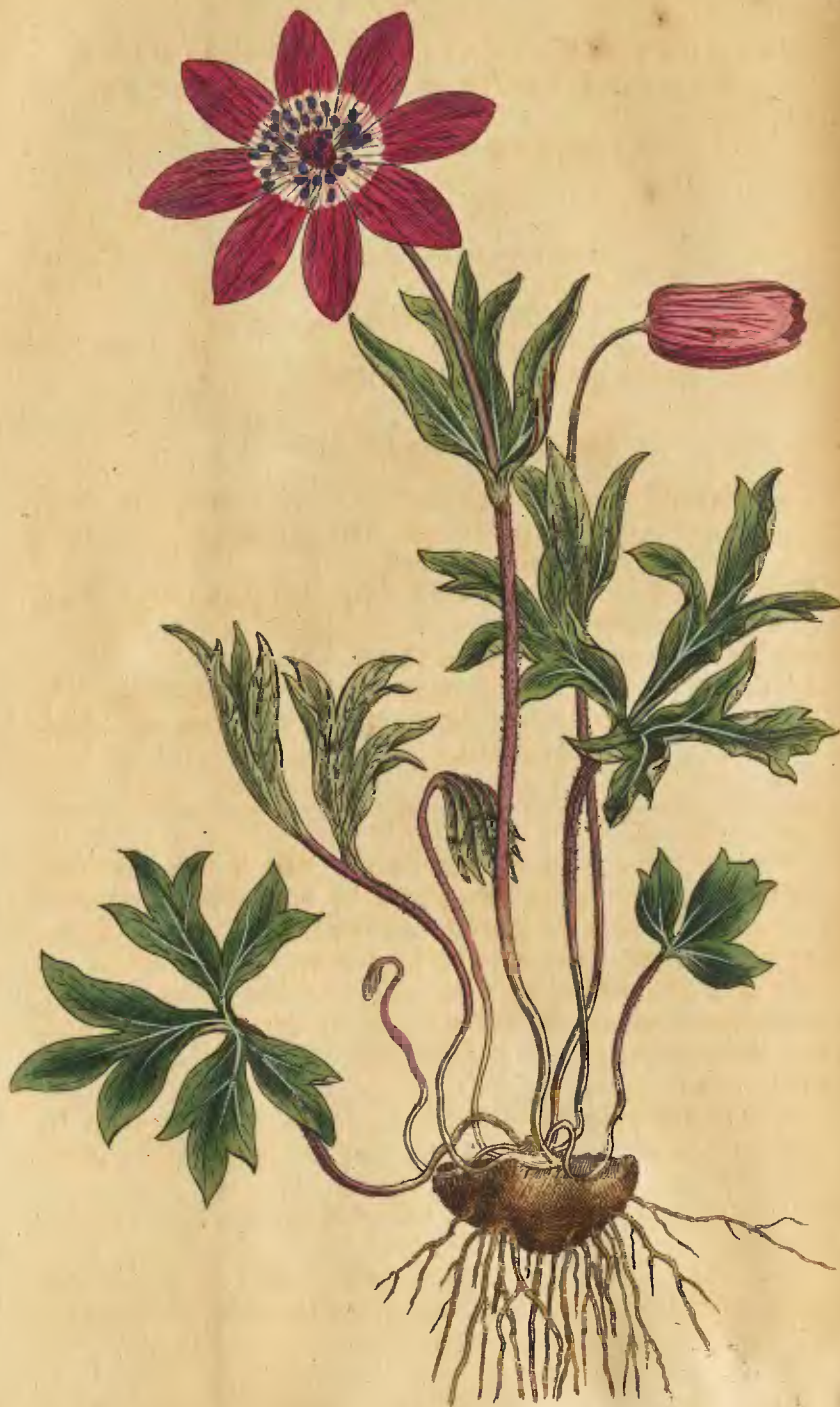
Published as the Act directs June 1. 1790 by W. Curtis, St. George's Crescent.