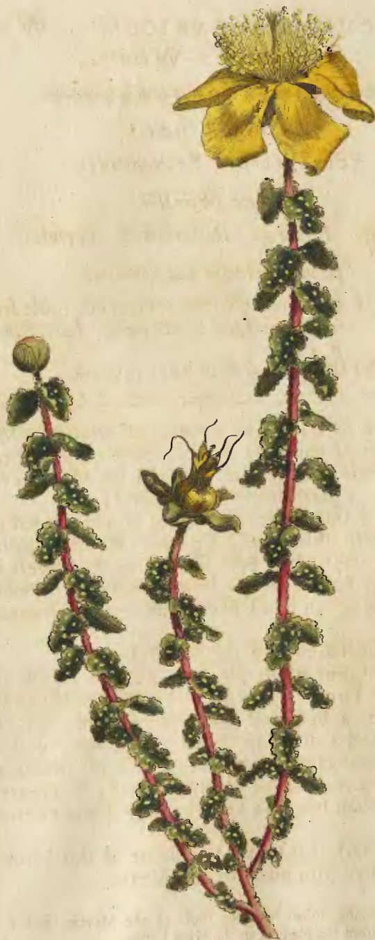
Pluk. Nov. 11700 by W. Curtis Sculp. Georges Crescent