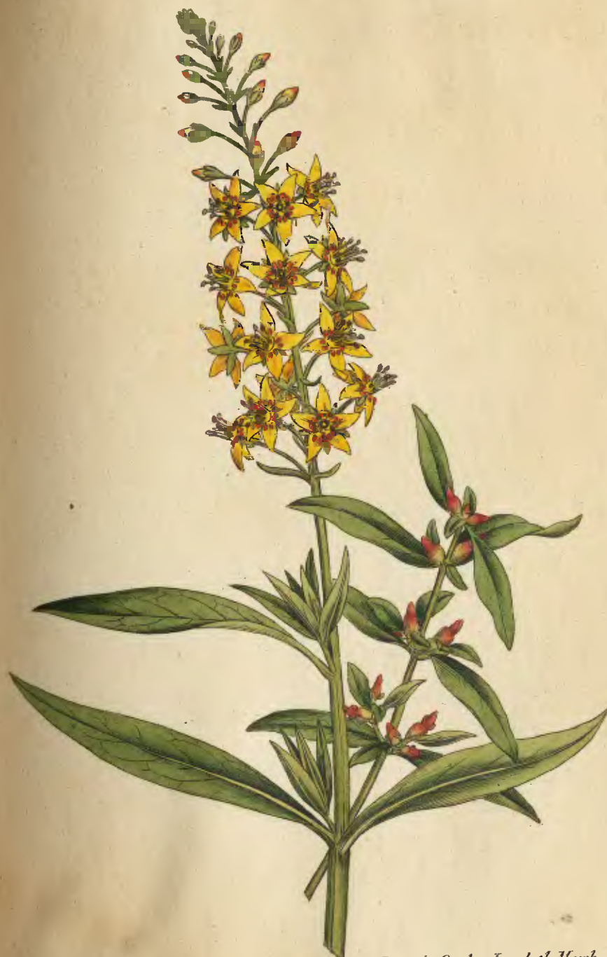
Pub. d as the Act directs Dec. 1, 1789, by W. Curtis, Botanic Garden, Lambeth Marsh.

The Lysimachia bulbifera is a hardy perennial, grows spontaneously in boggy or swampy ground, and hence requires a moist soil. It flowers in August.