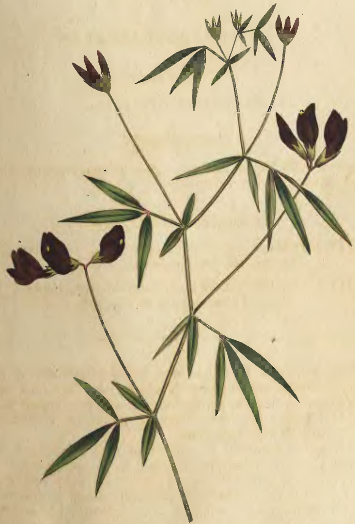
Pub. by the Act directs, April 1. 1789. by W. Curtis, Botanic Garden, Lambeth Marsh.

It continues to flower during the whole of the summer; as it is very apt to die off without any apparent cause, care should be taken to have a succession of plants from seeds, if possible.