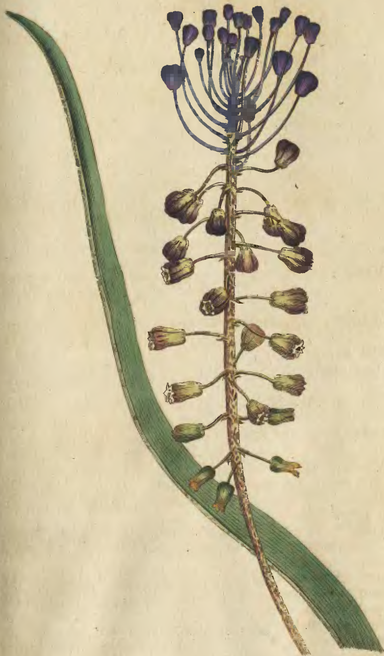
Published as the Act directs Oct. 1. 1790 by W. Curtis St. George's Crescent.

It is a hardy bulbous plant, growing readily in most soils and situations, and usually propagated by offsets.