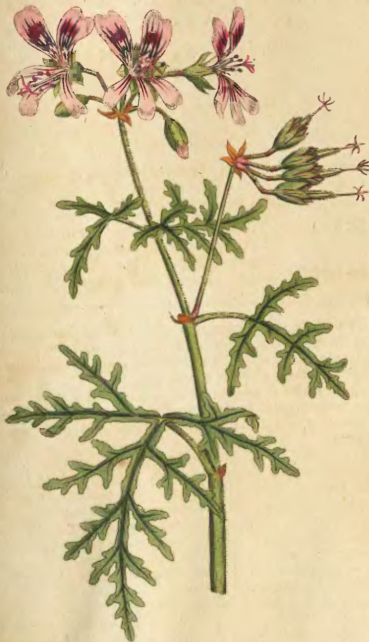
Pub d as the Acc directs Sep r 1789 by W o Curtis Botanic Garden, Lambeth Marsh.