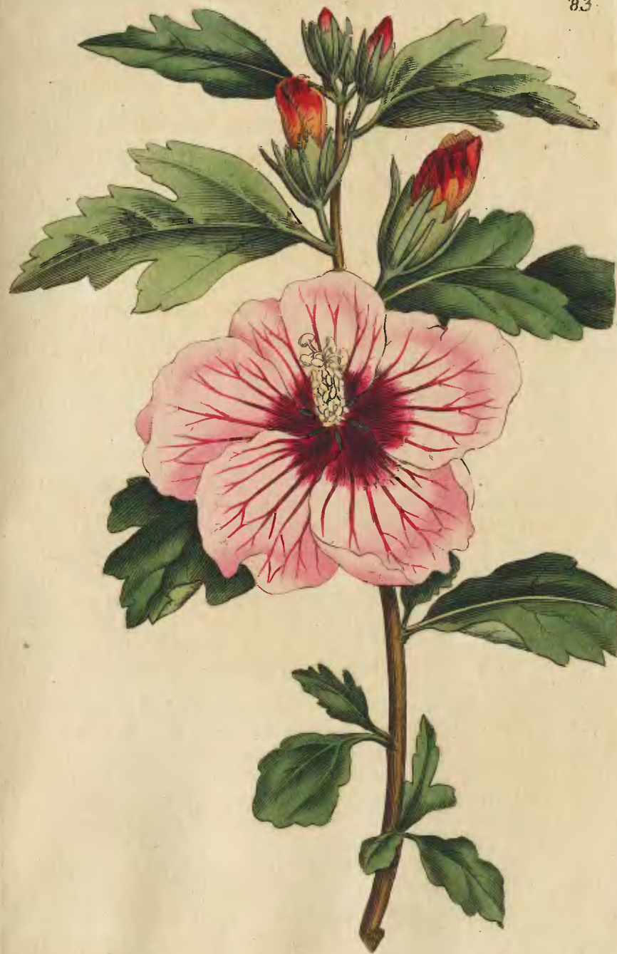
Publ. as the Act direct. May 13 1789. by W. Curtis Botanic Garden Lambeth Marsh.

In the time of PARKINSON it was not looked on as a hardy shrub: he thus writes,—“ they are somewhat tender, “ and would not be suffered to be uncovered in the winter “ time, or yet abroad in the garden, but kept in a large pot “ or tubbe, in the house or in a warme cellar, if you would “ have them to thrive.” Park. Parad.