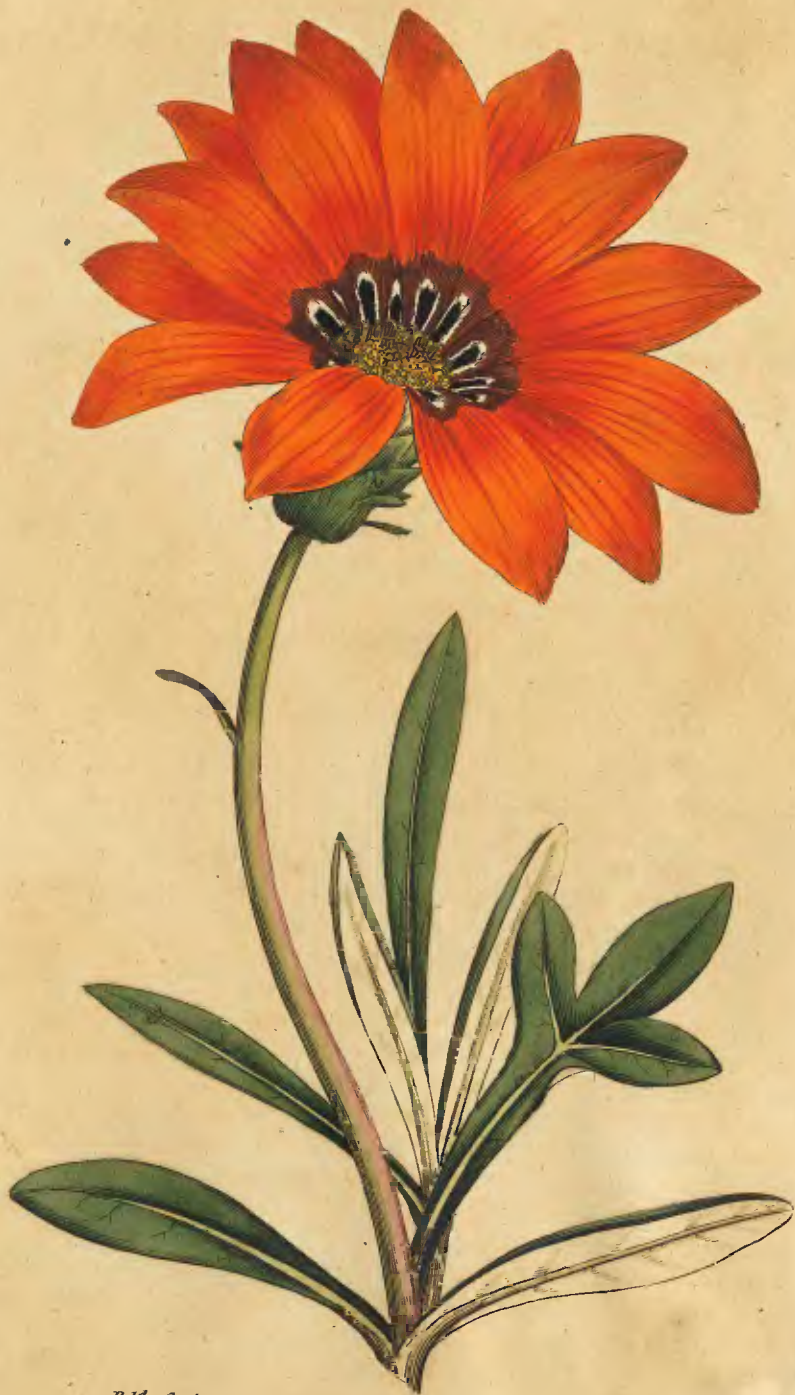
Publ. in the Act direct, July 12 1789. by W. Curtis, Botanic Garden, Lambeth, Marsh.