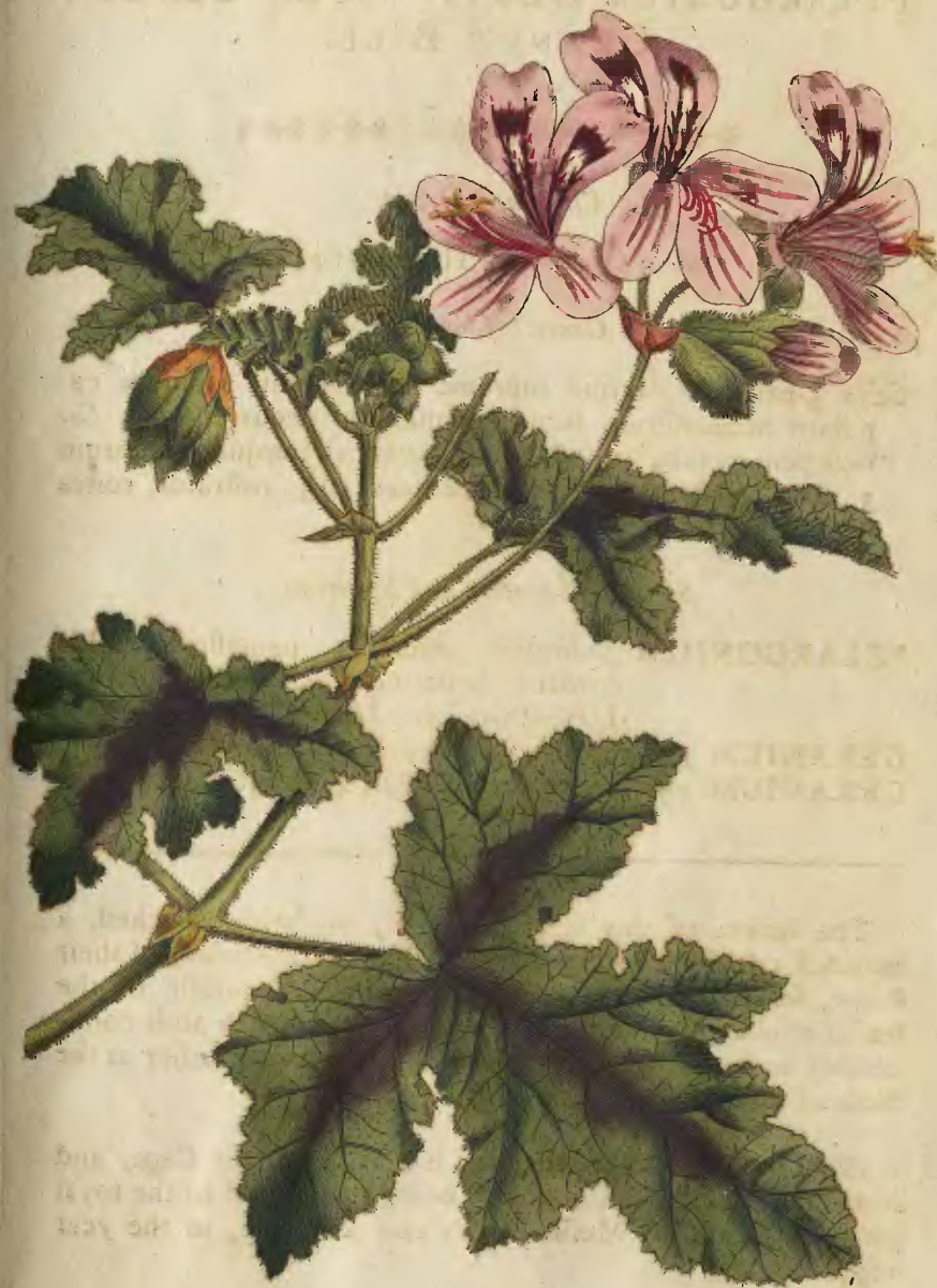
Publ. Jan. 1. 1791 by W. Curtis. St. George's Crescent.

It flowers from May to September; is readily propagated by cuttings, and sometimes raised from seeds, from whence several varieties have been produced.