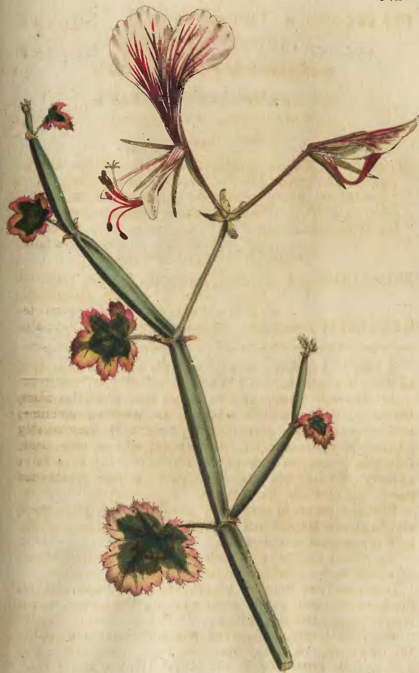
Pub d Nov r 1790 by W. Curtis. S t Georges Crescent.