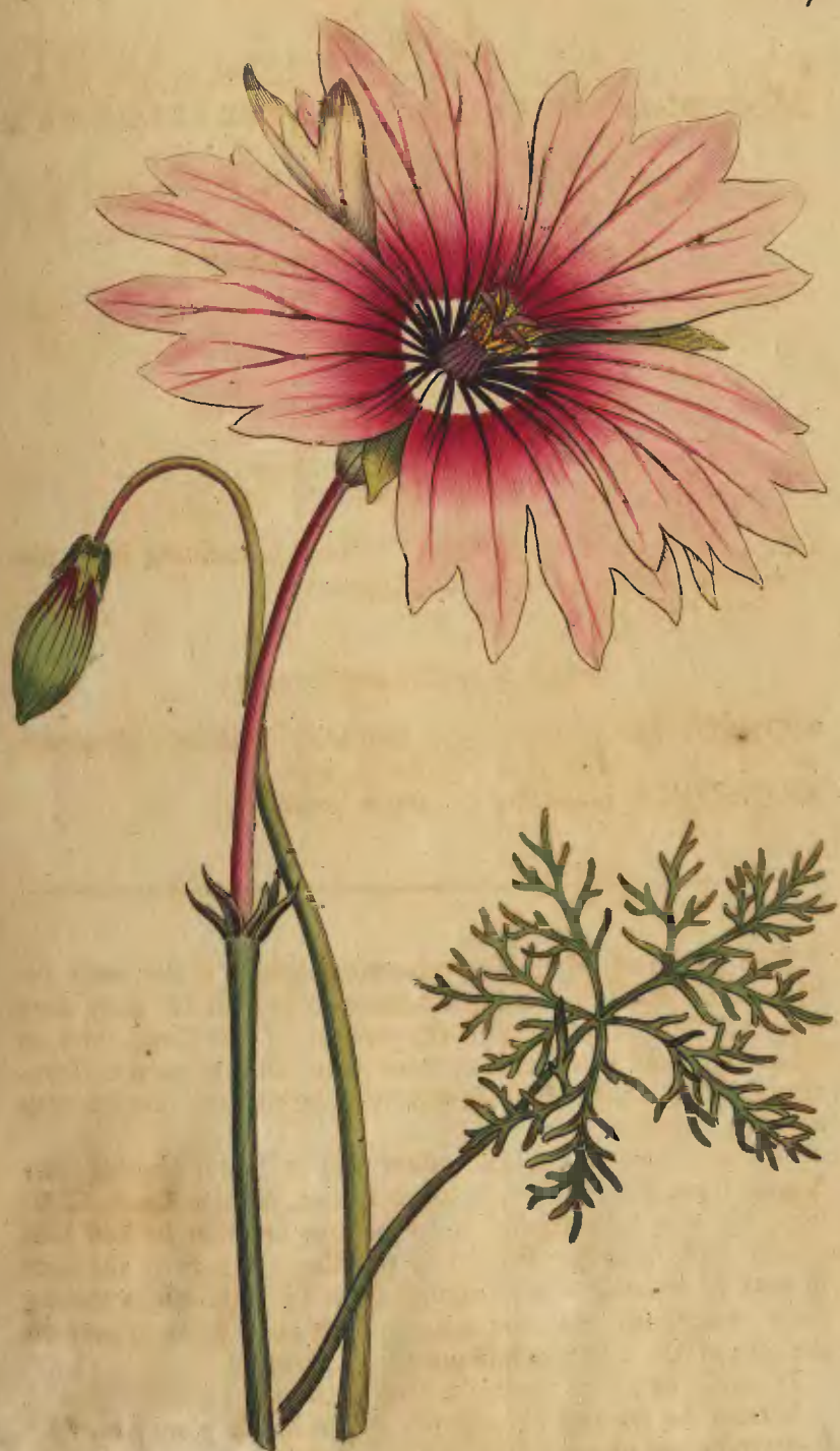
Pub d. as the Act directs. Feb ry . 1789. by W. Curtis, Botanic Garden, Lambeth, March.

Should be treated as a hardy green-house plant; may be sheltered even under a frame, in the winter.