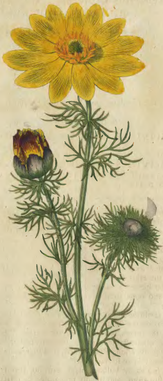
Publ. Oct. 1870 by W. Curtis Sculp. Georges Crescent