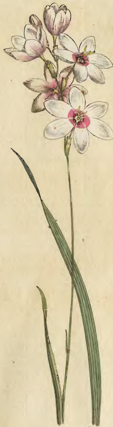
Published as the Act directs August 1.1790 by W. Curtis S r Georges Crescent.

“ All the forts multiply very fast by offsets, so that when “ once obtained, there will be no occasion to raise them “ from seeds: for the roots put out offsets in great plenty, “ most of which will flower the following season, whereas “ those from seeds are three or four years before they flower. “ These plants will not thrive through the winter in the full “ ground in England, so should be planted in pots, and “ placed under a frame in winter, where they may be pro- “ tected from frost, but in mild weather should enjoy the free “ air; but they must be guarded from mice, who are very “ fond of these roots, and if not prevented will devour “ them.” Miller's Gard. Diet.