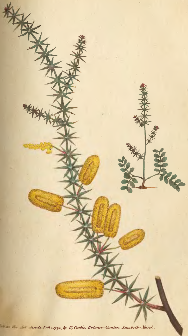
Tab. as the Act direct. Feb. 1. 1790. by W. Curtis, Botanic-Garden, Lambeth-Marsh.

It is some years in arriving at its flowering state.