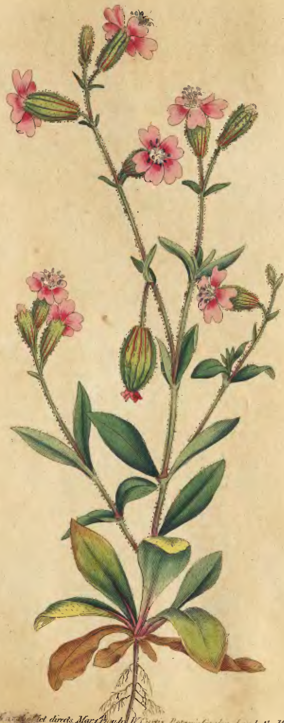
Prodr. Hort. Bot. Mar. Hort. W. Curtis, Botanic Garden, Lambeth-Marsk.