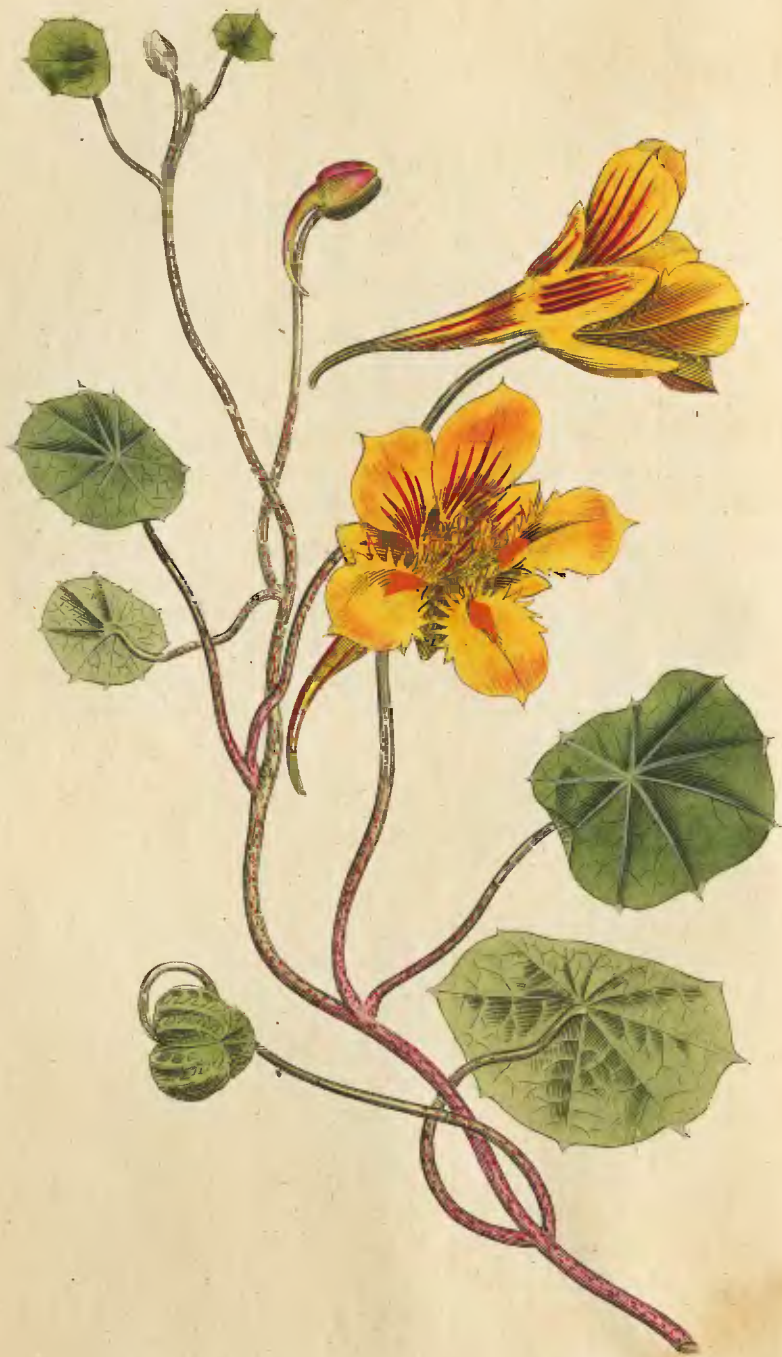
Pub d as the Act directs Oct r . 1789 by W. Curtis Botanic Garden, Lambeth Marsh.