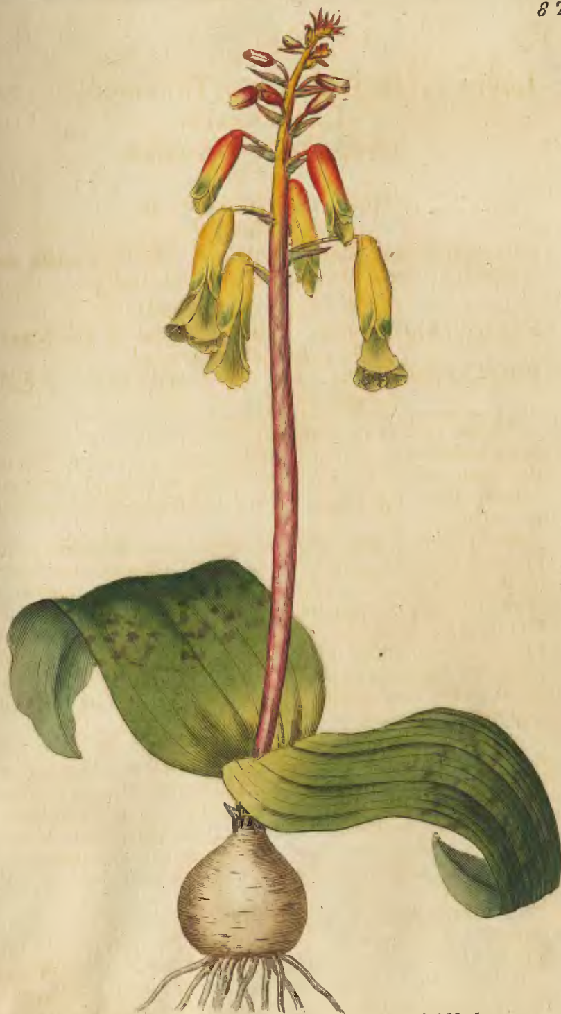
Pub d as the Act direct May 1787 by W. Curtis Botanic Garden Lambeth Marsh

It is increased by offsets from the bulbs.