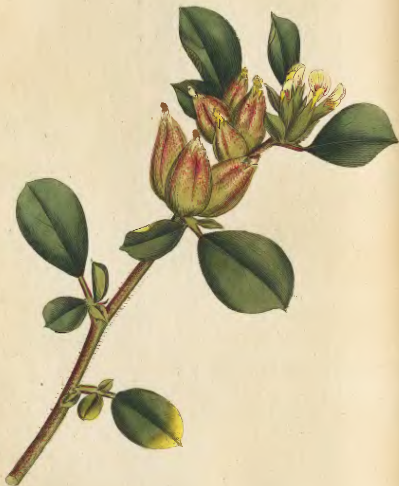
Pub. as the Act directs, Jan. 1. 1790. by W. Curtis, Botanic Garden, Lambeth Marsh.