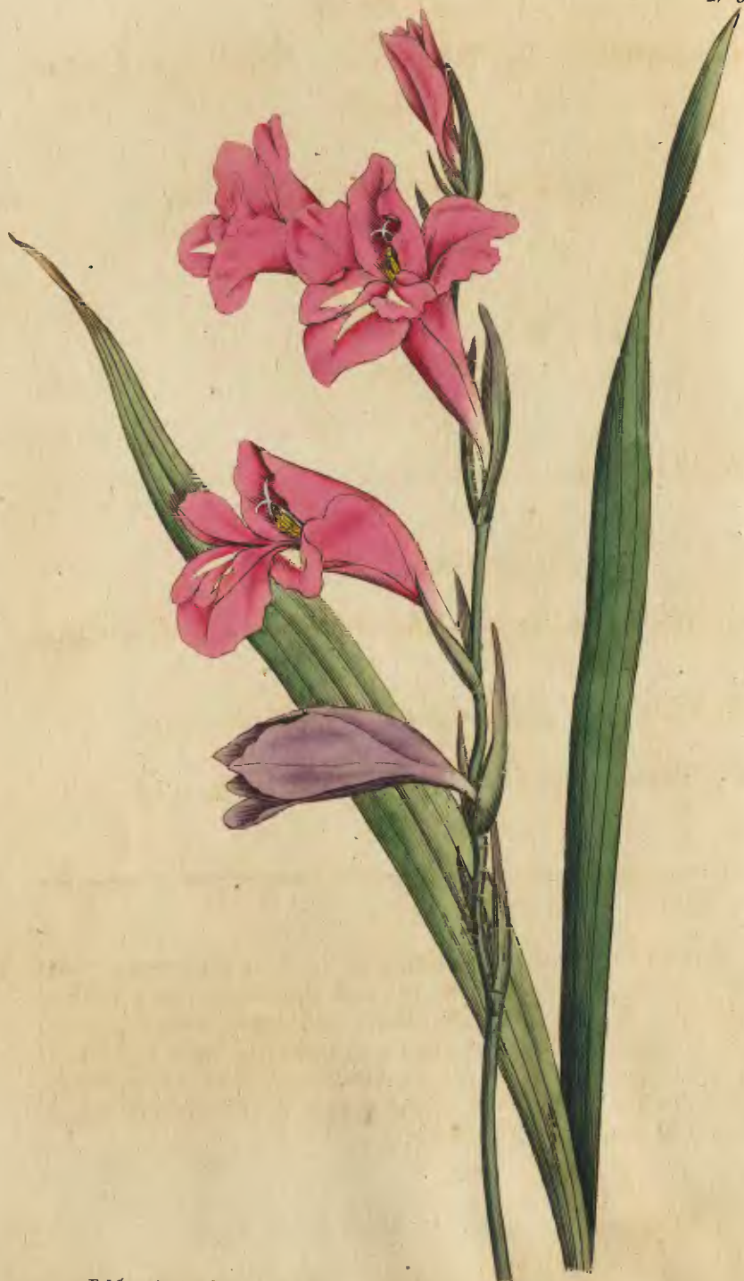
Pub d as the Act directs June 13 1789, by W. Curtis, Botanic Garden, Lambeth, Marsh.