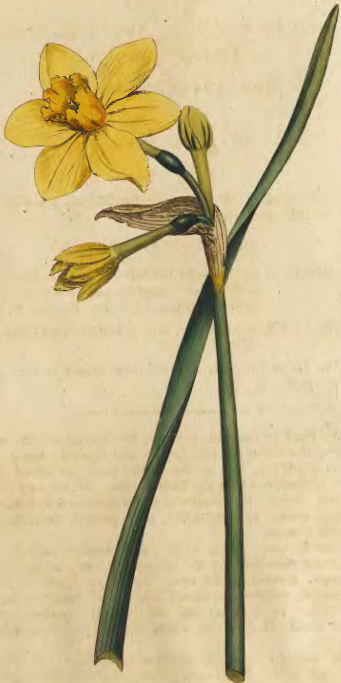
Pub d as the Act direct. March 11789. by W. Curtis. Botanic Garden, Lambeth, Marsh.