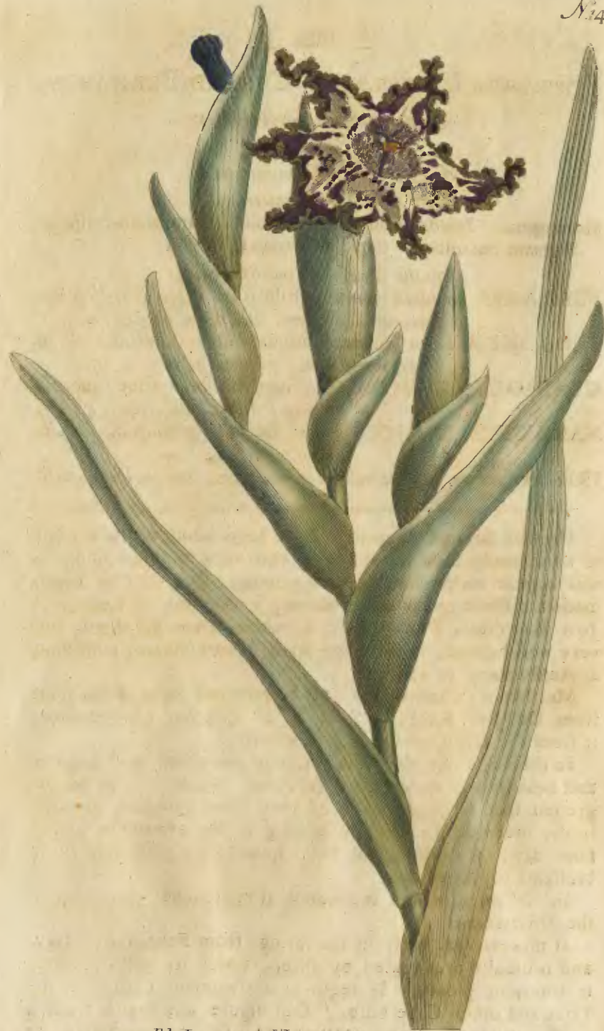
Flb. Jan. 1790. by W. Curtis. Sc. Georg. Cris. Cent.