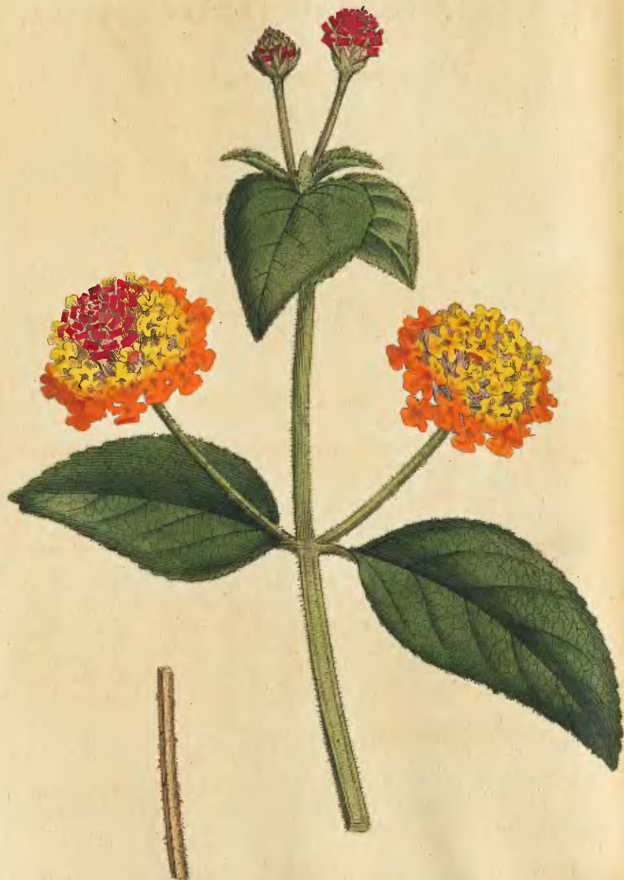
Pub d as the Act directs. Sep r 1789, by W. Curtis, Botanic Garden, Lambeth Marsh.