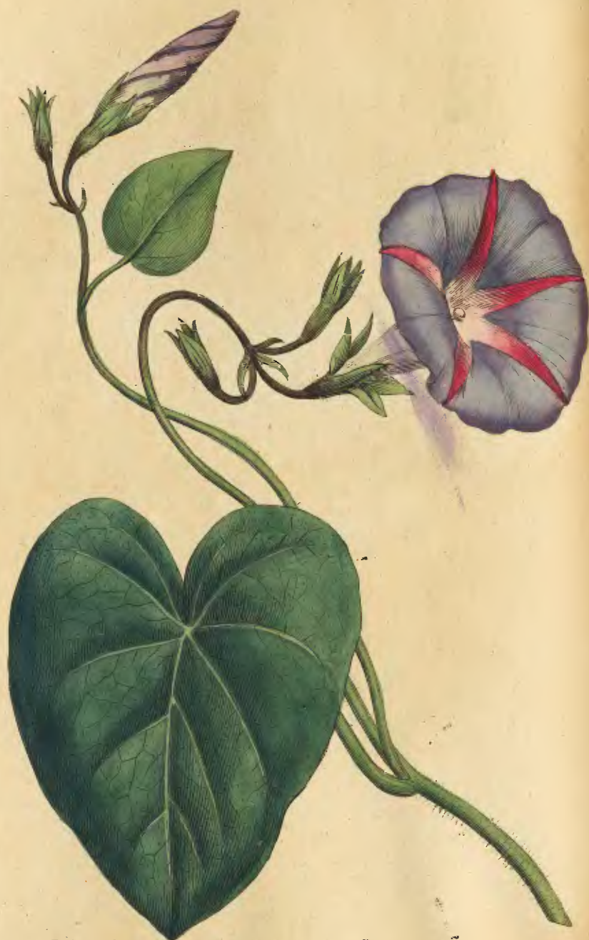
Pub. as the Act directs, Mar. 1790, by W. Curtis, Botanic Garden, Lambeth-Momb.