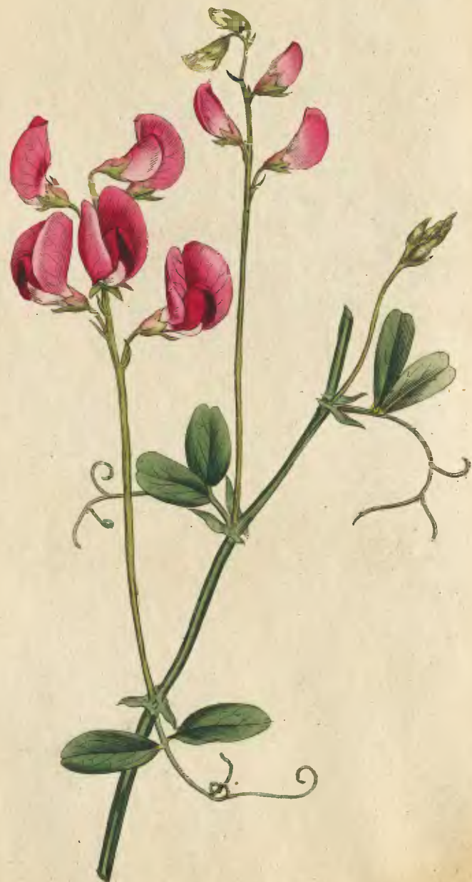
Pub. as the Act directs, Feb. 1, 1790. by W. Curtis, Botanic-Garden, Lambeth-Marsb.

LATHYRUS arvensis five terræ glandes. Pease Earth-Nuts. Parkin's Theat. p. 1061.