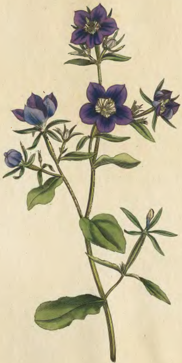
Pub d as the Act directs Nov r 2. 1769 by W. Curtis Botanic Garden Lambeth Marsh.