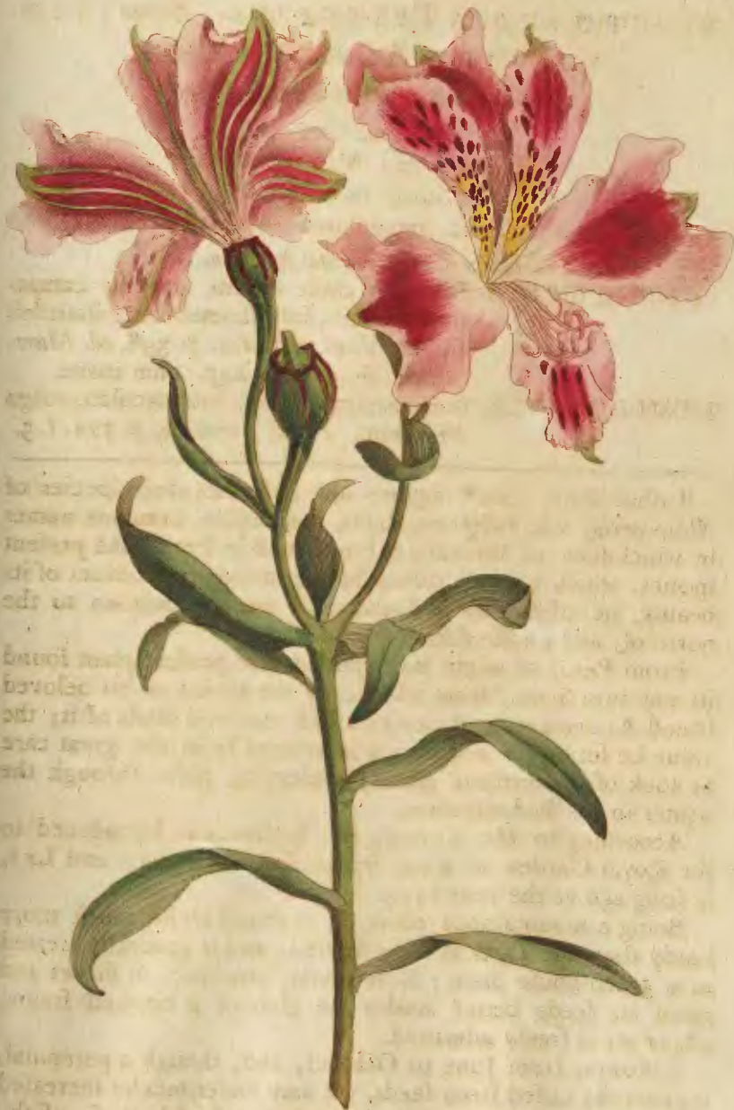
Tab. Dec. 7. 5. W. & A. G. C. C. C.

* In his Journal des Observations Physiques, Mathematiques, et Botaniques, faites sur les Côtes Orientales de l'Amérique meridionale, &c. printed in 1714.