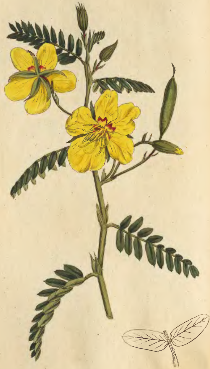
Pub. as the Act directs, Jan. 1. 1790. by W. Curtis. Botanic Garden, Lambeth-Market.