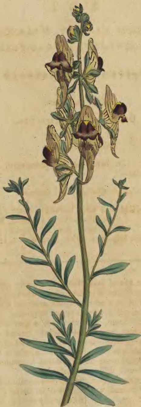
Pub d as the Act directs, Feb y 1. 1789, by W. Curtis, Botanic Garden, Lambeth Marsh.