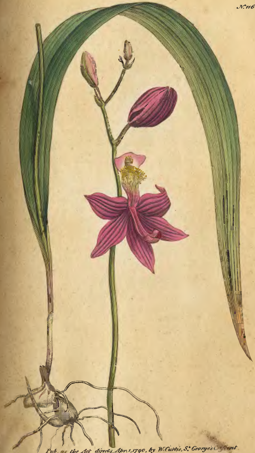
Pub. as the Act directs, Apr. 1. 1790. by W. Curtis, S. George's sculp.

Our figure will make a description of the plant unnecessary, its flowering stem with us has arisen to the height of a foot and a half, the number of flowers has not exceeded five. In its most luxuriant state it will probably be found much larger, and to produce more flowers.