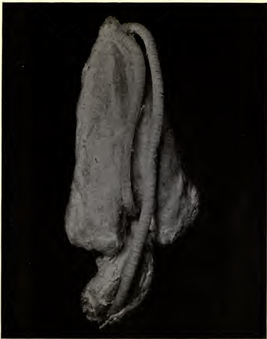
BREAST AND TRACHEA OF MALE Ortalis vetula plumbeiceps.