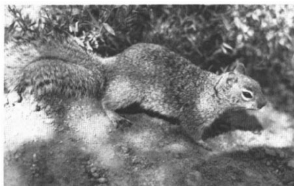
FIG. 1. Photograph of a rock squirrel.

Ranges of means of standard external and selected cranial measurements (in mm) and ranges of original measurements (in parentheses) for the seven subspecies of S. variegatus (Howell, 1938) are as follows: total length, 466 to 503 (430 to 540); tail vertebrae, 189 to 233 (174 to 263); hind foot, 57 to 62.7 (53 to 65); and ear from notch (dry), 17 to 26.3 (15 to 29); greatest length of skull, 57.9 to 65.6 (56 to 67.7); palatal length, 27.7 to 31.5 (26 to 32.5); zygomatic breadth, 35.6 to 40.5 (34 to 42.4); cranial breadth, 24.1 to 26.1 (23.5 to 26.6); interorbital breadth, 13.5 to 16.9 (13.2 to 18.8); postorbital constriction, 16.9 to 17.9 (16 to 19.6); length of nasals, 20.4 to 23.8 (18.5 to 24.8), and length of maxillary tooth row, 11.3 to 13.4 (10.7 to 14). Howell (1938) reported separate means for samples of adult males and females for