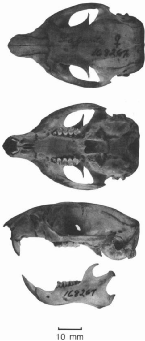
FIG. 2. Dorsal, ventral, and lateral views of the cranium and lateral view of the left mandible of Spermophilus variegatus grammurus (USNM 168267, adult female from 18 mi S La Junta, Otero Co., Colorado; occipitonasal length 58.0 mm).

three subspecies ( variegatus , rupestris , and utah ) but performed no statistical comparisons between the sexes; however, in the most instances (25 of 28), means for males were larger than those for females, suggesting sexual dimorphism for size in the rock squirrel. Published data on body mass also indicate that males average larger than females. Reported mean weights (in g) of adult rock squirrels from Coahuila, Mexico (Baker, 1956) are: 4 males, 621 (range 470 to 875), 5 nonpregnant females, 546 (450 to 634); from central Texas (Johnson, 1979): 13 males, 855.4, 19 females, 734.5; from Nevada (Hall, 1946): 5 males, 684.3 (580.3 to 742.5), 3 nonpregnant females, 708.6 (643.5 to 795.5). Adult rock squirrels show substantial seasonal weight gains during preparation for hibernation (Juelson, 1970; Layton, 1973).