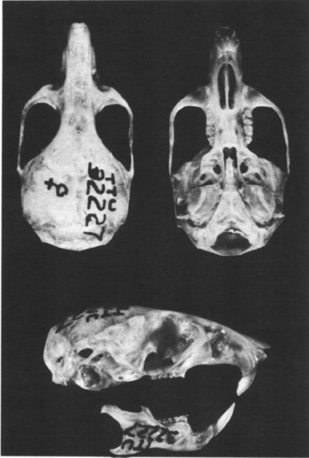
FIGURE 2. Dorsal, ventral, and lateral views of skull, and lateral view of lower jaw of Reithrodontomys megalotis megalotis (TTU 32227, female) from 6 mi N, 6 mi E Ft. Davis, Jeff Davis Co., Texas. The greatest length of skull is 21.9 mm.

Tamaulipas (Goodwin, 1954) frequently have a buffy pectoral spot, as do many individuals of R. m. longicaudus from the San Francisco Bay area (Fisler, 1965). Albinism is a rare recessive condition similar to that found in Mus (Egoscue, 1958).