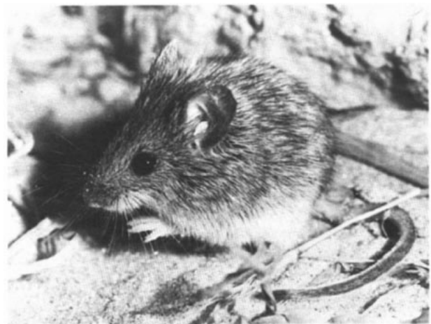
FIGURE 1. Reithrodontomys megalotis dychei from Lawrence, Douglas Co., Kansas.

GENERAL CHARACTERS. The dorsal pelage is one of two types, grayish to blackish guard hairs that are less numerous than shorter cover hairs. The latter are gray basally, with a buffy terminal band or a buffy subterminal band and a black terminal tip. In addition, R. m. dychei east of the Missouri River (Hoffmeister and Warnock, 1955) and R. m. hooperi from southwestern