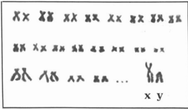
FIGURE 4. Karyotype of Reithrodontomys megalotis megalotis (TTU 4678, male) from Mt. Locke, Ft. Davis State Park, Jeff Davis Co., Texas. Note the three supernumerary chromosomes.