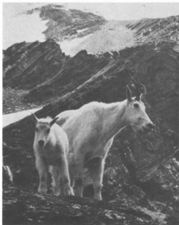
FIGURE 1. Mountain goats photographed in Glacier National Park, Montana, in August 1969, by C. B. Rideout. The female is in summer pelage and the kid is about two months old.

Unlike the heavy skulls of wild sheep, the skull of the mountain goat is light and fragile (figure 2). Hall and Kelson (1959) gave the following measurements (in millimeters): Basal length of skull (measurement A in figure 2), 270 to 293; occipitonasal length (B), 299 to 336; interorbital breadth (C), 95 to 98; palatilar length (D), 176 to 184; length of maxillary toothrow (E), 69 to 77.