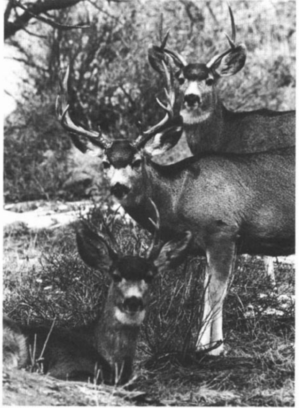
FIGURE 2. Three male Rocky Mountain mule deer ( Odocoileus hemionus hemionus ).

Yukon Territory, Canada (Wallmo, 1981a) but boundaries are provisional. The eastern edge of the usually occupied range extends from southwestern Saskatchewan through central North and South Dakota, Nebraska, Kansas, and western Texas, but isolated occurrences are reported from Minnesota, Iowa, and Missouri (Wallmo, 1981a). Major gaps in geographic distribution are in the Mojave and Sonoran deserts in southern Nevada, southeastern California, southwestern Arizona and northwestern Sonora, the Central Valley of California, and probably the Great Salt Lake desert region. Oth-