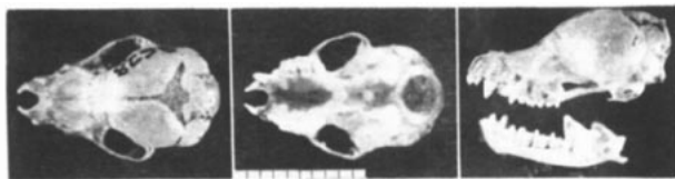
FIGURE 1. Skull and lower jaw of Myotis thysanodes on deposit at the Natural History Museum of Los Angeles County.

FUNCTION. A detailed analysis of thermoregulatory patterns within a maternity roost was described by Studier and O'Farrell (1972). Thermal patterns and levels of thermoregulation of the summer colony (April to September) were characterized as highly variable. At ambient temperatures ( T_a ) of 24°C or less, individuals could be classed either as conformers (poikilothermic response) or regulators (homeothermic response). During pregnancy and lactation there were significantly more regulators, although there was an average of 17% conformers; however, during lactation, 50% were conformers. Within the pregnant group, mid-pregnancy was characterized by a significant number of regulators, whereas early and late pregnant groups approached 40% conformers. Throughout the study, 16 to 25% of all individuals exhibited the phenomenon of "shifting" from regulation to conforming and vice versa. Myotis thysanodes becomes partially hy-