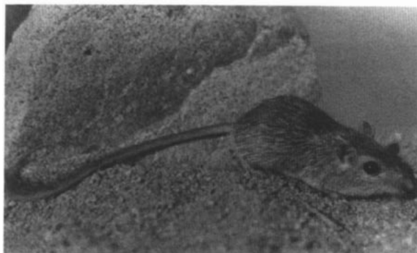
FIG. 1. Photograph of Chaetodipus spinatus bryanti from San José Island, Baja California, Mexico.

DIAGNOSIS. The presence of pronounced rump spines distinguishes C. spinatus from pocket mice in the genus Perognathus and from C. formosus , C. hispidus , C. baileyi , C. penicillatus , C. pernix , C. artus , C. lineatus , and C. arenarius . C. spinatus differs from C. dalquesti in possessing pronounced bristles, often on the flank in addition to the rump, and markedly hispid pelage. From C. nelsoni , C. intermedius , C. anthonyi , C. fallax , C. californicus , and C. goldmani , C. spinatus is distinguished by its lack of a well-marked lateral line (Hall, 1981).