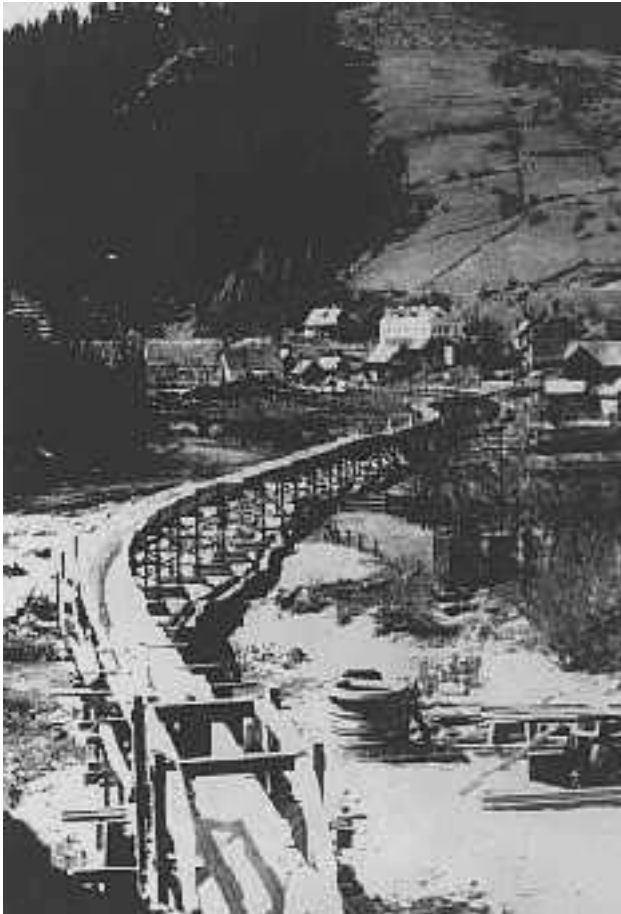
One of Schauberger's constructions for wood transport (1930's)

In 1918 the first possibility presented itself to bring these discoveries into practice. It was winter, and because of the First World War fuel was scarce, and the working horses that were used to carry wood from the forests had all been sent to the front. The magistrate of Linz gave Schauberger the chance to solve the problem of fuel for the city. Except for a few streams, there weren't any big rivers to transport the trees from the forests to the city. The stream was discarded as means of transportation by the foresters. But Schauberger decided it was possible, namely in early morning hours by full moon, when, according to him the water was at it's strongest. He succeeded in transporting 1600 cubic meters of forest trunks into the valley. With this method, which Schauberger later on developed into water viaducts for tree transportations, he became greatly acclaimed. By ensuring the right temperature of water, and supporting it's own, meandering movements, huge tree trunks could be transported on a very thin layer of water.