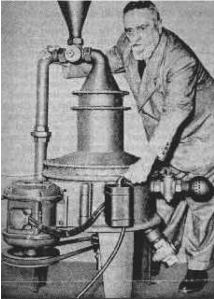
Schauberger with a model of his house generator, 1953

to build a different constructive basis for his technology. It is known that in 1953 he worked on a house-generator with spiral-formed pipes, with which one could get cheap and clean energy for the household. This finally resulted in his request for an extensive patent based on the principle of the 'up rolling movement.' Several patent bureaus refused to take his request in consideration, because they reasoned this was not a discovery in the classical sense of the word, but a discovery of a new natural law.