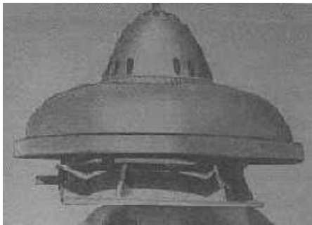
Onde of Schauberger's flying models

After the war, the Americans held him in custody; for six months 6 military men guarded him day and night. When he was released, they forbade him to do any more research on the subject. Nevertheless, Schauberger went on with his research, even though he refused to accept foreign funds, causing him to work with very restricted means, all by himself.