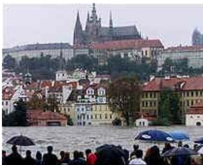
Prague, August 2002