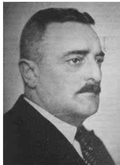
Victor (German: Viktor) Schaubberger

In this way Schaubberger learned, by studying water, step-by-step its forces and laws. For example that coolness and darkness strengthen water. A dried up spring started flowing again after a wall had been built around it, to protect it from the sun. This wall had been taken away earlier, after which the spring had dried up. He also found out that the optimal temperature for water is 4 degrees Fahrenheit. The fish looked for areas with this temperature to breed, the vegetation along the sides of these spots was the richest. Also, the movement of water plays an important part in its well being; water tends to meander out of itself, and makes circling, winding movements.