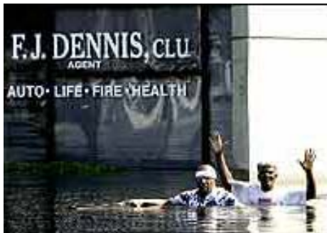
Katrina, September 2005