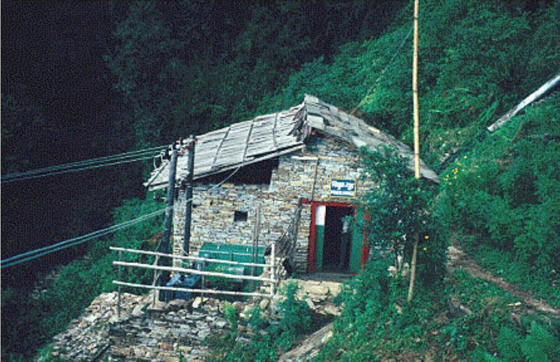
Figure 2: Micro hydro scheme showing the power house, the penstock and the transmission lines

possible where river flow fluctuates throughout the year or where daily load patterns vary considerably.