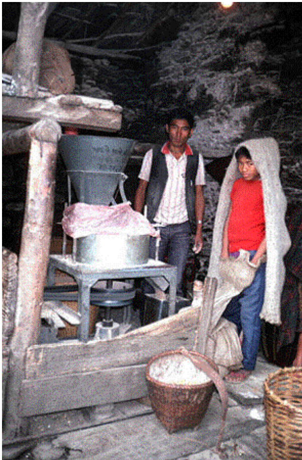
Figure 3: Micro hydro powered grain milling by villagers in Barpak, Nepal