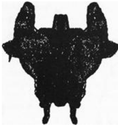
Figure 5. 2. An inkblot or... ?

Personal interests, occupations, and personality can strongly influence people's experience. This fact is used in tests like the Rorschach inkblot test that use interpretations of ambiguous figures for personality assessment. In a classic study of imagination, Bartlett noted that subjects asked to interpret inkblots frequently reveal much information about their personal interests and occupation. For example, the same inkblot reminded a woman of a "bonnet with feathers," a minister of "Nebuchadnezzar's fiery furnace," and a physiologist of "an exposure of the basal lumbar region of the digestive system." 2 See Figure 5. 2: what does the inkblot look like to you?