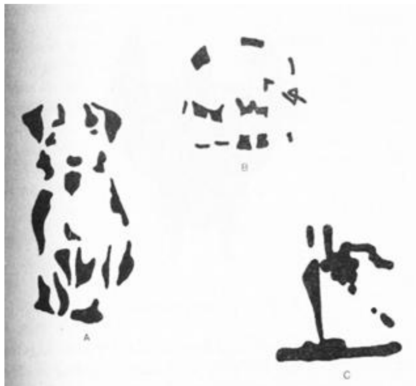
Figure 5. 1. Incomplete figures

It also is easier to perceive the familiar than the unfamiliar. Study Figure 5.1 until you have identified all three elements. How long did it take you to identify each of the three figures? You probably identified the dog first, then the ship, and finally the elephant. This corresponds to the relative familiarity of the three images. The familiar, of course, is the expected.