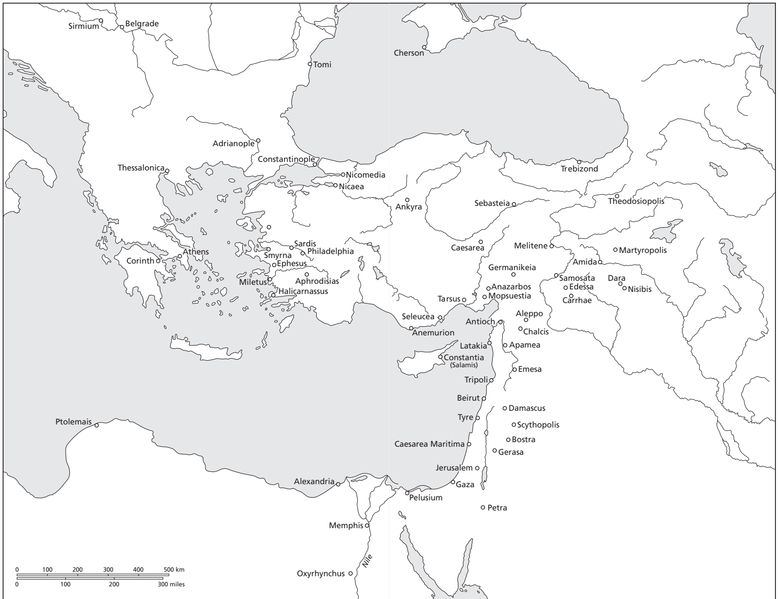
Map 1 The Byzantine Empire, c. 500