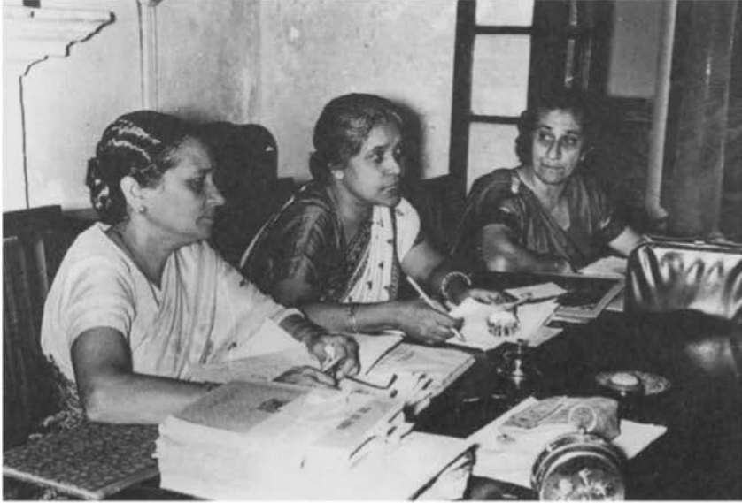
7 Renuka Ray as president of the All-India Women's Conference with two of her officers, 1952

all women. Amrit Kaur, one of Gandhi's devoted followers, wanted the organization to emerge as a political force for women. This proposal was voted down. The AIWC was committed to a comprehensive legal bill for women. This project was not popular with Muslim women, many of whom believed Muslim law came from the Quran and could not be tampered with. Efforts to bring lower-class rural and urban women into the organization centered on dropping membership dues to 4 annas rather than developing programs of interest to these women. None of these problems was solved at the national level.