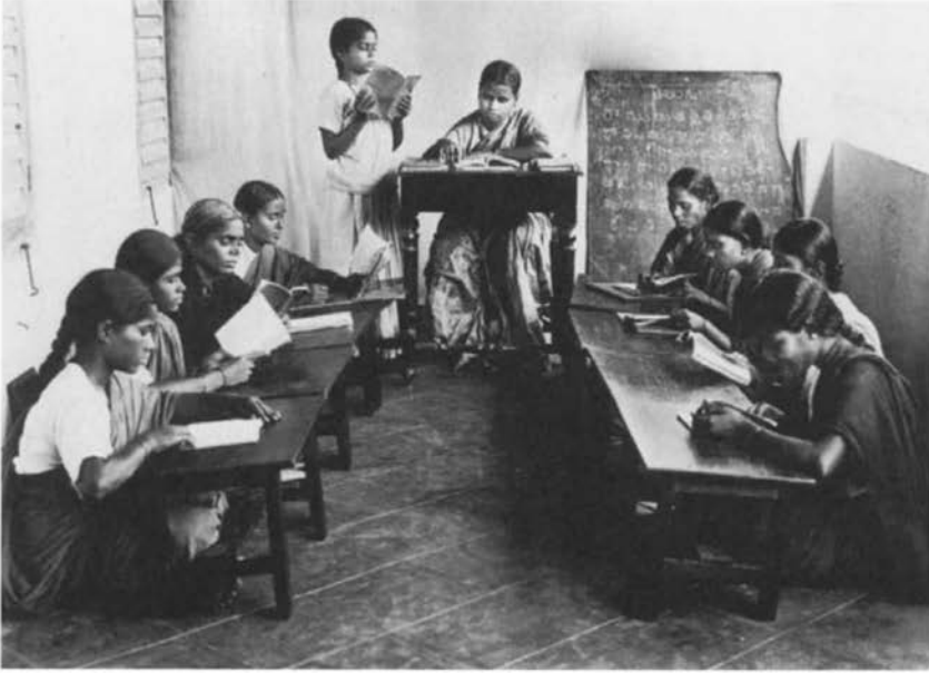
4 Indian girls at school in Madras, by R. Venkiah Bros, c. 1930

fact that 98 percent of school-age girls were not in school, authors of the Hunter Commission Report recommended more liberal grants-in-aid for girls' schools than for boys' and special scholarships and prizes for girls. In the next two decades higher education expanded rapidly; whereas there were only six women in Indian universities in 1881–82, by the turn of the century there were 264. During the same time period secondary school enrollment rose from 2,054 to 41,582. 33