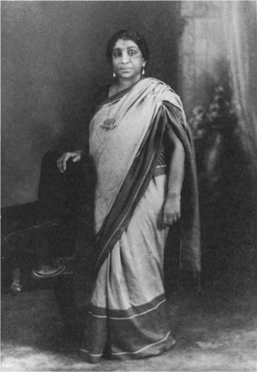
12 Portrait of Sarojini Naidu, c. 1930