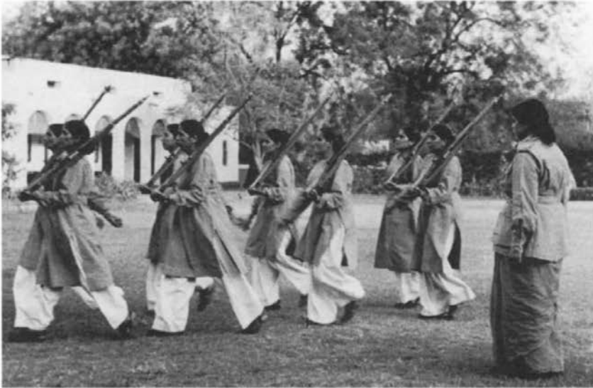
17 Indian women police, n.d.

appears that well-off peasant families continue to spend on sons and deprive daughters. In other words, son preference persists even in prosperous families. 58