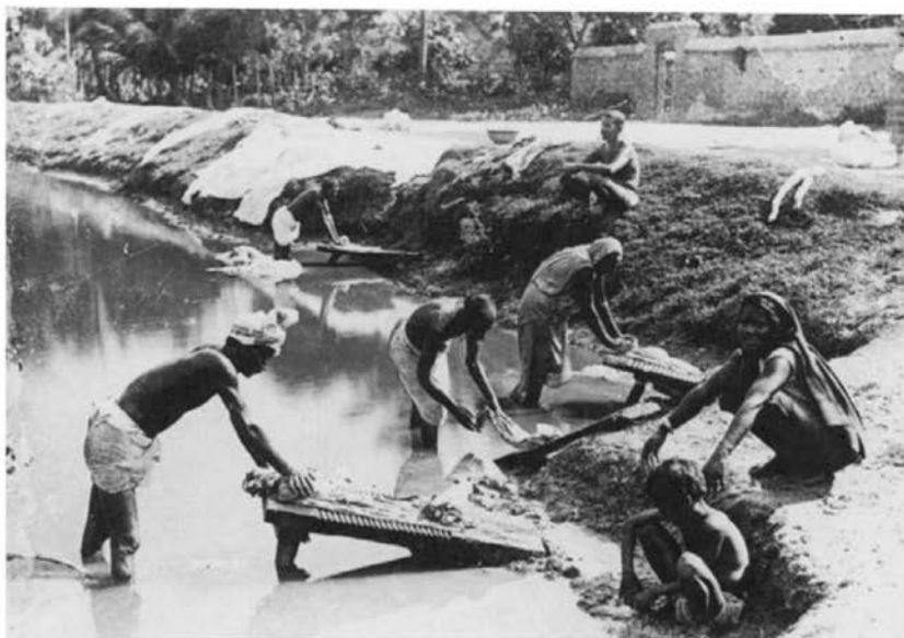
15 Washermen and washerwomen, c. 1900