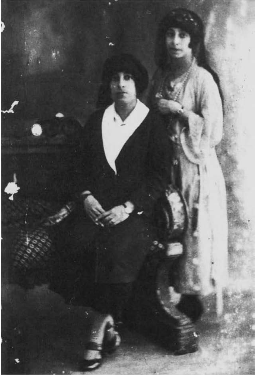
10 Herabai and Mithan Tata in London, 1919