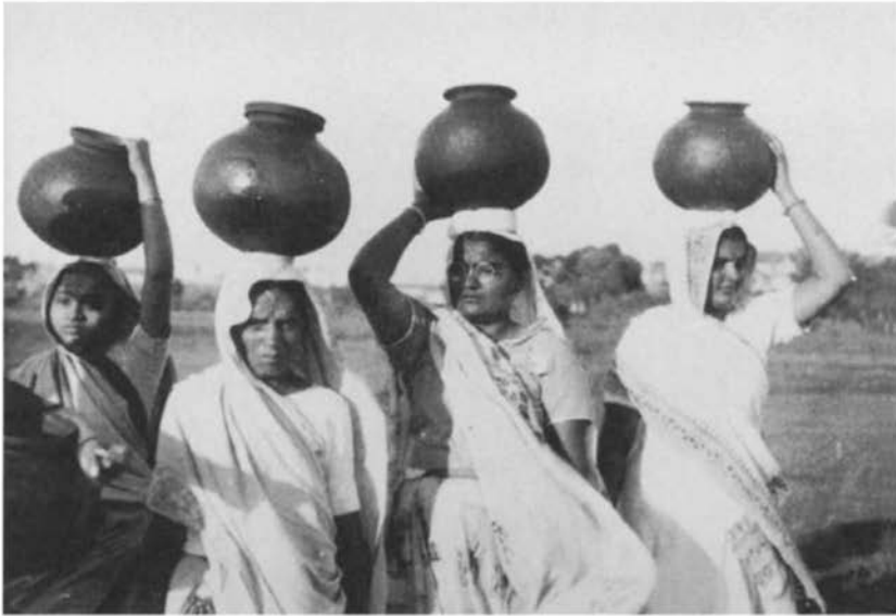
13 Women brining brine to salt pans in Vile Parle Camp, Bombay during civil disobedience movement, 1930

The DSS had designed and supervised this campaign. In the early excitement of activity, women flocked to join this organization that soon had 560 members. It was apparent many of these were “ornamental sevikas ,” for when pressed into service they lost interest. The number of active DSS members dropped to about 300. 36