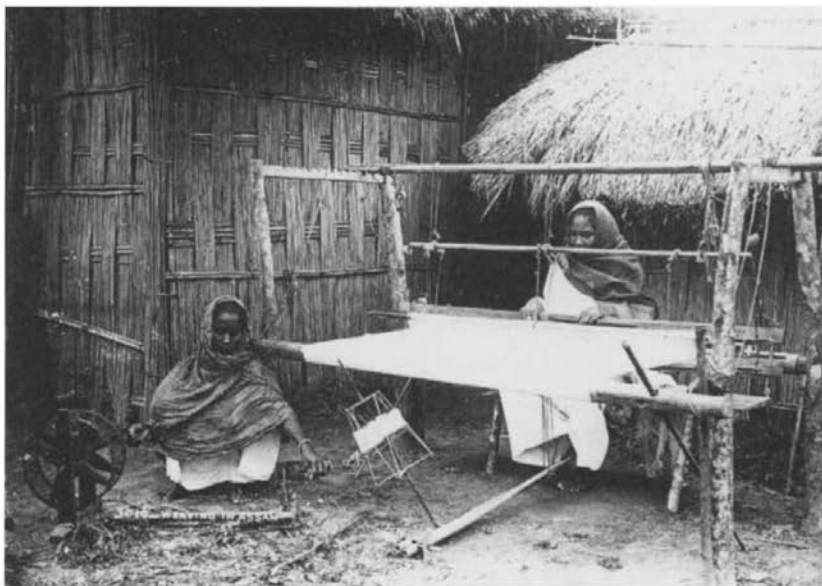
14 Women weavers in Assam, c. 1900