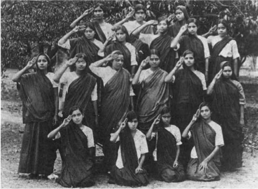
11 In training to join Gandhi: Bharat scouts, Allahabad, 1929