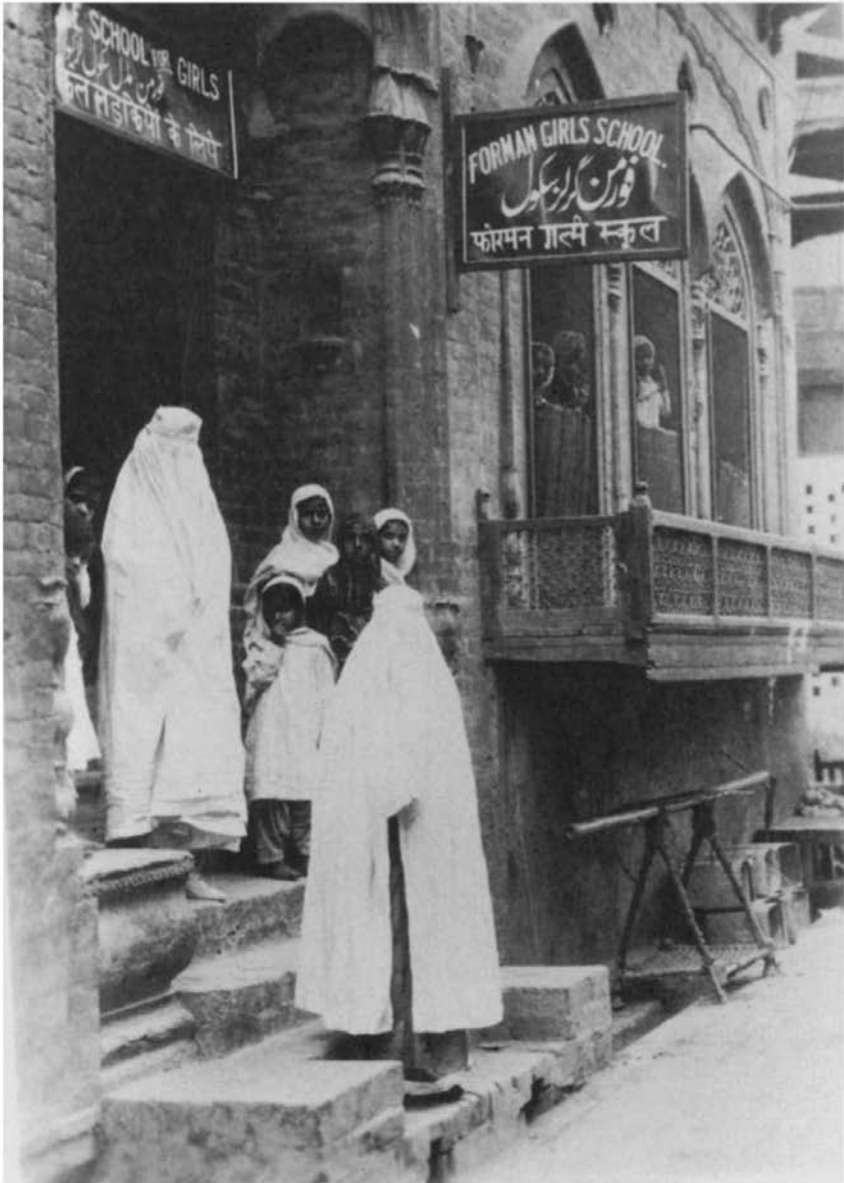
2 Entrance to Forman Girls' School, Lahore, 1936