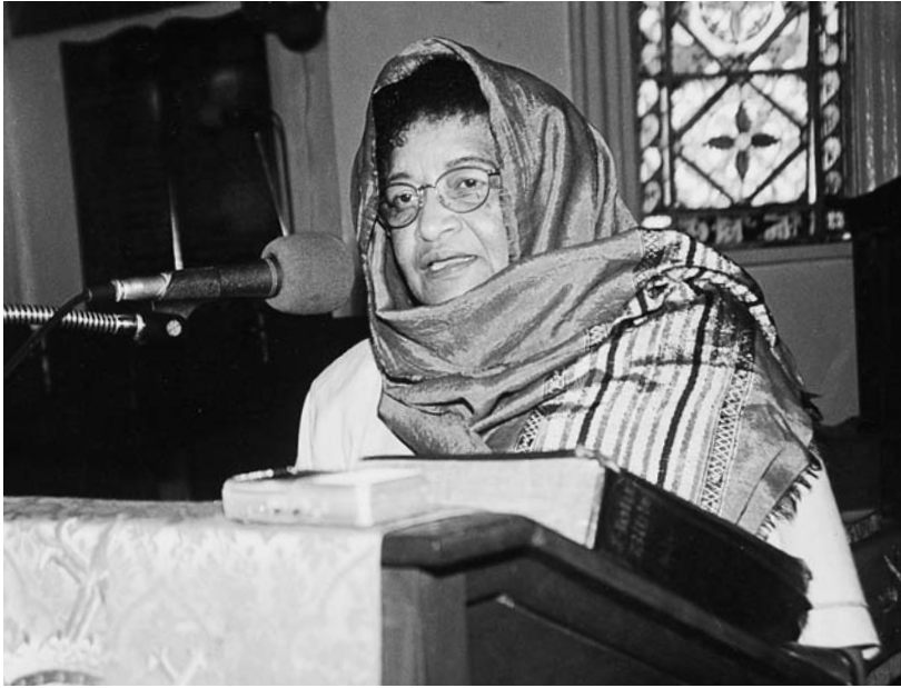
(Above) Ellen speaking at a mosque in Monrovia.