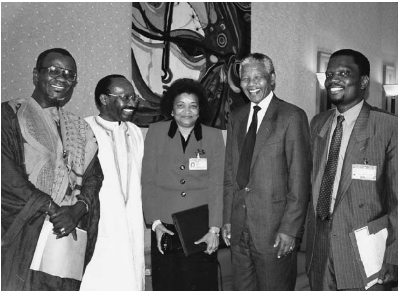
(Below) With Nelson Mandela.