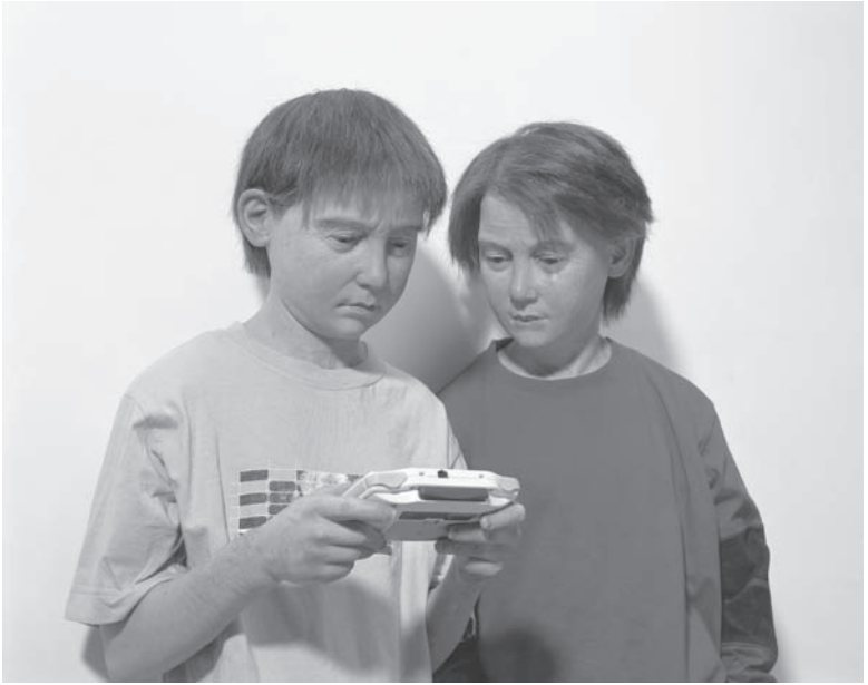
Figure 6. Patricia Piccinini, Game Boys Advanced (2002) (detail), silicone, polyurethane, clothing, human hair, dimensions variable.

come about because of our changing perceptions of sex and reproduction in a biotechnological age. In his essay “The Hell of the Same” 5 Baudrillard reflects on the consequences of a form of reproduction that relies on the propagation of genes from one cell: