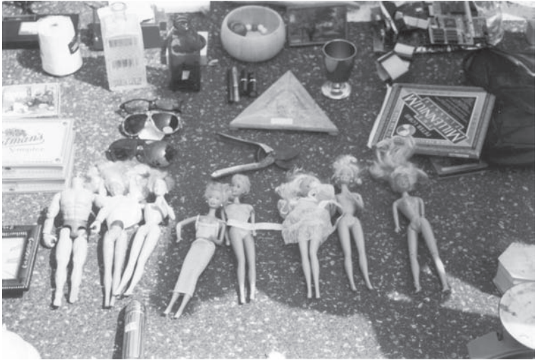
Figure 1. Barbies at the Flea Market .

one is bound to wonder what is so transformative about a doll whose unrealistic and unattainable bodily proportions make women feel inadequate? If the model of female success and beauty has a tiny waist, long blonde hair and wears couture, then what does that tell us about how women are valued in society? Questions like these have dominated contemporary understandings of Barbie, whose iconic status as the perfect model of femininity has been largely criticised by academics as being detrimental to women and girls. I want to move past these familiar arguments to look at Barbie in a different light.