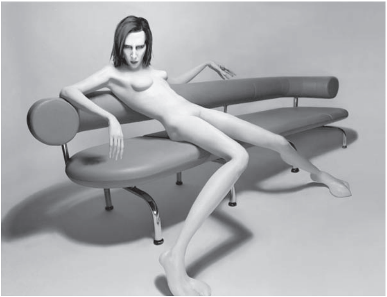
Figure 2. Marilyn Manson, Mechanical Animals album centrefold image.

But it is not only the difference between the sexes that Manson contests. Opening the cover sleeve reveals a centrefold image of Manson languidly stretched out on a sofa made of grey tubing (see figure 2). What this picture shows that the front cover doesn't is Manson's metamorphosis into a hybrid of animal, human and machine. Most striking is the transformation of Manson's feet into pincer-like hoofs that define him as the 'mechanical animal' of the CD title. Rendered like a cartoon character's, there is a comic element to his clumsy, oversized hoofs. These bovine appendages challenge the integrity of the organic body, teasing and taunting the viewer to make something of Manson's morphogenesis into an animal.