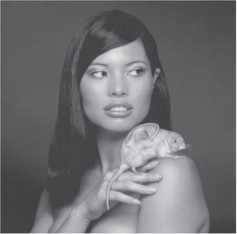
Figure 4. Patricia Piccinini, Protein Lattice-Red Portrait (1997), digital C-type photograph, 80x80cm.