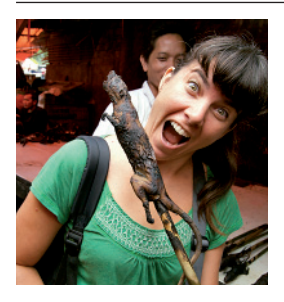
CELESTE BRASH No don't worry, I didn't take a bite. Forest rat is sold raw to prepare yourself. The Tomohon market (p714) is a showcase of all sorts of local critters getting butchered. It was one of the goriest places I've ever been – not for the faint-hearted.

I'd been following coursing streams of water across Bali's impossibly green rice fields all day in search of new little places to stay. I was thinking just how serene it was when I saw this sign and thought 'Aha! I can just stay for good and start a new clean career.'