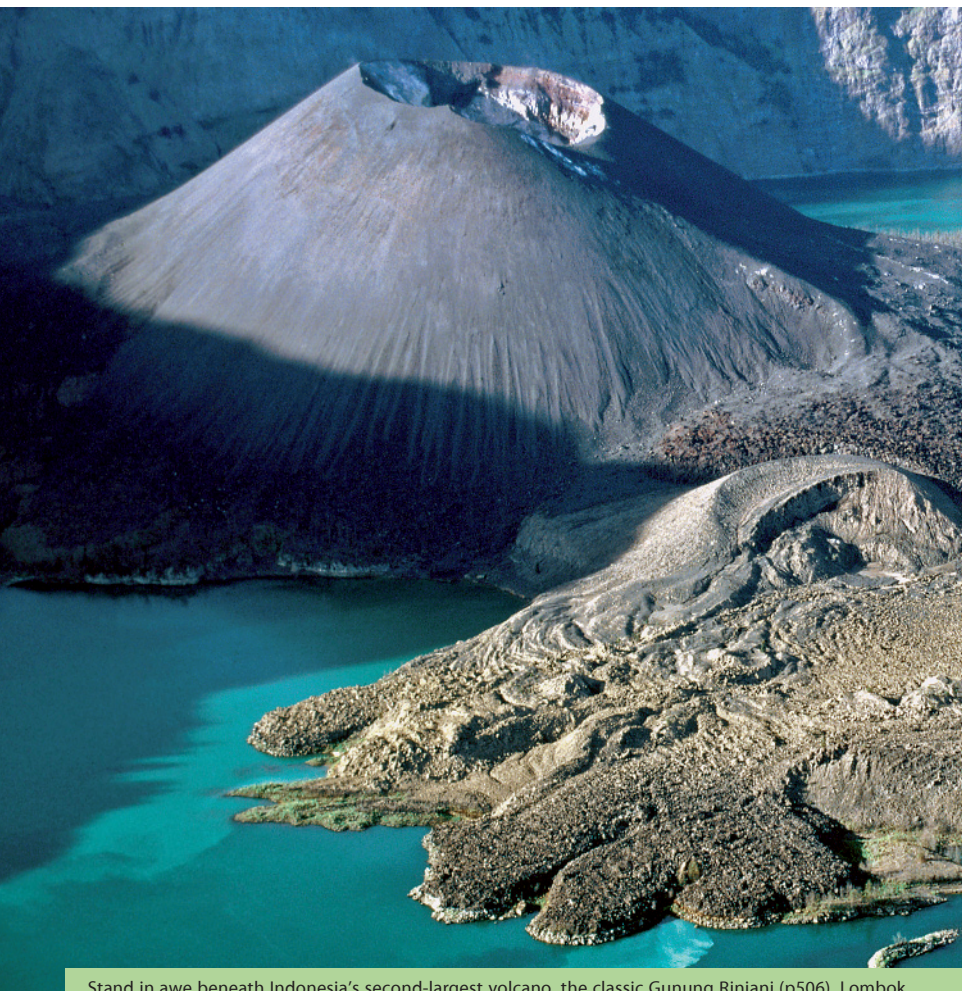
Stand in awe beneath Indonesia's second-largest volcano, the classic Gunung Rinjani (p506), Lombok