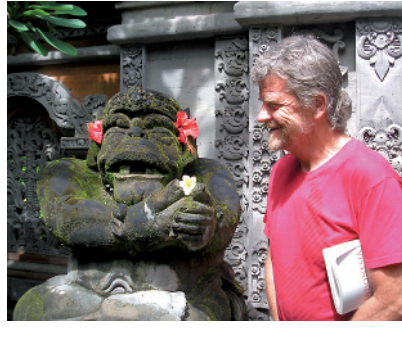
No idea who this ugly but amiable character in a Balinese garden was. But I liked his mossy texture and daily fresh flowers. Note to the Lion Air passenger at Ambon who stole the book under my arm: I'll get you one day.

After a four-hour delay, this Pelni cruiser finally pulled into Lewoleba's (p558) gritty harbour after 2am. At which time I, the boat's lone bule (foreigner), collapsed for a few hours sleep and woke up to shafts of sunlight in my eyes and these guys hovering over me, guarding my belongings. God bless the good people of way-out Indonesia.