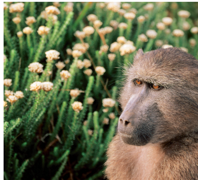
Chacma Baboon in front of fynbos vegetation, Cape of Good Hope Nature Reserve, Western Cape.

When on safari, it's worth remembering that wildlife tourism is one of the main sources of revenue for conservation efforts in South Africa (as well as in neighbouring Swaziland). The money you spend in national parks and reserves is ploughed back into these areas, thus ensuring that future visitors will be able to collect their own unforgettable memories.