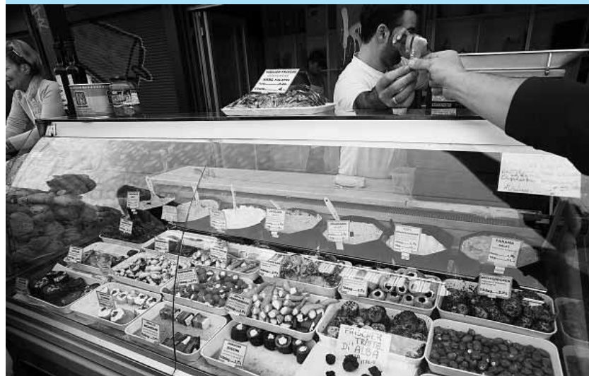
Stuffed peppers for sale at Naschmarkt (this page)

The city has 14 such markets, the bigger of which are at Brunnenmarkt, Karmelitermarkt, and Naschmarkt (p185). Smaller markets include Rochusmarkt (Map pp262-3; 03, Landstrasser Hauptstrasse) in Landstrasse, Meidlinger Markt (Map pp260-1; 12, Niederhofstrasse) in Meidling, Viktor-Adler-Markt (Map pp262-3; 10, Viktor-Adler-Platz) in Favoriten, Hannovermarkt (Map pp258-9; 20, Hannovergasse) in Brigittenau and Floridsdorfer Markt (Map pp252-3; 21, Pitkgasse) in Floridsdorf. Freyungmarkt (Map pp254-5; 01, Freyung; h 8am-7.30pm Fri & Sat; b U2 Schottentor, bus 1A) is a sedate affair selling organic produce from farmers.