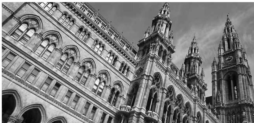
Façade of Rathaus (this page)

In general, guided tours (leaving from Gate 1) run at 10am, 11am, 2pm, 3pm and 4pm Monday to Friday year-round; on Saturday they leave at 10am, 11am, noon and 1pm. Tours are cancelled when the parliament is in session. The Parliament's visitors centre (admission free; h 9.30am-4.30pm Mon-Fri, 9.30am-2pm Sat), directly behind Athena, covers the history of Austrian politics and explains how parliament runs through the use of a multimedia show of video clips and interactive screens. A combined ticket for a tour of Parliament and entrance to Palais Epstein costs adult/child €7/3.