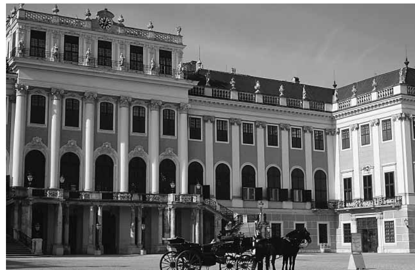
Flaker outside Schloss Schönbrunn (opposite page)

To the east of the palace is the Privy Garden (adult/student/child €2/1.50/0.90; h 9am-6pm Jul & Aug, 9am-5pm Apr-Jun, Sep & Oct), a replica of the Baroque garden that occupied the space around 1750. Its colourful twirls of yellow and red sand, with Schönbrunn's west wing in the background, make for a lovely holiday snapshot.