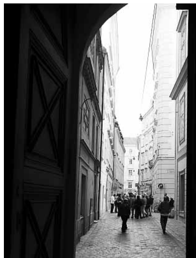
Backstreets of the Innere Stadt (p55)

Map pp254-5 % 790 91 00; www.wienerlinien.at; adult/child €15/5; U1, U2, U3 Karlsplatz, j D, J, 1, 2, 62, 65 On weekends and holidays from mid-May to October trams from 1929 trundle through Vienna taking people on one-hour tours of the city. They depart from the Otto Wagner Stadtbahn Pavillons on Karlsplatz at 11.30am and 1.30pm on Saturday and 9.30am, 11.30am and 1.30pm on Sunday.