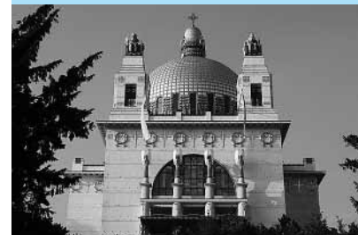
Kirche am Steinhof (p98)