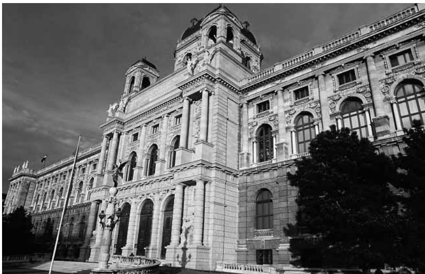
Kunsthistorisches Museum (p73)