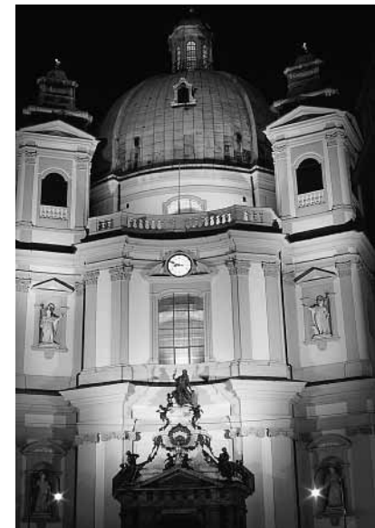
Night view of Peterskirche (this page)

Michaelerkirche is the oldest building on Michaelerplatz (as long as you discount the Roman ruins as buildings), and dates from the 13th century. Its rather dark interior