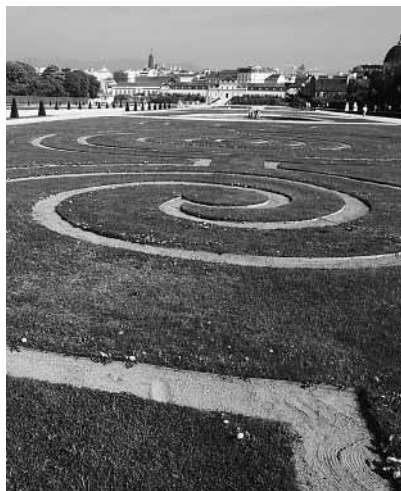
Belvedere Gardens (this page)

In addition, each district has its own Bezirksmuseum (district museum), with free entry and limited opening times – check addresses in the telephone book or at www.bezirksmuseum.at (in German).