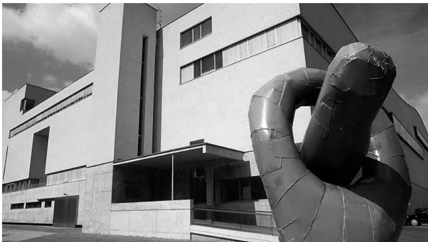
Sammlung Essl (this page)

of religious art from the Middle Ages to the present day. If you've ventured this far, however, you're better off including a guided tour on your itinerary, which takes in the cloister and the church (tours in English require advanced notice). The tour's highlight is the Verdun Altar in St Leopold's Chapel, an annexe of the church. Produced by Nicholas of Verdun in 1181, it is an unsurpassed example of medieval enamel work and is gloriously adorned with 51 enamelled panels showing biblical scenes.