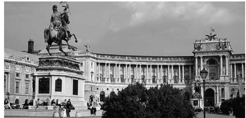
Statue of Archduke Karl (Charles of Austria) in front of the Neue Burg wing of the Hofburg (opposite page)

An audio guide is included in the price and the Schatzkammer is part of the Gold, Silver and Bronze discount tickets (p69). Allow anything from 30 minutes to two hours to get around.