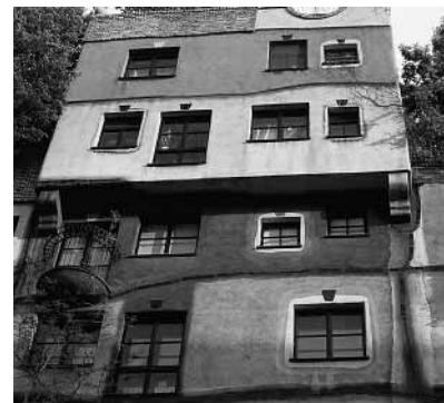
Façade of Hundertwasser Haus (this page)

Map pp262–3 03, Löwengasse/Kegelgasse; j N This residential block of flats was designed by Hundertwasser, Vienna's radical architect and lover of uneven surfaces. It is now one of Vienna's most prestigious addresses, even though it only provides rented accommodation and is owned by the city of