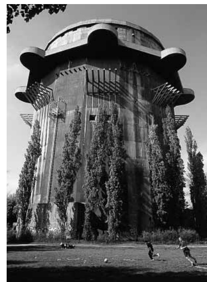
Flakturm in Augarten (this page)

Six flak towers still exist: two in Augarten (p79), one just off Mariahilfer Strasse in Esterházypark (housing the Haus des Meeres, p90) and another behind the MuseumsQuartier in the Stiftskaserne (Map pp260–1). Of the last two in Arenbergpark (Map pp262–3), one is used by MAK for temporary exhibitions (€5.50; 11 11am–4pm Sun–Nov); even if you're not interested in what's on show, it's worth paying the entrance fee just to see the inside of one of these WWII dinosaurs.