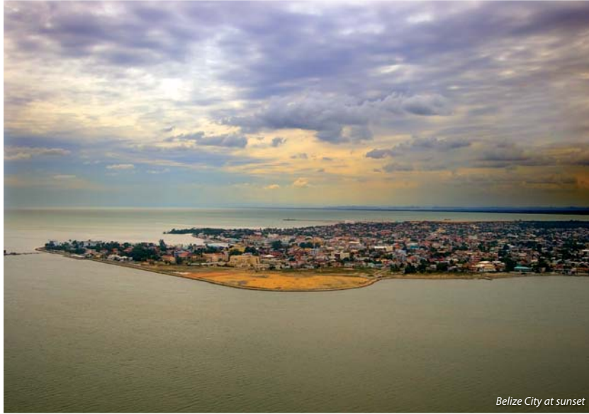
Belize City at sunset

The dive operators in Belize are working to create a unified standard and high level of training for divemasters and boat captains. Personalized service is also coming to the fore. Thus, the chances of getting a poor or unsafe service are much less than they were a decade ago, but it's still your hard-earned holiday time and money. Get satisfactory answers about the operation you are planning to dive with, including the type of equipment, boat, and its maintenance, the divemasters, insurance coverage, cost of diving, ratio of divemasters and divers in the water, details of the travel agent you are booking with and any other details that may be important.