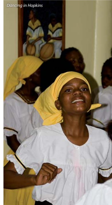
Dancing in Hopkins