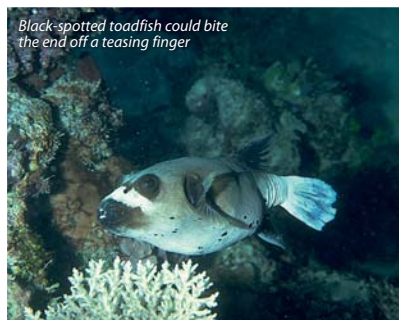
Black-spotted toadfish could bite the end off a teasing finger

Finish the dive in the shallows adjacent to the reef edge. It is an easy swim back to the boat – the bottom can be interesting for those willing to look hard for smaller, more cryptic life.