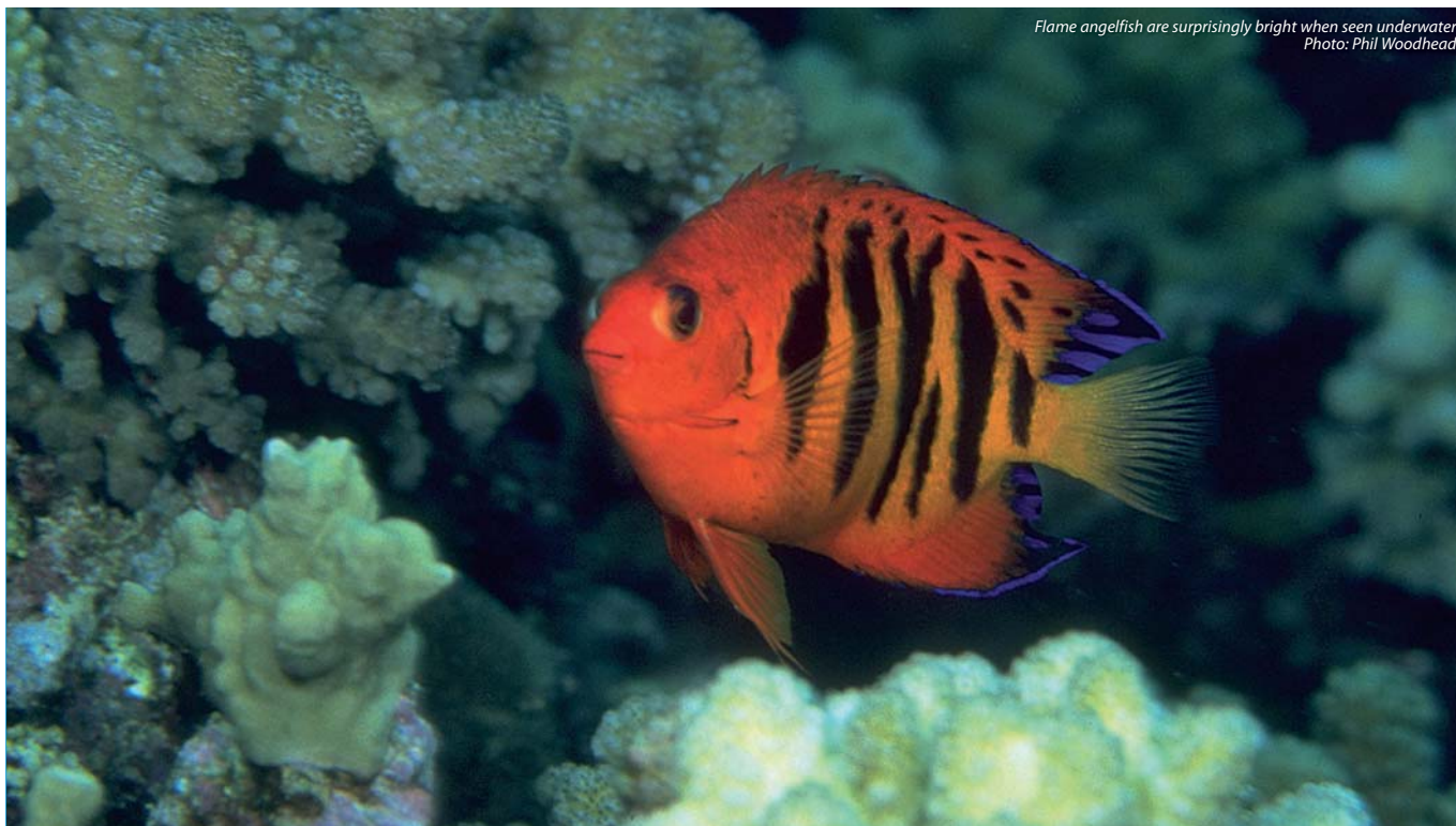
Flame angelfish are surprisingly bright when seen underwater