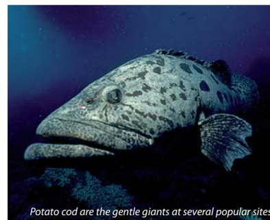
Potato cod are the gentle giants at several popular sites

For those who can tear their eyes away from the life on the pinnacle, there is the reward of shoals of fish regularly