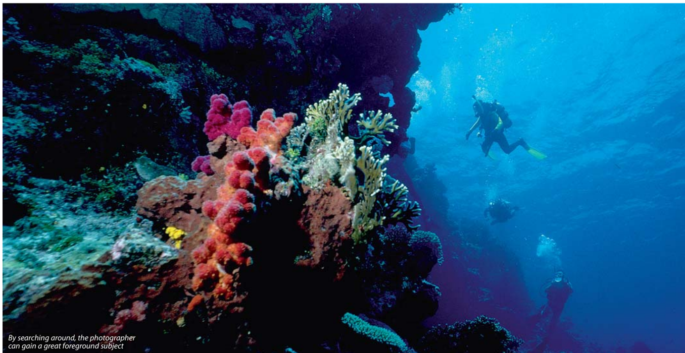
By searching around, the photographer can gain a great foreground subject