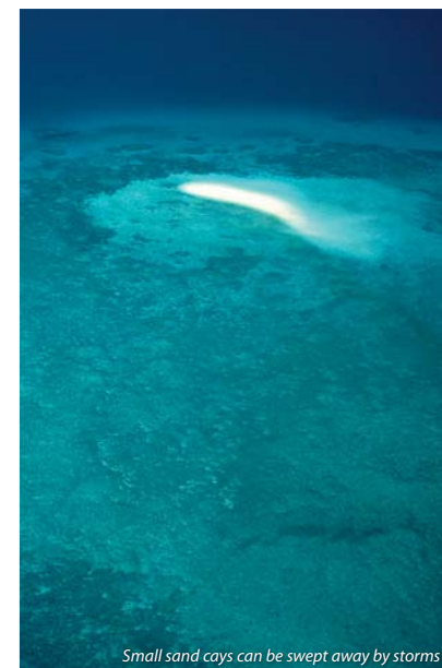
Small sand cays can be swept away by storms

The sand slopes down quickly over the edge, where coral heads provide a continuing range of good animal and plant life. This is a great spot for patient observers.