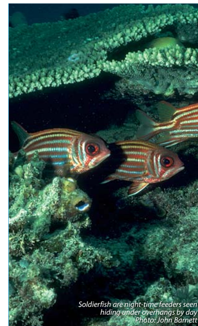
Soldierfish are night-time feeders seen hiding under overhangs by day

The reef shallows near the pinnacle are perfect for snorkelers and as a safety stop. Giant clams can be seen, along with lizardfish, parrotfish, wrasse, damselfish and rays. As the small plankton feeding blue-green chromis are approached, they will dart back into the staghorn corals for protection.