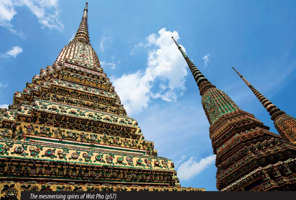
The mesmerising spires of Wat Pho (p57)

Same same, but different. It's Thai-style philosophy that neatly sums up Bangkok, a city combining the tastes of many places into a unique and often-spicy dish that is never, ever boring.