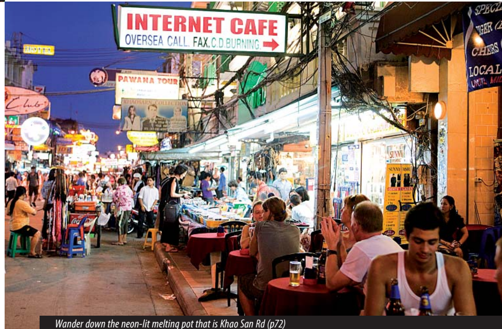
Wander down the neon-lit melting pot that is Khao San Rd (p72)

What these movements towards the city's future, whether in art, mass transport or urban planning, signal is that the turbulent politics and relative economic slowdown have done little to blunt Bangkok's almost urgent rush forward. Jump on.