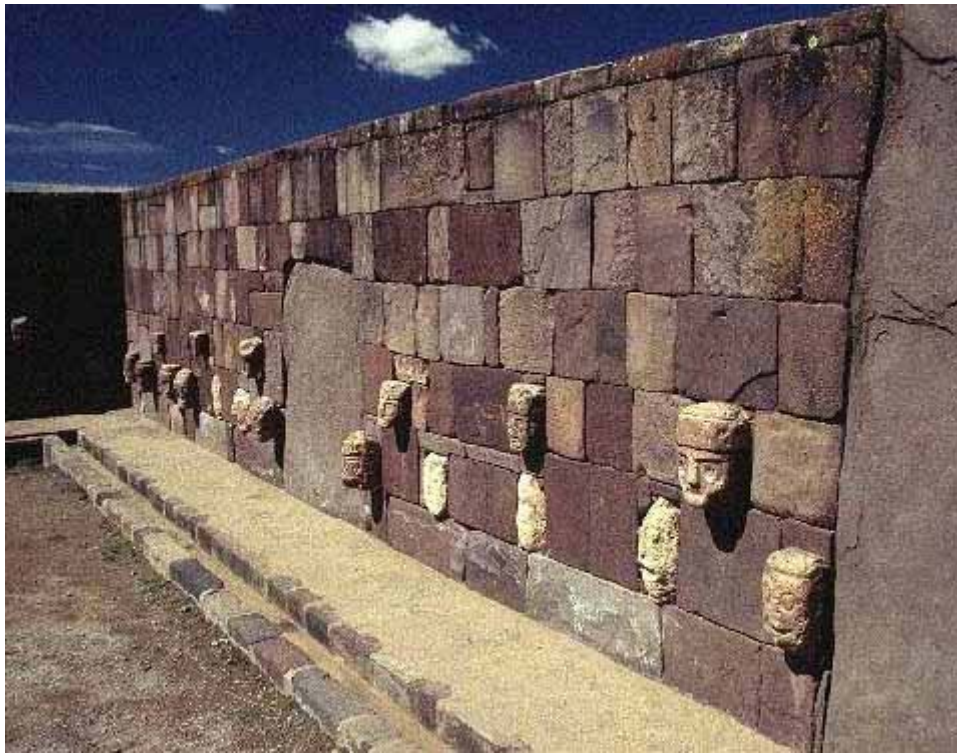
THE STATUES OF TIAHUANACU

Adjacent to the sunken court, residences of the elite were revealed, while under the patio the remains of a number of seated individuals, believed to have been priests, faced a man with a ceramic vessel that displayed a puma-an animal sacred to the Tiahuanaco. Ritual offerings of llamas and ceramics, as well as high-status goods made of copper, silver and obsidian were also encountered in this elite residential area. The cut-stone building foundations supported walls of adobe brick, which have been eroded away by the yearly torrential rains over the centuries.