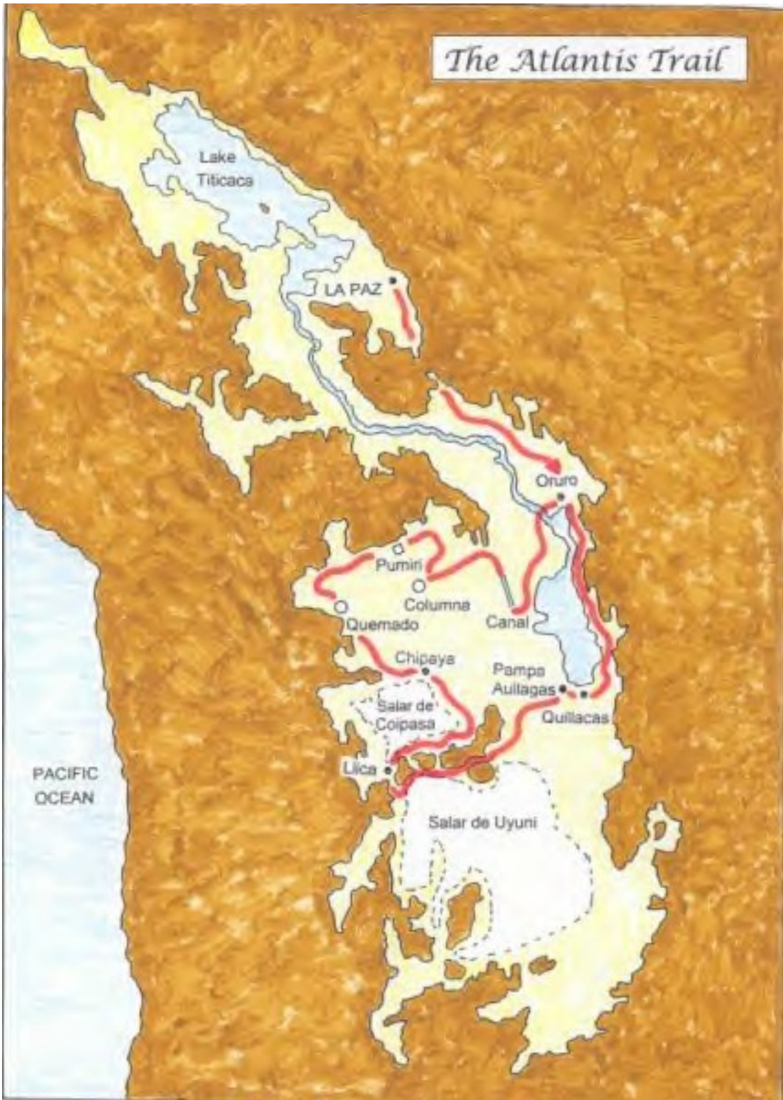
Present Geography of The Lost Sea of The Andes