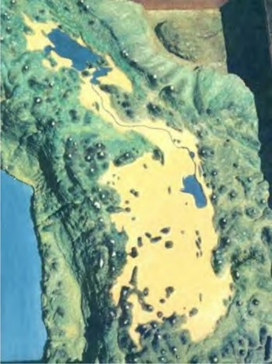
The Area of the Lost Sea of The Andes