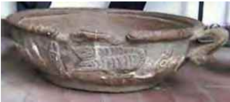
Lake Titicaca Ancient Bowl