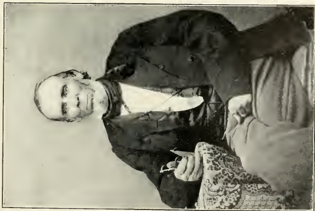
J. Q. THORNTON Judge of the Provisional Supreme Court, who made the mission to Wash- ington in 1848.