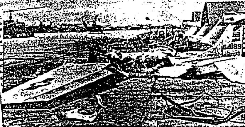
CRUMPLED ALLIED PLANES AT PHNOM-PENH'S POCHENTONG AIRPORT