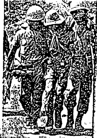
CAMBODIAN TROOPS AT PCH NHI PAS