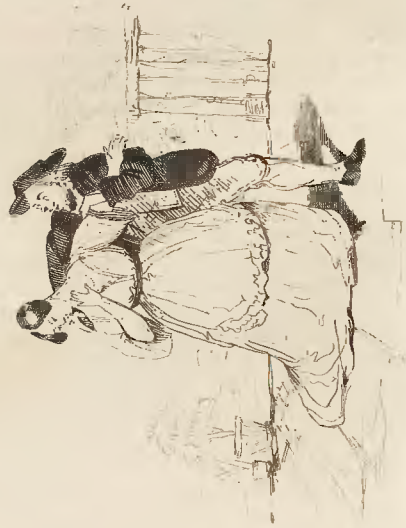
Another would "buss her" because she was George's wife.

Upon their return home, George and his lady found a commodious dwelling handsomely furnished for their reception. Mr. Smith presented him this in lieu of the check of which he had spoken before the marriage of his daughter; and though the gift did not redeem the promise by $14,000; George was perfectly satisfied. Mrs. Smith added to the donation her own cook and carriage-driver. Flora, the maid, had been considered Evelina's from her infancy. Nothing could have been