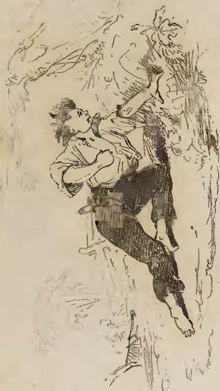
A Lincoln Rehearsal