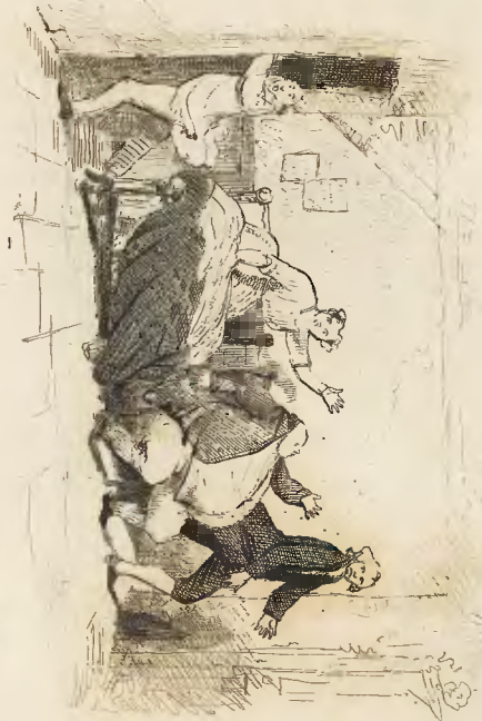
The Wax Works Daniel Lambert, Sleeping Beauty & Genl. Washington

While the three gentlemen just named were gazing on the figures before them, Jack took it into his head to try a little experiment upon Miss Failes's muscles, through the sensibilities of her head; accordingly, he tightened his grip suddenly upon her hair. This brought from her a slight wince; but Jack did not per-