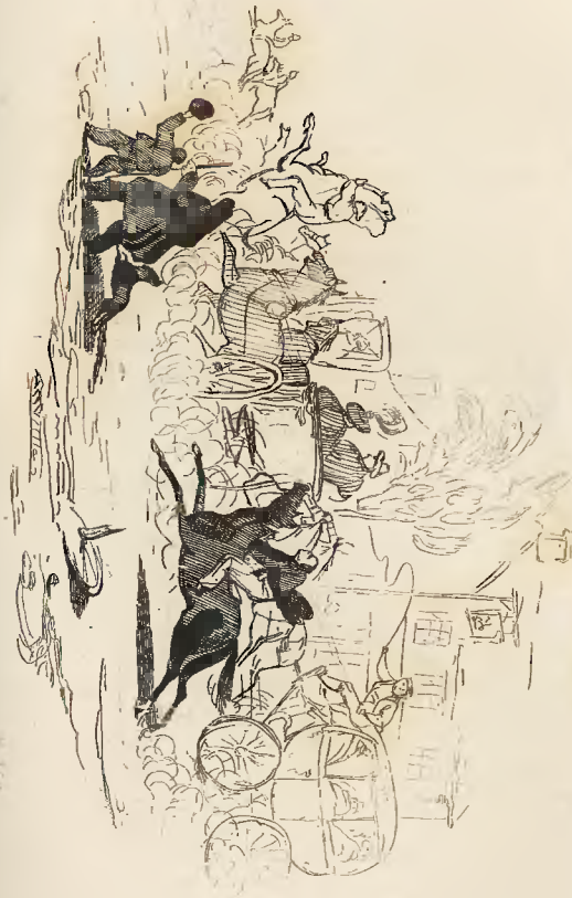
HURRYING TO THE RACES

We went early, when as yet no one had reached the ground but those who occupied the booths for the purpose of traffic. It was not long, however, before crowds of persons, of all ages, sexes, conditions, and complexions, were seen moving towards the booths; some on foot, some on horseback, some in gigs, some in carriages, some in carts, and some in wagons. The carriages (generally filled with well-dressed ladies) arranged themselves about thirty or forty paces from the starting-point, towards the centre of the turf. Around these circled many young gentlemen, each riding his prettiest, whipping, spurring, and curbing his horse into the most engaging antics, and giving visible token that he thought every eye from the carriages was on him, and every heart overpowered by his horsemanship. As many more plied between the booths and carriages, bearing messages, rumours, apples, oranges, raisins, lemonade, and punch.