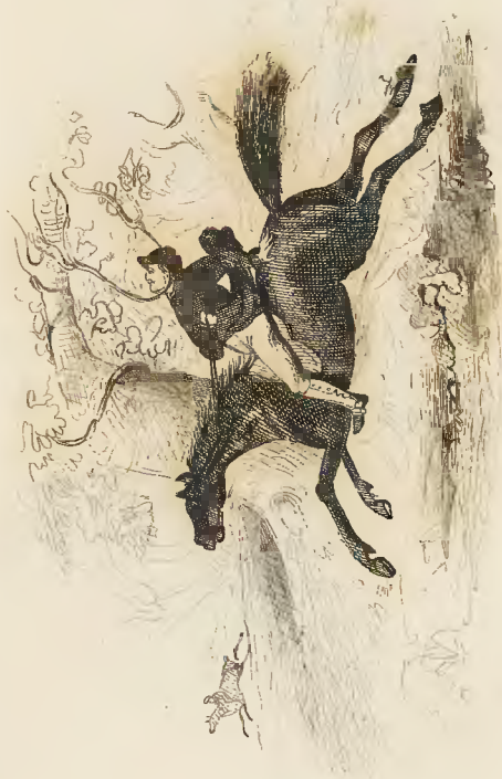
The Fox Hunt.