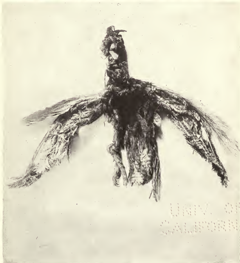
CONTENTS OF THE OWL SACRED PACK