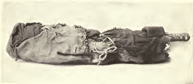
a. THE OWL SACRED PACK WITH THE OUTER WRAPPING OFF