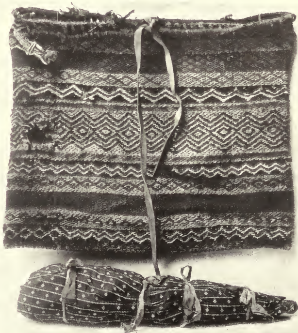
b. FIBER BAG IN WHICH THE OWL SACRED PACK WAS KEPT WRAPPINGS OF THE OWL SACRED PACK